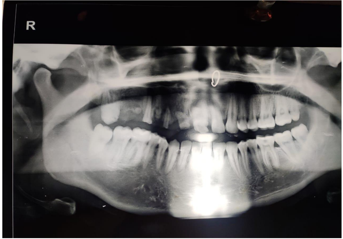
Figure 1 (b):-