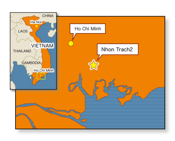
(Location of Nhon Trach 2 Power)