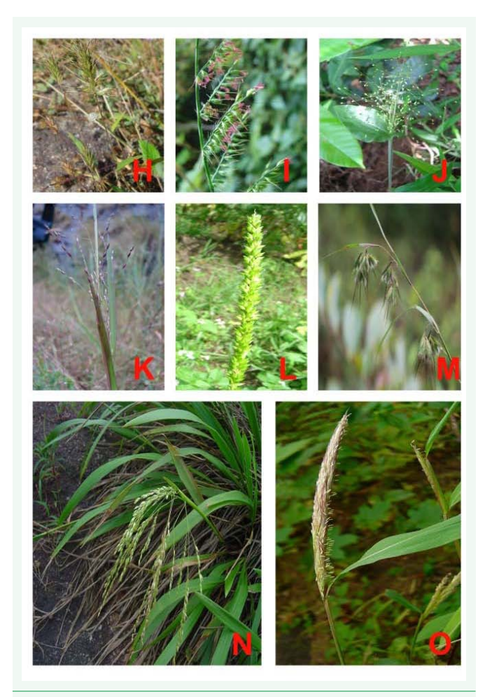
Figure 3 H.Jansenella griffithiana, I.Oplismenus composites, J.Panicum brevifolium, K.Panicum gardenerii, L.Sacciolepis indicum, M.Themeda triandra, N.Zenkeria elegans, O.Spodiopogon rhiophorous

Out of the 77 Species, 18 are Endemic to Peninsular India in the study area. This biological diversity is often measured by the magnitude of Endemic Species. 18 endemic Species is a clear evidence of the richness of plant diversity in these hills. This is again of biological significance in the context that the present study area has been subjected to many anthropogenic activities like Agriculture and Tourism development. There are 25 Species of grasses recognized as exotic alien species in the study area. These exotics indicate the degrading nature of grasslands that may be due to the activities of human beings related to agriculture and other programmes. Ecological niches