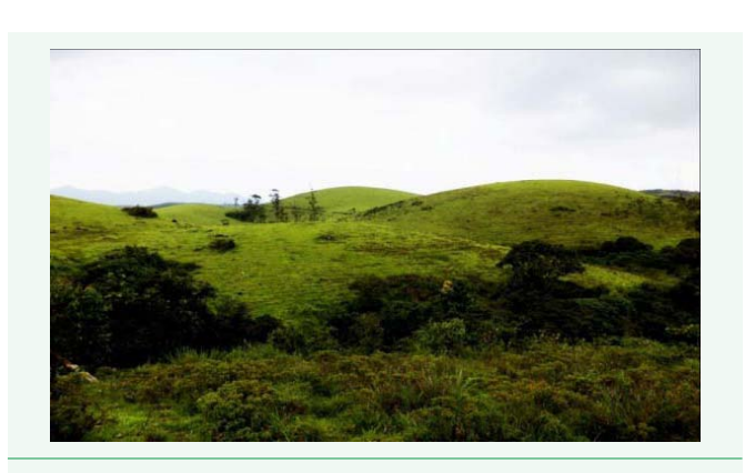
Figure 1 TOPOGRAPHY OF VAGAMON.

formalin there and the bundles were kept in tight polythene bags. After coming from study area all these specimens were spreaded out in loose papers then pressed them among blotting papers. Blotting papers were changed every day for 6-10 days so that it soaks water and moisture. Now, it is ready to poison but since these are treated with formalin so there's no need to poison. Now these are mounted on mounting sheets (24x42 cm) and plant specimens were identified and analysed according to their Habit and conservation status [1,2]. Photographs of the major plants were taken and are also incorporated in the research (Figure 2). Grass flora of Vagamon hills were also compared with other