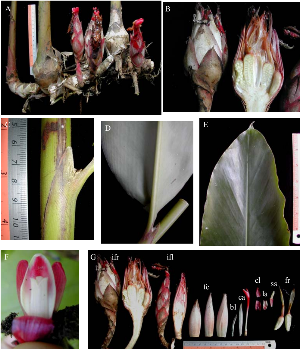
Figure 5. Hornstedtia scottiana . A. Radical inflorescence. B. Inflorescence, close-up with dissection. C. Ligule and base of leaf blade. D. Apex of leaf blade. E. Base of leaf blade. F. Flower, close-up. G. Flowers, close-up: ifr = infructescence with dissection, ifl = inflorescence with dissection, fe = fertile bract, bl = bracteole, ca = calyx, cl = corolla lobe, la = labellum, ov = ovary, ss = stamen and stigma, fr = fruit. M. Ardiyani 219 .