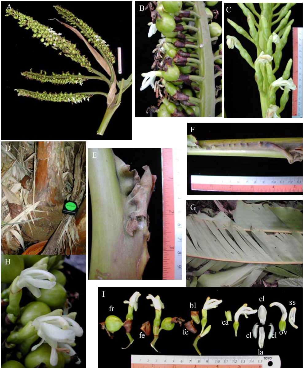
Figure 2. Alpinia regia . A. Inflorescence with some open flowers. B. Inflorescence, close-up, shows secund inflorescence. C. Young inflorescence. D. Base of leafy-shoot. E. Ligule and base of winged petiole. F. Petiole. G. Leaves. H. Flowers, close-up. I. Flowers: fe = fertile bract, bl = bracteole, ca = calyx, cl = corolla lobe, la = labellum, ov = ovary, ss = stamen and stigma, fr = fruit. M. Ardiyani 220.