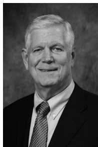
Richard B. Myers, MBA

Richard B. Myers returned to his home state and alma mater when he was appointed interim president of Kansas State University in April 2016 by the Kansas Board of Regents. He was appointed president in November 2016.