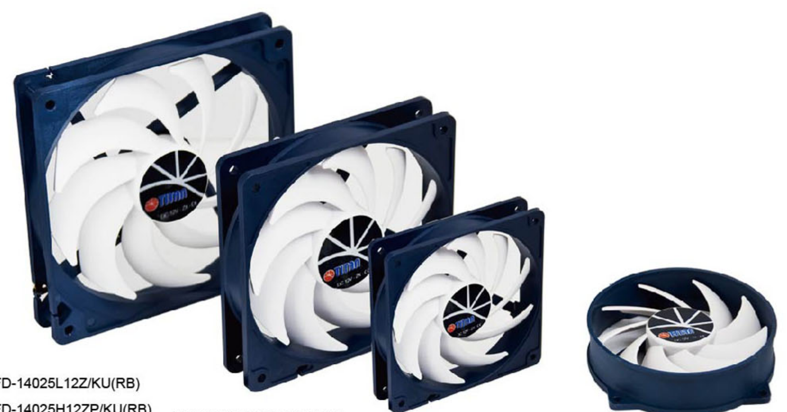
TFD-14025L12Z/KU(RB) TFD-14025H12ZP/KU(RB) TFD-12025H12ZP/KU(RB) TFD-12025SL12Z/KU(RB) TFD-9225M12Z/KU(RB) TFD-9225H12ZP/KU(RB) TFD-9525H12ZP/KU(RB)