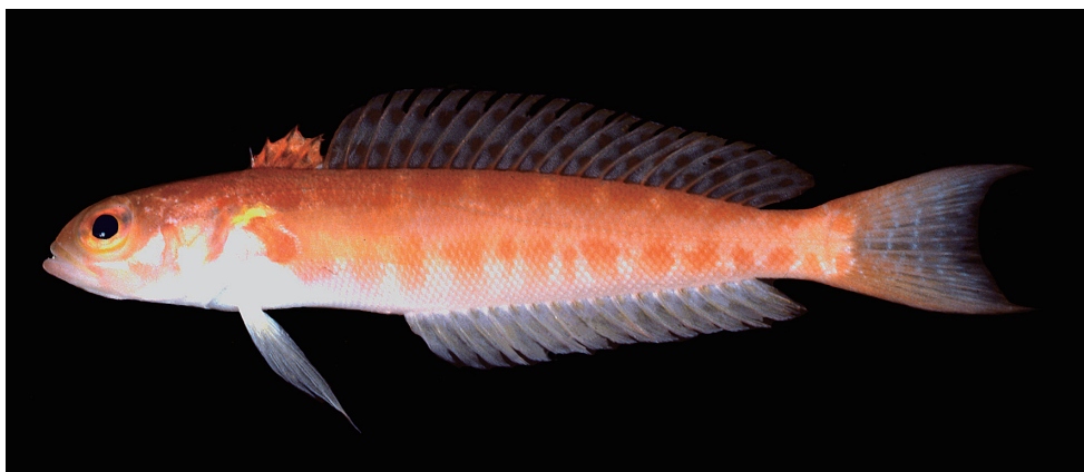
Fig. 7. Paratype of Parapercis natator , BPBM 35226, female, 54.4 mm, Ani-jima, Ogasawara Islands, 45 m.

ginate in females, lunate in males; pectoral fins slightly emarginate, 4.2–4.7 in SL; pelvic fins reaching or extending slightly posterior to origin of anal fin, 3.8–4.75 in SL; color of males in alcohol pale yellowish with a slightly oblique, broad, purplish gray bar anteriorly on body, bordered by a pale bar and a narrow purplish gray bar; color of females in alcohol pale yellowish; base of membranes of spinous portion of dorsal fin dark brown; color of males in life red to violet-red dorsally, grading to lavender-pink ventrally, with a yellow bar beneath anterior fourth of soft portion of dorsal fin, bordered by a pale-edged bright red bar; spinous portion of dorsal fin orange-red, the soft portion with many yellow spots; lobes of caudal fin deep red; a bright red spot at base and axil of pectoral fins; color of females in life light red dorsally on body with 10 darker red bars on about upper one-fourth that are narrower posteriorly; a series of 14 orangish pink bars of unequal width on lower side of body; spinous portion of dorsal fin bright orange-red, deep red to blackish at base except last membrane white; soft portion of dorsal fin with many red spots; lobes of caudal fin red; base and axil of pectoral fins in a bright red spot bordered by white; juveniles with a narrow orange stripe, bordered by white, from behind eye to upper base of caudal fin, the anterior third showing paler lateral line; ventral half of body pink; spinous portion of