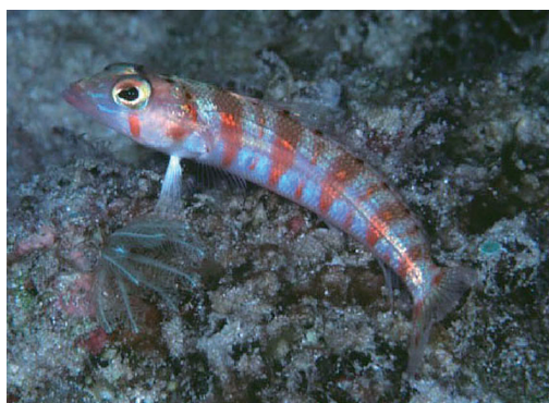
Fig. 2. Parapercis basimaculata , Nakanose, near Ie-jima Island, Ryukyu Islands, 58 m.

Color of holotype in alcohol pale yellowish with a dark brown blotch larger than pupil above opercle; 3 pairs of small dark brown spots dorsally on postorbital head, the middle pair largest, the posterior pair within anterior scaled area of nape; 2 pairs of small dark brown flecks on scale edges below spinous portion of dorsal fin, 1 above and 1 just below lateral line; another pair of small flecks on lateral line below second to third dorsal soft rays; a single dark fleck on lateral line below base of sixth dorsal soft ray, followed by 6 similar flecks to base of caudal fin; fins translucent pale yellowish; soft portion of dorsal fin with a series of 8 dark brown spots of near-pupil size, each on base of a ray; anal fin with 3 similar but smaller spots basally on twelfth, fifteenth, and