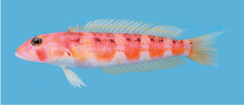
Fig. 4. Holotype of Parapercis katoi , KPM-NI 19613, 166.8 mm, Chichi-jima, Ogasawara Islands, 200 m.