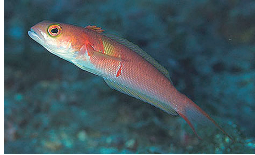
Fig. 8. Male of Parapercis natator , Yaku-shima Island, 30 m. Photograph KPM-NR 88527 by Shigeru Harazaki.

Gill membranes free from isthmus, with a broad free fold across. Gill rakers short and spinous, the longest nearly one-half length of longest gill filaments. Nostrils small, the anterior at level of dorsal edge of pupil (as viewed from side), about half way to groove at edge of upper lip, with a slight rim anteriorly and a posterior flap that reaches about half way to posterior nostril when laid back; posterior nostril dorsoposterior to anterior nostril, the aperture ovate, with a fleshy rim that is largest anteriorly. Cephalic sensory system includes a dorsal series of 6 pores on each side: first at front of snout before anterior nostril, the second a tiny pore above anterior nostril, the third between nostrils, and the fourth to