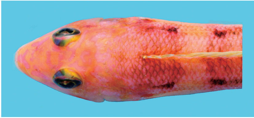
Fig. 5. Dorsal view of head of holotype of Parapercis katoi .

29; gill rakers 4+12 (3–4+12–13); pseudo-branchial filaments 21 (19–23); branchiostegal rays 6; vertebrae 10+20.