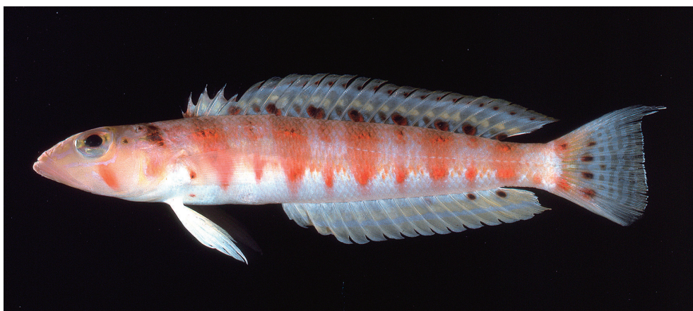
Fig. 1. Holotype of Parapercis basimaculata , NSMT-P 78771, 77.5 mm SL, Sesoko Island, Okinawa.

about two-thirds orbit diameter posterior to central margin of fin; pectoral fins 4.4 in SL; pelvic fins just reaching anus, 4.75 in SL; color in alcohol pale yellowish with a large dark brown blotch above opercle; 3 pairs of small dark brown spots dorsally on postorbital head, the middle pair largest, the posterior pair within anterior scaled area of nape; base of soft portion of dorsal fin with a series of 8 dark brown spots; caudal fin with a vertical series of 4 dark spots; posterior part of anal fin with 3 basal dark spots. Color when fresh light reddish brown, grading to white ventrally, with 5 broad, triangular, dark reddish brown bars across body, and a narrow, uniformly wide, reddish brown bar between each pair of larger bars; 2 longitudinal rows of red spots within bars, 1 dorsal and 1 ventral, each red spot of dorsal row with a dark brown fleck or pair of flecks; postorbital head with dark brown spots as in preservative; an oblique red bar on cheek; dark spots on fins as described for preserved specimen.