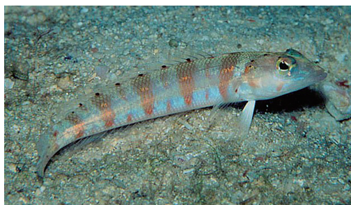
Fig. 3. Parapercis basimaculata , Seragaki, Okinawa, 50 m. Photograph KPM-NR 80807 by Yasuaki Miyamoto.

last membranes; caudal fin with a curved vertical series of 4 dark spots a little before center of fin, the 2 middle spots largest; a single dark spot on lower base of pectoral fins.