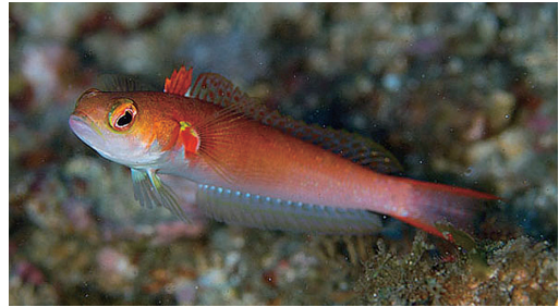
Fig. 9. Female of Parapercis natator , Yaku-shima Island, 30 m. Photograph KPM-NR 88528 by Shigeru Harazaki.