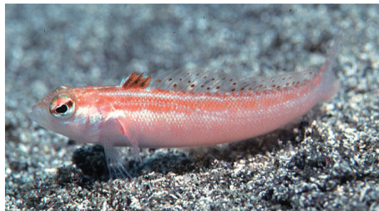
Fig. 10. Juvenile of Parapercis natator , Osezaki, Suruga Bay. Photograph KPM-NR 21994A by Yukihiko Otsuka.

sixth in anterior half of interorbital space, the sixth with a paired medial pore; 2 to 4 small pores medially in posterior interorbital space; a triangular patch of 7 or 8 small pores middorsally on posterior part of occiput; an irregular transverse double row of small pores posteriorly on occiput, with ventral branches onto opercle and