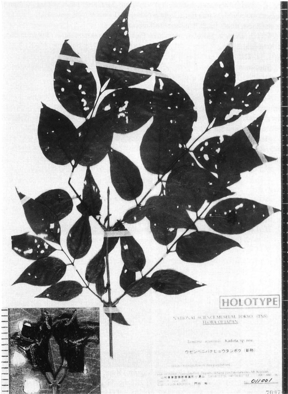
Fig. 3. Type of Lonicera uzensis Kadota (JAPANA: Honshu; Yamagata Pref., Takahata-machi, Mt. Koyōzan, 660 m, 5 June 2001. Y. Kadota 011001, holotype, TNS). Left corner inset shows an inflorescence (holotype).