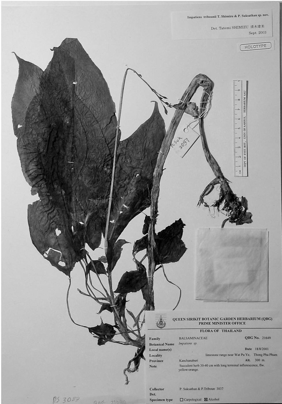
Fig. 1. Holotype of Impatiens tribounii .