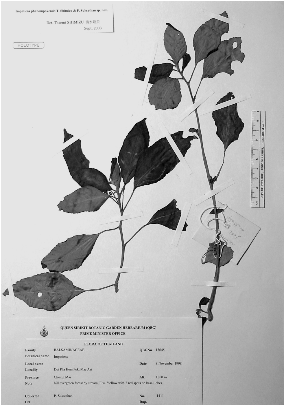
Fig. 2. Holotype of Impatiens phahompokensis .