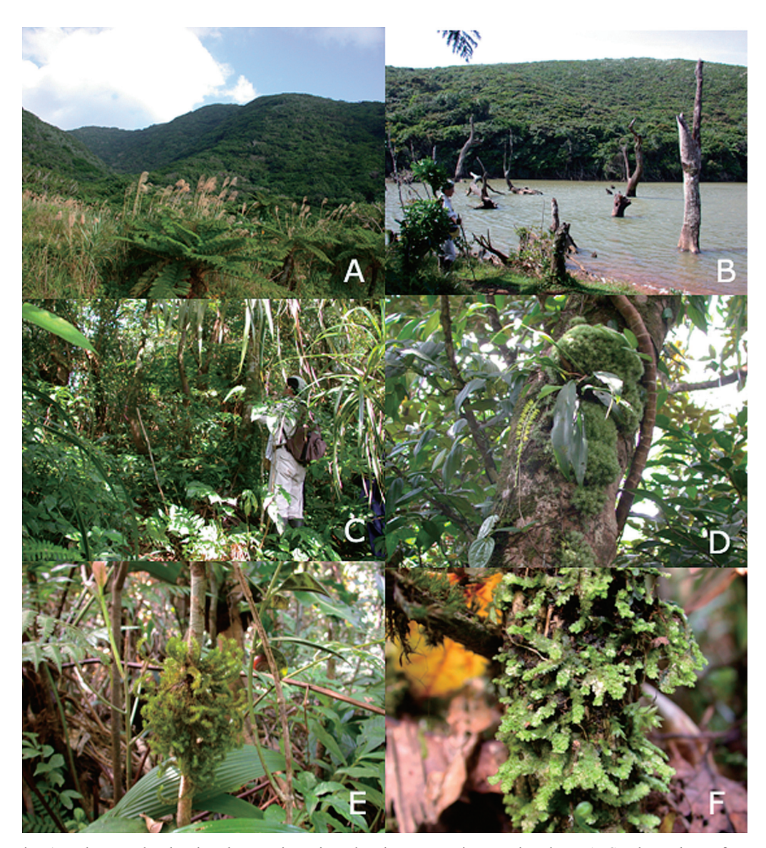
Fig. 1. Photographs showing the area investigated and some species growing there. A. Southern slope of Mt. Hongtoushan. B. Datienchi. C. Forest floor near the summit of Mt. Hongtoushan. D. Leucobryum bowringii growing on tree-trunk mixed with Leucophanes angustifolium . E. Garovaglia elegans growing on low tree. F. Distichophyllum mittenii growing on tree-trunk mixed with Hookeria acutifolia .

The mosses recognized in this study comprise 23 families, 39 genera and 62 species. Twenty seven species are new additions to the moss flora