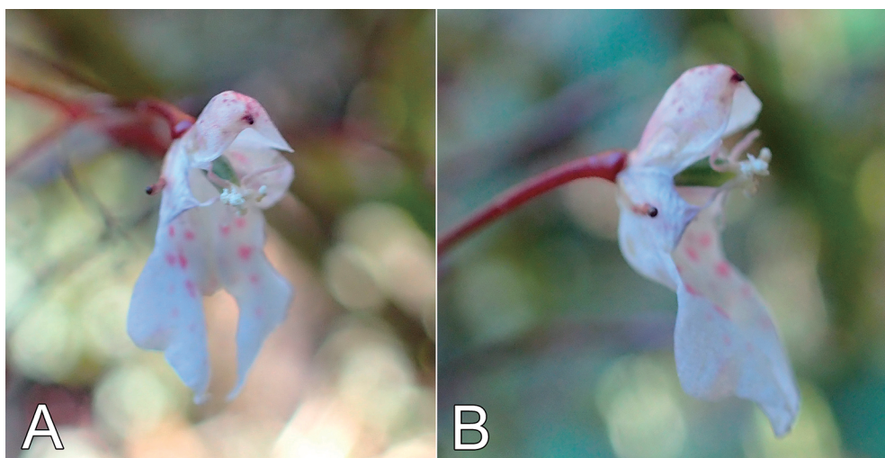
Fig. 1. Impatiens radiata Hook. f. var. mindatensis at the type locality in Myanmar. A. Front view. B. Lateral view.

margaritifera Hook. f. in Yunnan, Tibet, and Szechuan has spurless flowers and similar to this new variety but differs from the latter by having uninterrupted racemes and larger flowers (to 2 cm long) (Chen et al. , 2007). To clarify the pollination of spurless flowers in I. radiata and other species of Impatiens more detailed observations and studies in the field are needed.