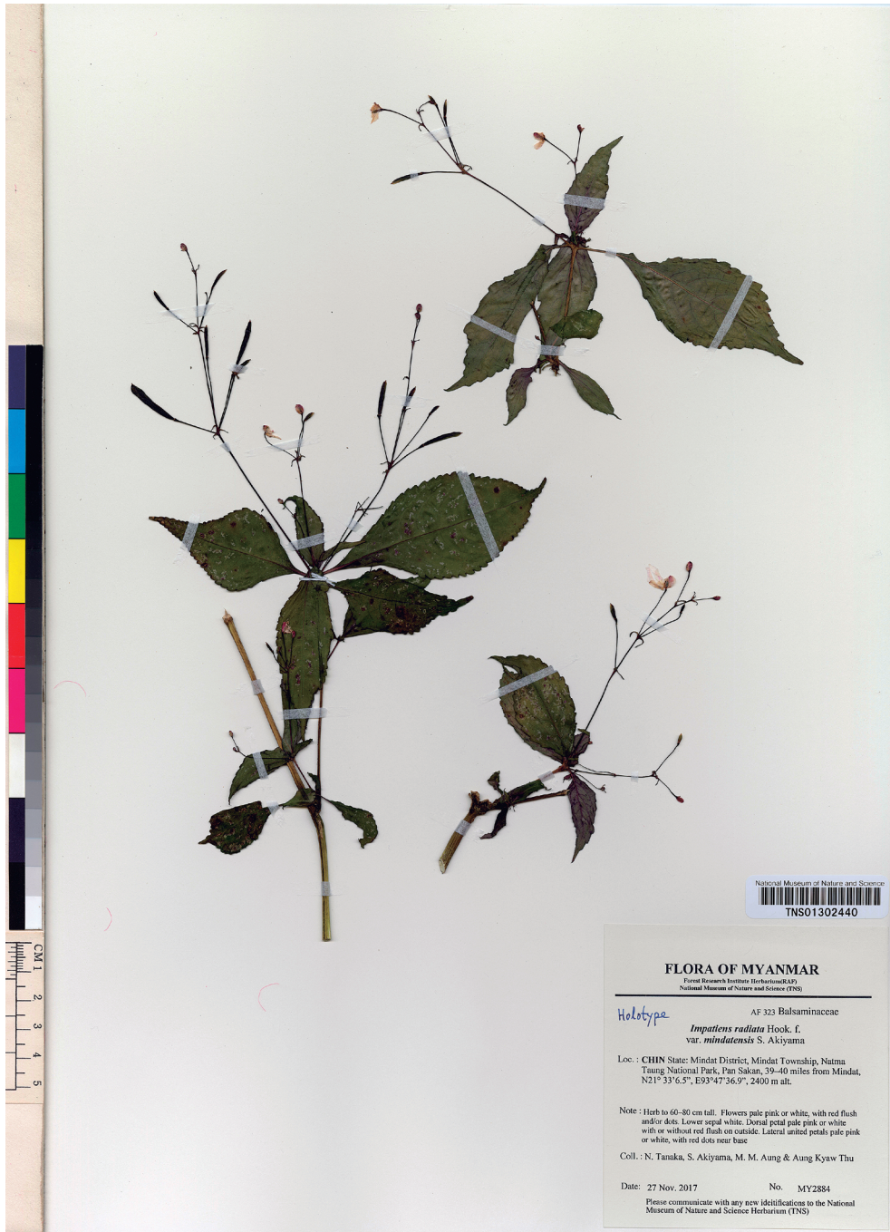
Fig. 3. Holotype of Impatiens radiata Hook. f. var. mindatensis S. Akiyama. (S. Akiyama et al. MY2884, TNS).

3.5 mm wide, apex obtuse; appendage indistinct. Stamens 5; filaments linear; anthers ovoid, connective glabrous, without appendages. Ovary linear. Fruit ca. 2 cm long, linear. Seeds ovoid, ca.