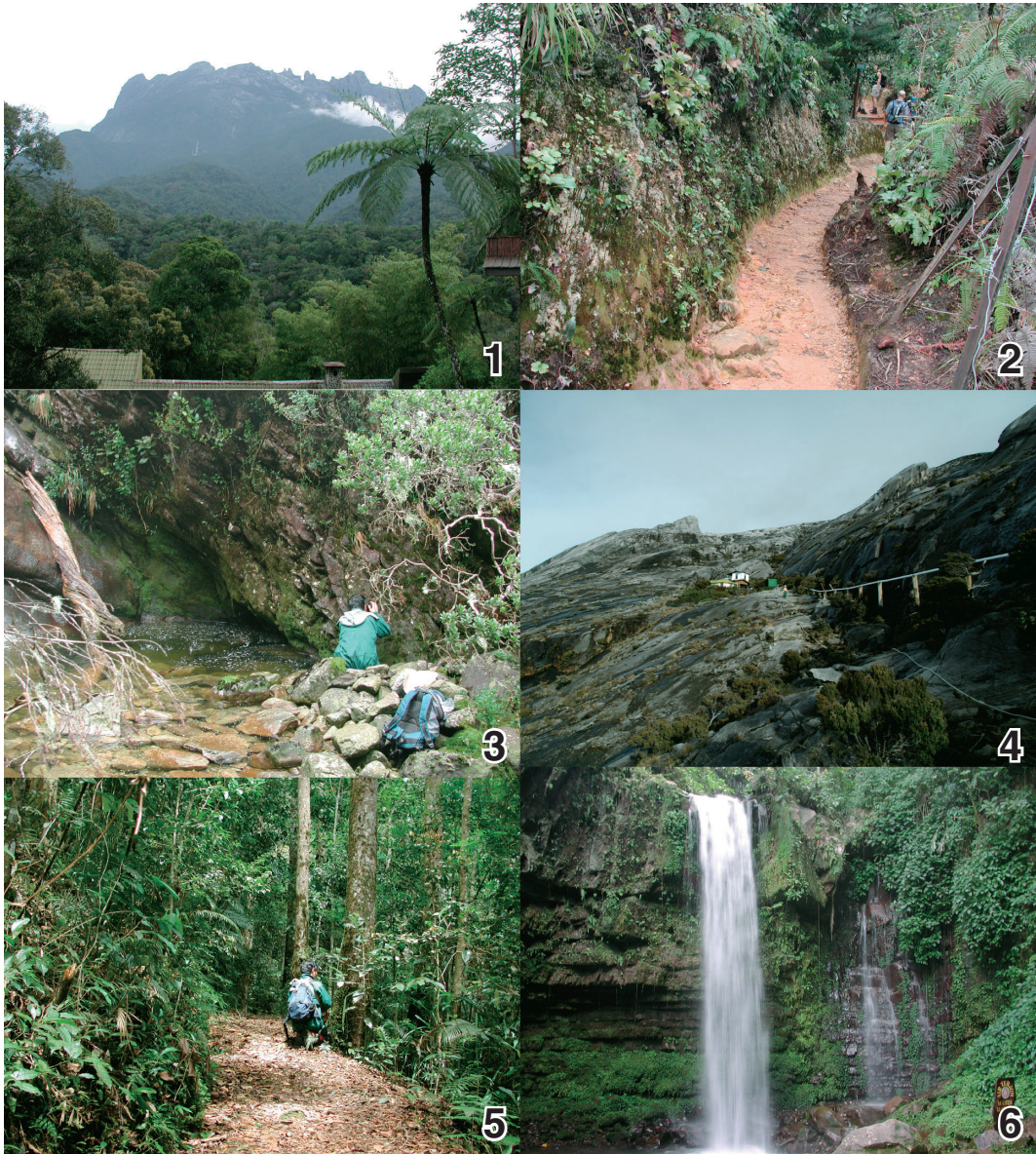
Fig. 1. Photographs showing the area investigated. 1. View of Mt. Kinabalu from the Park Headquarters. 2. Trail between the Timpohon Gate and Layang Layang where Dawsonia beccarii is growing. 3. Gorge near Paka Cave where Takakia lepidozoides is growing. 4. Sayat Sayat Mountain Hut. 5. Forest along Silau Silau trail. 6. Mahua Waterfalls.

III: Mt. Kinabalu, from Laban Rata (3270 m alt.) to Low's Peak (4095 m alt.), along trail, September 9, 2005.