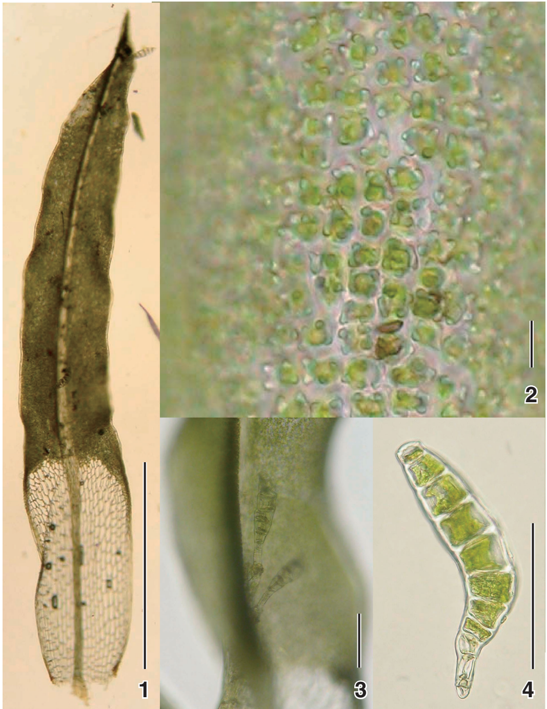
Fig. 2. Syrrhopodon tjibodensis . 1. Leaf. 2. Median laminal cells. 3. Gemmae arising from near limb base of adaxial leaf surface. 4. Gemma. Scales for 1 in 1 mm, for 2 in 10 \mu\text{m} and for 3 & 4 in 100 \mu\text{m} . (All from Higuchi 45059.)