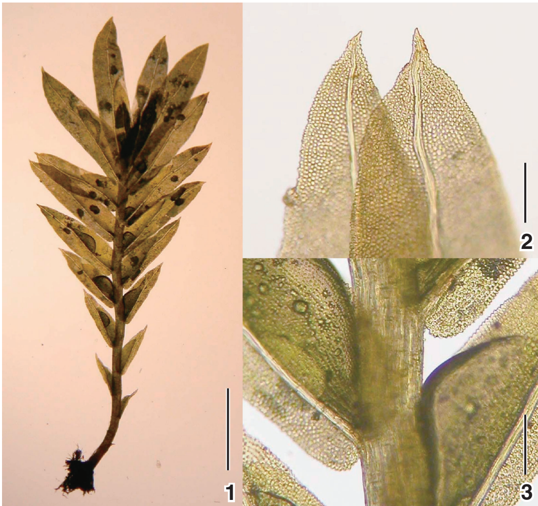
Fig. 4. Fissidens braunii . 1. Plant. 2. Apical parts of leaves. 3. Basal parts of leaves. Scales for 1 in 1 mm and for 2 & 3 in 100 \mu\text{m} . (All from Arikawa 5321.)

Fissidens javanicus Dozy & Molk., Bryol. Jav.