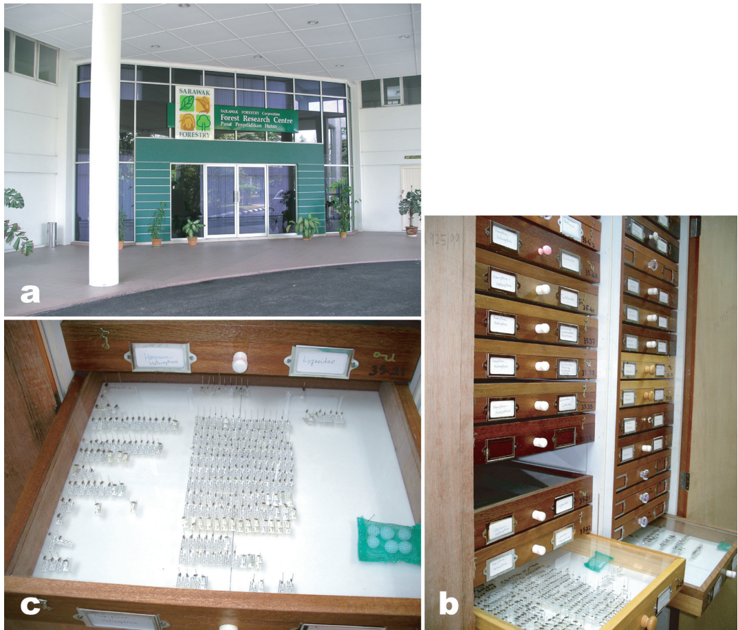
Fig. 1. Rhyparochromine collection in Sarawak, Malaysia. a, Forest Research Centre (FRC) in Kuching. b, a cabinet for Heteroptera specimens in FRC. c, a container of Rhyparochromidae in FRC.

All the material in FRC were collected in Lambir Hills National Park near Miri under a Japan-Malaysia cooperative project, “Canopy Biology Program (CBP)”, using UV light traps set on a tree tower at heights of 17, 25, 35, and 45 m. The material in NSMT were collected by myself in Kubah National Park, 20 km NW of Kuching, and Lambir Hills National Park under the projects “Biodiversity Inventory in the Western Pacific Region” conducted by the Museum in 2007–2009, and “Insect Inventory Project in Tropical Asia (TAIIV)” in 2001–2008 conducted by Prof. Osamu Yata of the Kyushu University, Fukuoka, Japan.