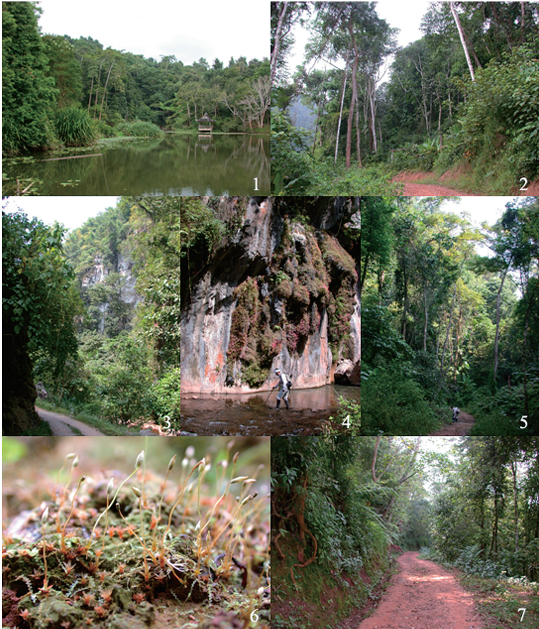
Fig. 1. Photographs showing the area investigated. 1. Xishuangbanna Tropical Botanical Garden. 2. Forest southeast of Xishuangbanna Tropical botanical Garden. 3, 4. Limestone gorge near Mengjuan. 5. Tropical rain forest at Xiaolongha. 6. Pogonatum camusii growing on soil at trail south of Wanhienshu. 7. Tropical monsoon forest northwest of Mengla.

I: Menglun, Mengla County, Xishuangbanna Tropical Botanical Garden (21°55'N, 101°16'E, 550 m alt.), along trail, October 19, 2007 (Fig. 1: 1).