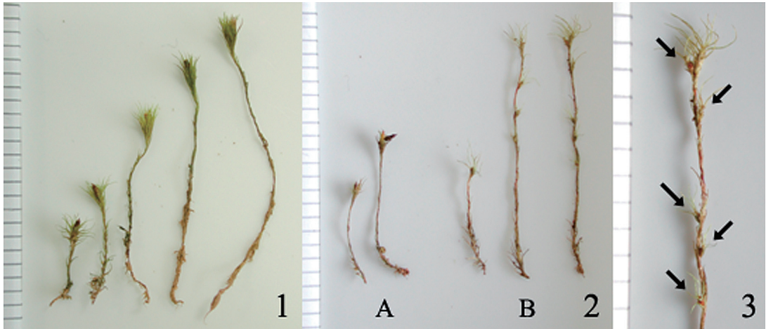
Fig. 2. Garckea flexuosa . 1. Plants with sporophytes. 2. Plants with sporophytes (A) and plants with perigonia (B). 3. A part of male plants. Arrows showing perigonia. Scales for 1–3 in 1 mm. (1 from Higuchi 48544; 2, 3 from Higuchi 48656.)