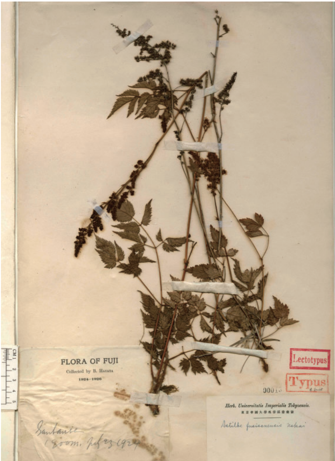
Fig. 4. Astilbe fujsanensis Nakai. Mt. Fuji, Sambanse (B. Hayata, July 1924, TI-lecto).