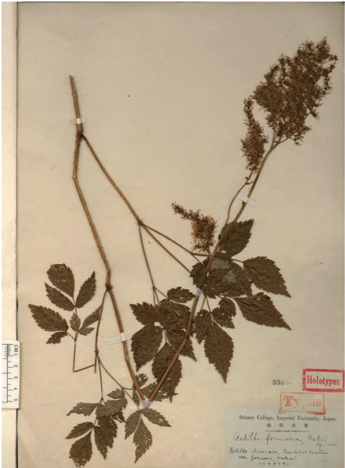
Fig. 6. Astilbe formosa (Nakai) Nakai. Nagano Pref., Mt. Yatsugatake (Y. Yabe, 21 Aug. 1902, TI-holo).