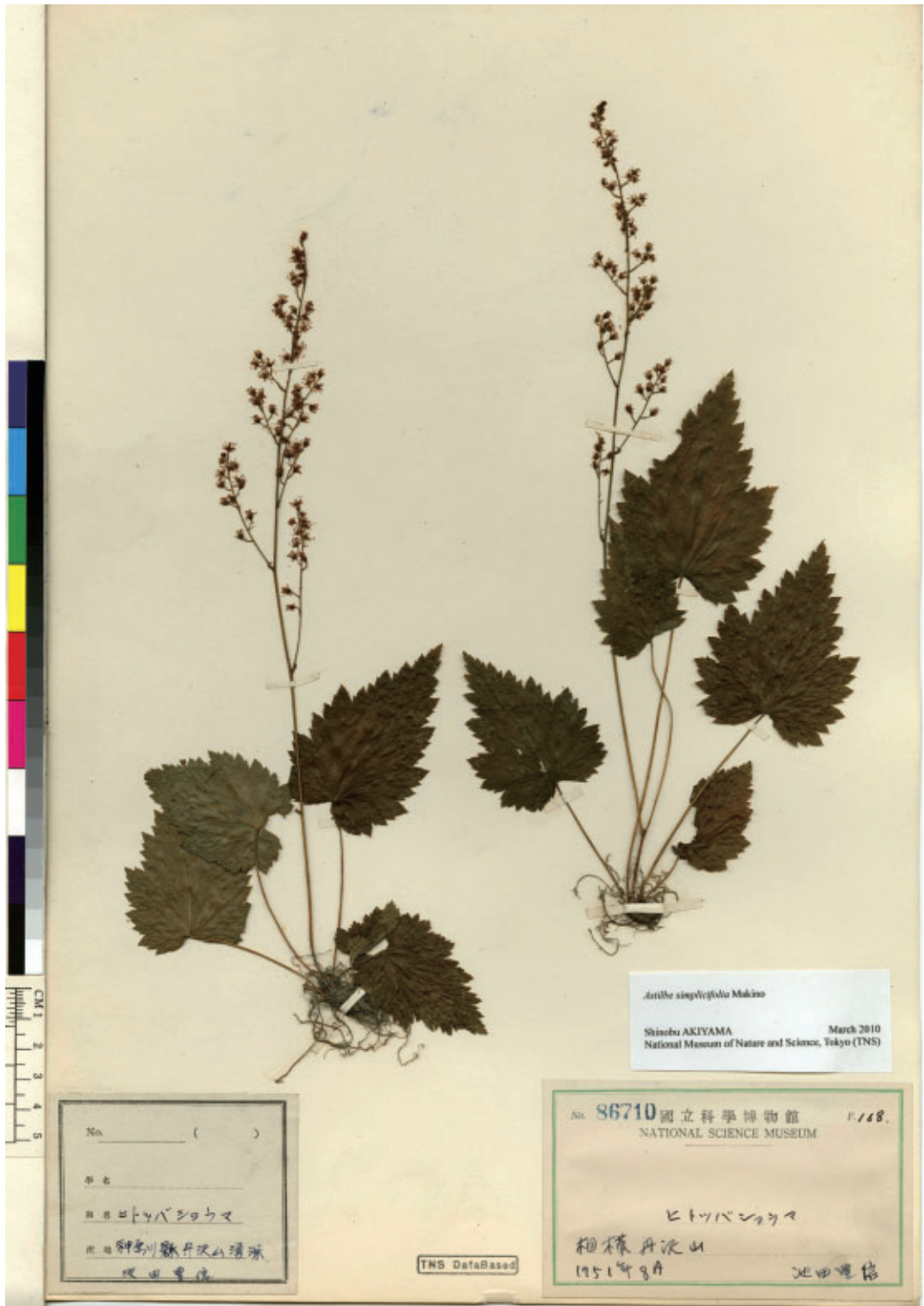
Fig. 2. Astilbe simplicifolia Makino. Kanagawa Pref., Mt. Tanzawa (T. Ikeda, Aug. 1951, TNS).