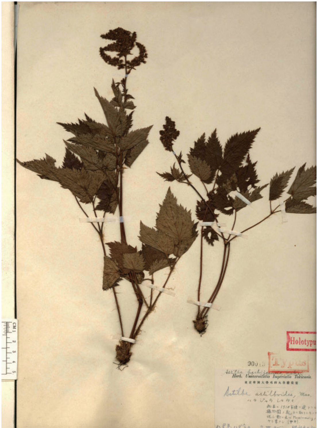
Fig. 5. Astilbe hachijoensis Nakai. Tokyo Pref., Is. Hachijo, Mt. Hachijofuji (H. Hattori, 7 July 1905, TI-holo).