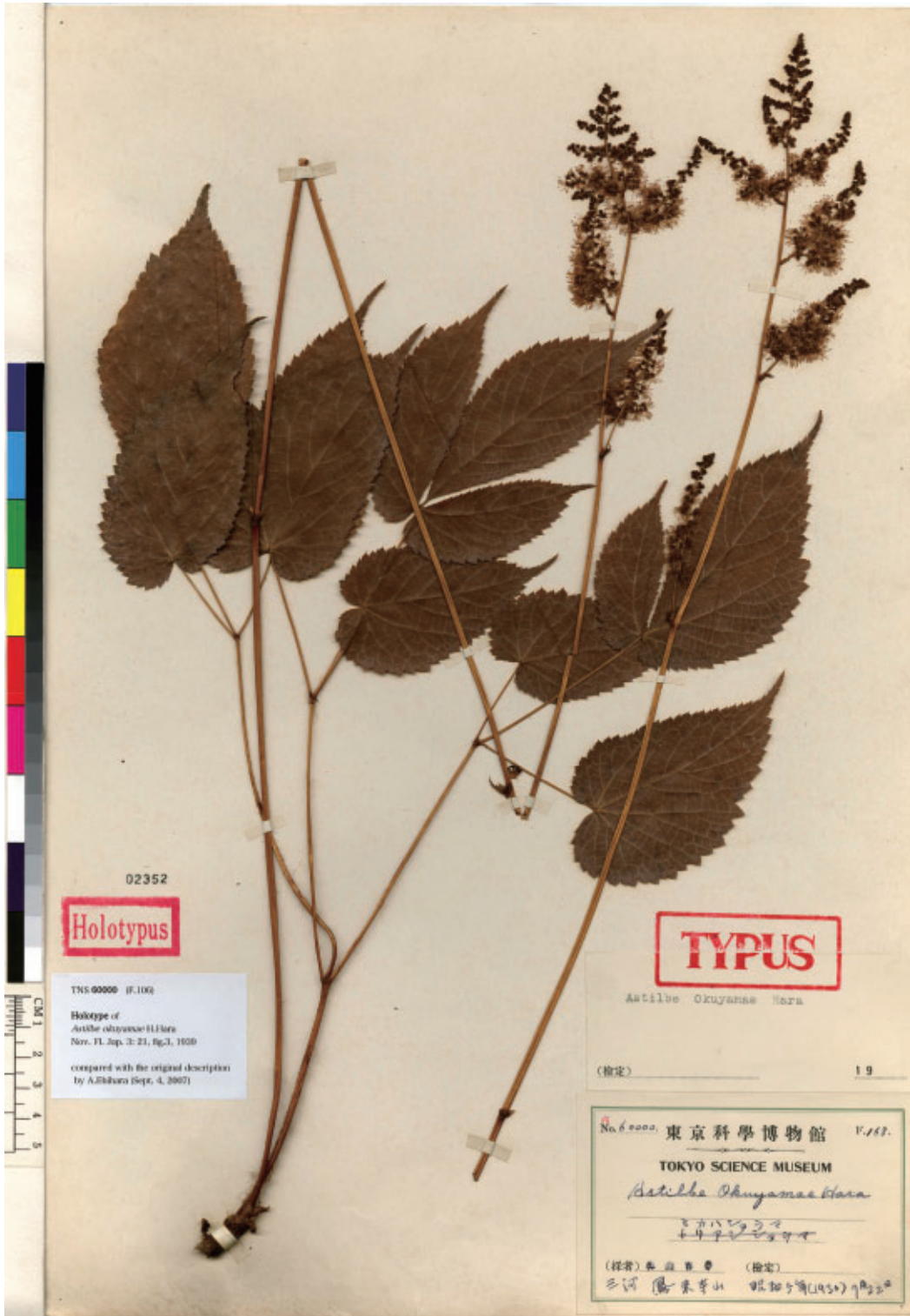
Fig. 7. Astilbe okuyamae H. Hara. Aichi Pref., Mt. Horaiji-san (S. Okuyama 6000, 22 July 1930, TNS-holo).