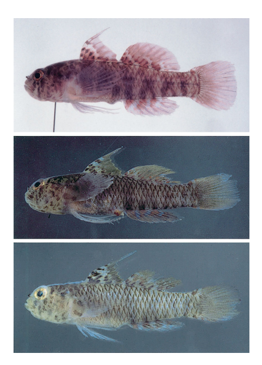
Fig. 1. Freshly collected specimens of Eviota korechika sp. nov. Top, NSMT-P 70710, holotype, male, 24.4 mm SL; middle, AMS I.43577, paratype, male, 19.6 mm SL; bottom, NSMT-P 62151, paratype, female, 22.9 mm SL.

men (male), 19.4 mm SL, same collecting data with NSMT-P 31456; NSMT-P31796, 1 specimen (female), 12.3 mm SL, same locality and date with NSMT-P 31456 (collected by K. Matsuura); NSMT-P31804, 3 specimens (2 males and 1 female), 20.3-23.0 mm SL, same locality with NSMT-P 31456, 2-3 m depth, 14 Sept, 1989 (collected by K. Matsuura); NSMT-P61055, 1 specimen (male), 19.4 mm SL, Tanjung Kusukusu, west coast of Lembeh Island, Bitung, Sulawesi, Indonesia (1°26.8'N, 125°14.5' E), 15 m depth, 14 July 2000 (collected by K. Matsuura); NSMT-P61065, 2 specimens (females), 16.7-17.6 mm SL, Tanjung Lampu, west coast of Lembeh Island, Bitung, Sulawesi, Indonesia (1°26.0'N, 125°11.0'E), 20 m depth, 22 Jan. 2000 (collected by K. Matsuura); NSMT-P61612, 1 specimen (female), 17.4 mm SL, collected with NSMT-P61065; NSMT-P62151, 1 specimen (female),