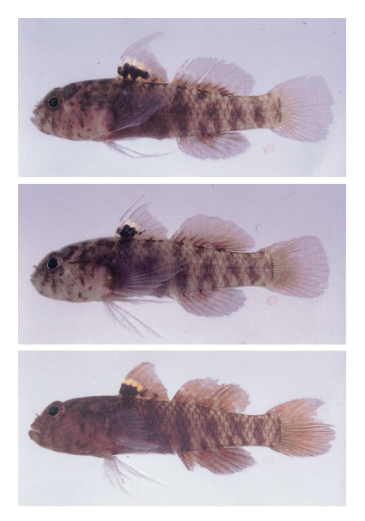
Fig. 2. Freshly collected specimens of Eviota ocellifer sp. nov. Top, NSMT-P 70712, holotype, male, 18.4 mm SL; middle, OMNH 29480, paratype, male, 17.0 mm SL; bottom, BLIH 20030464, paratype, male, 18.4 mm SL.

Proportional measurements are given in Table 1. Anterior 1–2 spines of first dorsal fin very elongate in males (tips of these two spines damaged and its state of elongation not confirmable in a single male paratype, BLIH 20030464), whereas