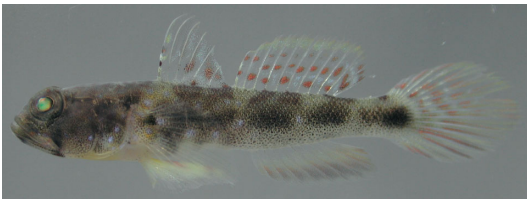
Fig. 3. Freshly collected specimen of Myersina adonis sp. nov. (NSMT-P 65980, young male, 21.7 mm SL).

around, the entrance of a small burrow that was constructed by a dull-colored alpheid shrimp (species not determined). The burrows were on a simple sandy-mud bottom, and appeared to be not protected by dead-coral rubbles or roots of seagrasses. Unlike some congeners (e.g., M. macrostoma , M. lachneri and M. nigrivirgata ), M. adonis did not exhibit the hovering behaviour above the burrow reported for those species during the time that KS observed them.