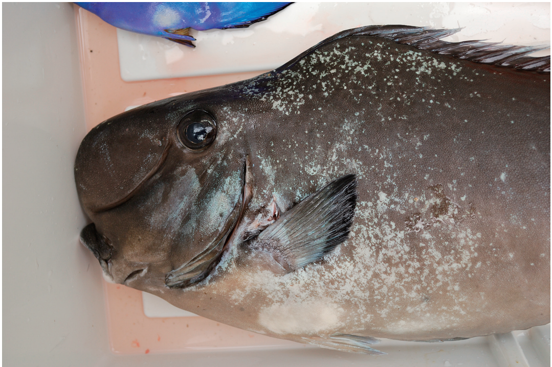
Fig. 3. The freshly dead specimen of Naso tonganus , showing irregularly shaped white markings on the anterior part of body.

170km southwest of Yaku-shima Island, N. tonganus has never been collected nor observed in Yaku-shima Island. Sakai et al. (2005) reported fishes by underwater observations from the northern part of the Tokara Group. Their report included an underwater photograph of “Tosakahagi, N. tuberosus ” taken at Kuchino-