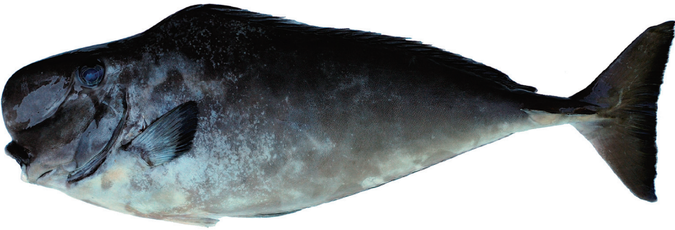
Fig. 2. Naso tonganus . — NSMT-P 91972, 488 mm SL. The photograph was taken one day after the specimen was collected and kept in a styrofoam box with ice.