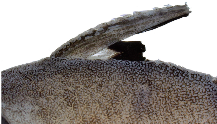
Fig. 2. First dorsal spine of Xenobalistes tumidipectoris, OCA-P20110823-5, 39.1 mm SL.