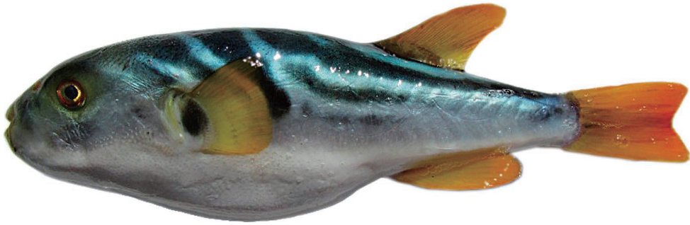
Fig. 6. Takifugu xanthopterus (175 mm SL) collected around the mouth of Lyutoga River in Aniva Bay, Sakhalin Island.