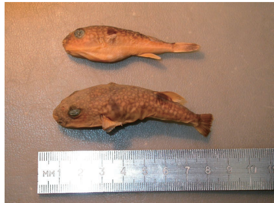
Fig. 3. Takifugu poecilonotus collected from Sakhalin Island: ZIN 31566 (one of 6 specimens.), ZIN 31567 (one of 20 specimens).

cially important. In addition to this, Gastrophysus has frequently been applied to puffers of the genus Lagocephalus , which contains about 10 species, including edible species (at least muscle is edible in L. inermis , L. gloveri , and L. spadiceus ) and strongly toxic species such as L. lunaris and L. sceleratus . In Chinese publications the generic name Gastrophysus is still applied to species of Lagocephalus . Thus, if Gastrophysus is applied to species of Takifugu , it would result in major confusion in the classification of puffers in East Asia. When considering food security and fishery industry sustainability we should be careful about the use of generic names of puffers. Matsuura (2015) has stated that he would request the International Commission on Zoological Nomenclature to suppress Gastrophysus . Considering this situation, we use generic name