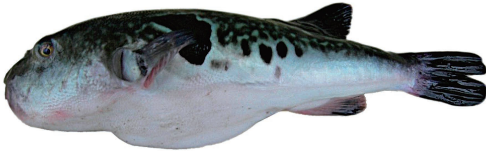
Fig. 4. Takifugu rubripes (242 mm SL) collected around the mouth of Lyutoga River in Aniva Bay, Sakhalin Island.

2007, 2011), although it is commonly found in the waters of Japan and Korea (Amaoka et al. , 1989; Kim et al. , 2009).