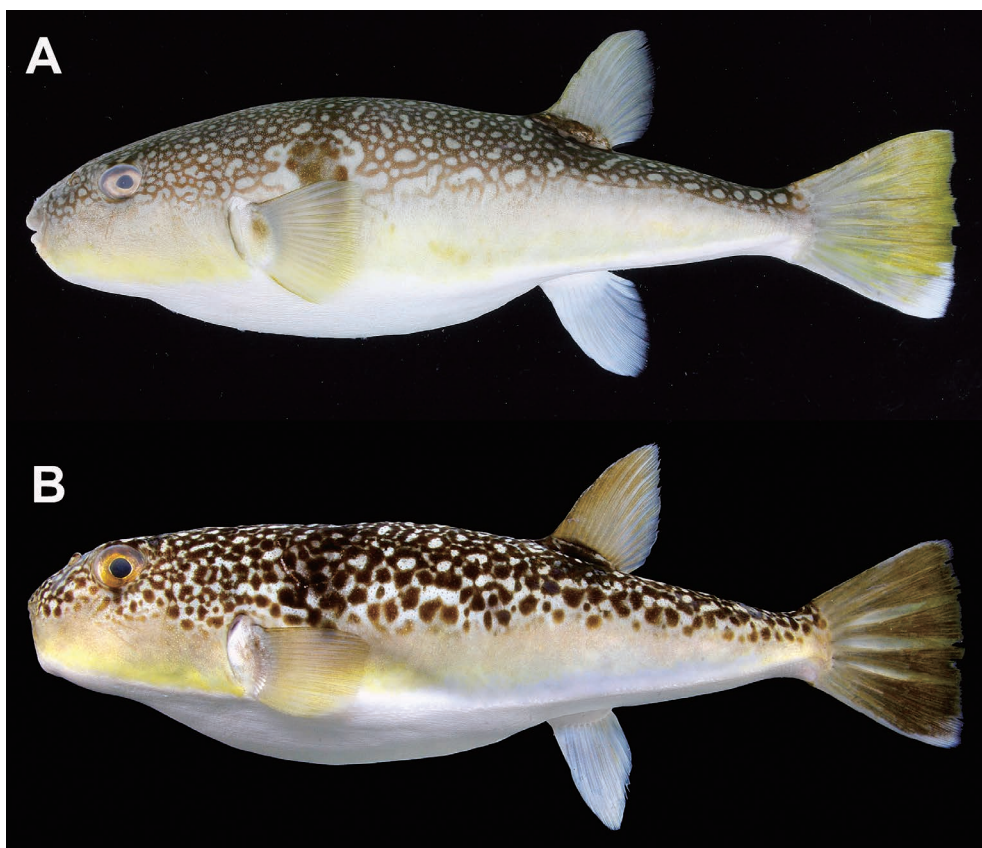
Fig. 5. A, Takifugu vermicularis (Temminck and Schlegel, 1850), FAKU 139922, 222 mm SL, Maizuru, Sea of Japan; B, Takifugu snyderi (Abe, 1988), KAUM-I. 27764, 166 mm SL, Satsuma Peninsula, Kyushu, Japan.

Russian waters, sometimes many individuals were captured in Peter the Great Bay (e.g., 1 ton catch in August 2001, see Orlov, 2013).