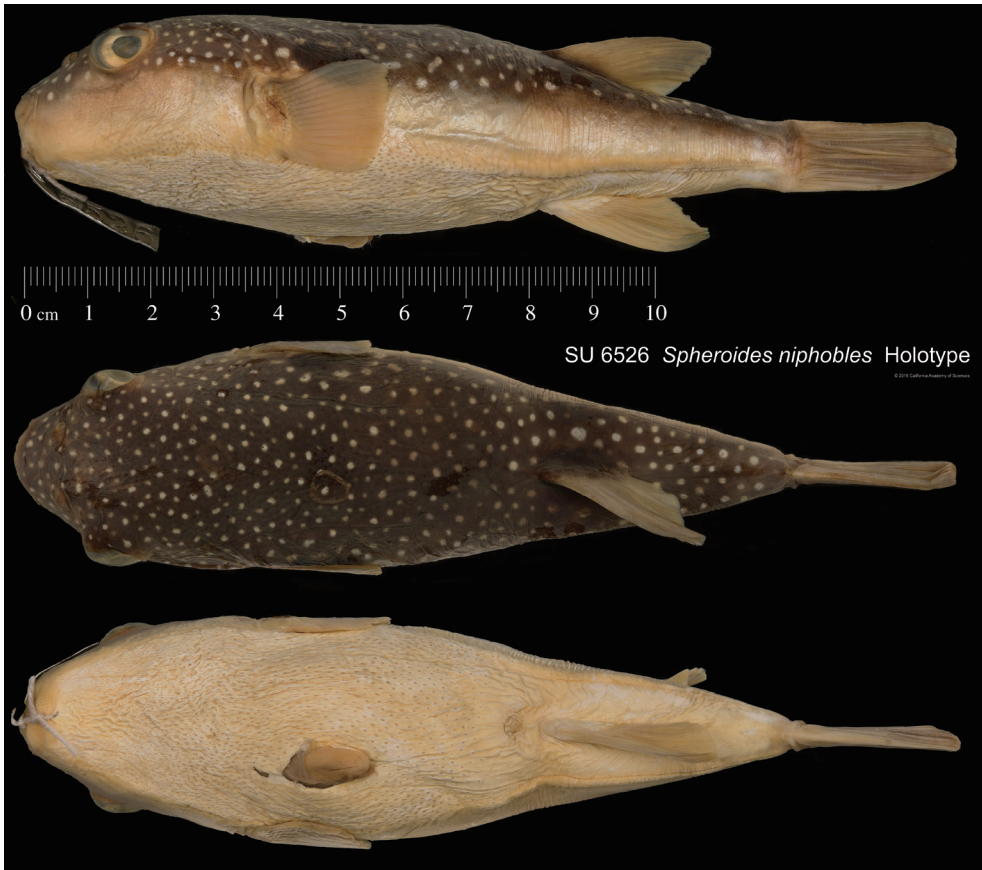
Fig. 4. Holotype of Spheroides niphobles , CAS-SU 6526, 118 mm SL, Japan, Tokyo. Top, lateral view; middle, dorsal view; bottom, ventral view.

Takifugu alboplumbeus is commonly found in shallow waters along coasts of Japan from Hokkaido southward to Okinawa-jima Island of the Ryukyu Islands. It has been reported in many publications by Japanese ichthyologists (e. g., Matsuura, 1984, 1997; Yamada and Yagishita,