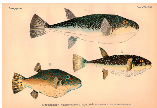
Fig. 10. Color illustration of Tetraodon poecilonotus by Temminck and Schlegel (1850, pl. 124, fig. II).

spots, highly variable in size; side of head and body below the dorsal end of the pectoral-fin base white with yellowish tinge; ventral surface of head and body white; iris orange.