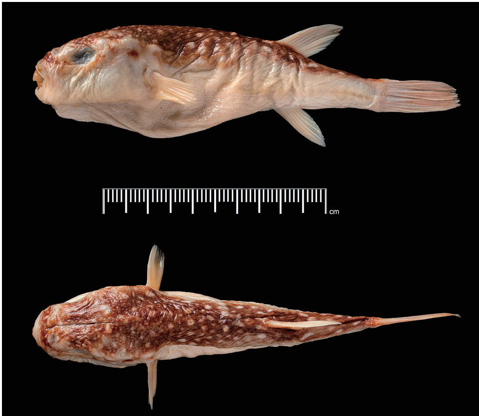
BMNH 1980.3.6.1, Tetrodon alboplumbeus , HOLOTYPE