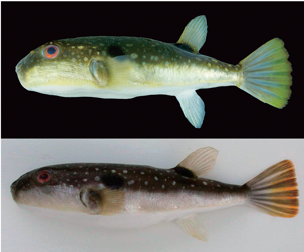
Fig. 2. Takifugu alboplumbeus . Top, KAUM-I. 11491, 64.3 mm SL, Japan, Kagoshima Prefecture, Yaku-shima Island, mouth of Miyanoura River; bottom, NSMT-P 77803, 96.0 mm SL, Japan, Kagoshima Prefecture, Tanega-shima Island, Koume River.

dal peduncle; two openings in nasal organ wide; the dorsal surface of head and body covered with spinules, extending from the nasal organs to the caudal-fin base; the ventral surface of head and body covered with spinules, extending just posterior to the lower jaw to slightly before the anus; spinules also distributed in front of gill opening; dorsal and anal fins slightly pointed; pectoral fin rounded; caudal fin slightly rounded.