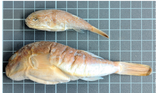
Fig. 9. Paratypes of Takifugu flavipterus sp. nov. RMNH 31693, 62.1–107 mm SL, Japan.

anterior edge of nasal organ 9.7% SL (7.5–17.5% SL), posterior edge of nasal organ to anterior edge of eye 4.0% SL (3.9–5.7% SL), length of dorsal-fin base 10.0% SL (8.6–11.4% SL), length of anal-fin base 7.7% SL (7.7–9.5% SL), longest dorsal-fin ray 17.6% SL (17.6–21.5% SL), longest anal-fin ray 17.8% SL (15.9–21.3% SL), longest pectoral-fin ray 16.6% SL (13.6–17.8% SL), caudal-fin length 26.3% SL (23.5–30.1% SL).