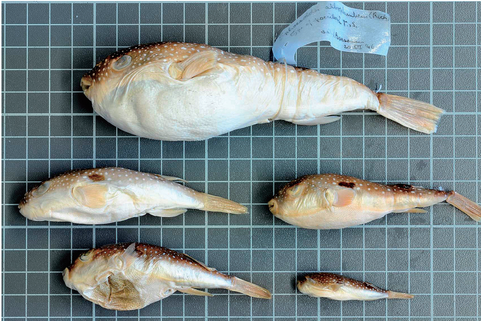
Fig. 5. Lectotype (RMNH 4038a, 127 mm SL) and paralectotypes (RMNH 4038b–e, 40.4–80.6 mm SL) of Tetraodon poecilonotus .

2002). Ranges of fin-ray counts have been reported as follows by these authors: dorsal-fin rays 12–14, anal-fin rays 10–12 and pectoral-fin rays 13–17.