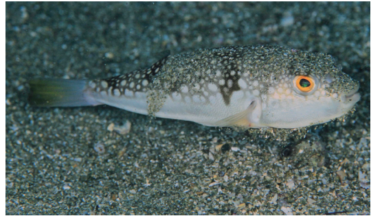
Fig. 8. Underwater photograph of Takifugu flavipterus sp. nov. (7 cm TL). Japan, Suruga Bay, west coast of Izu Peninsula, Koganezaki Point, 15 m depth.

Description. Characters shown in Diagnosis not repeated here. Head length 31.7% SL (28.2–33.8% SL), snout length 14.0% SL (13.0–17.3% SL), snout to dorsal-fin origin 69.4% SL (62.7–70.4% SL), snout to anal-fin origin 66.3% (64.5–70.1% SL), body width at pectoral-fin base 23.4% SL (15.5–30.0% SL), body depth at anal-fin origin 23.6% SL (18.8–23.6% SL), depth of caudal peduncle 9.6% SL (8.3–9.6% SL), length of caudal peduncle 28.4% SL (23.5–29.5% SL), gill opening length 7.8% SL (7.6–11.9% SL), eye diameter 7.0% SL (5.5–9.4% SL), bony interorbital width 9.8% SL (9.2–12.4% SL), snout to