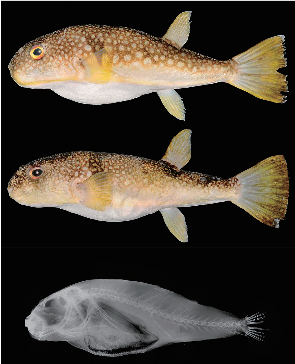
Fig. 6. Takifugu flavipterus sp. nov. Top, holotype, NSMT-P 124758, 104 mm SL, Japan, Honshu Island, Shimono-seki, Waku; middle, paratype, 124757, 148 mm SL, data same as the holotype; bottom, radiograph of holotype.