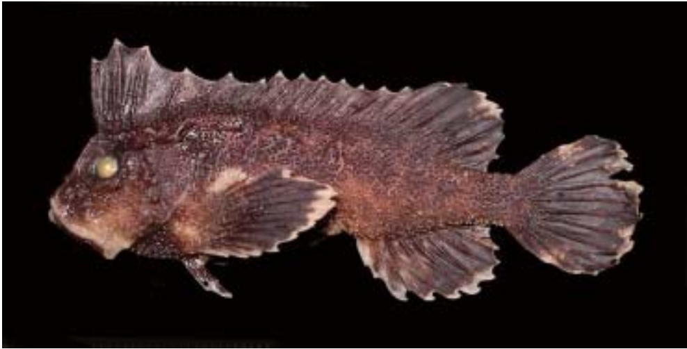
Fig. 1. Cocotropus possi sp. nov., NSMT-P 76417, holotype, 34.5 mm SL, Ryukyu Islands, southern Japan (70% ethanol-preserved condition).