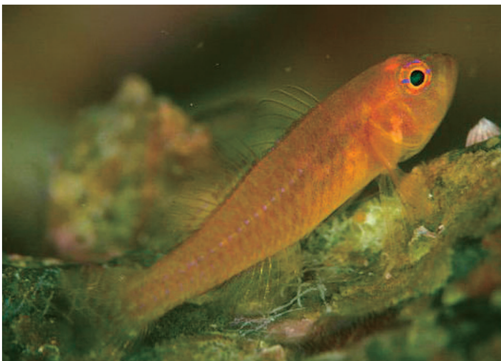
Fig. 4. Trimma kudoii , live, KPM-NR 80759, Kashiwa-jima Island, Shikoku, Japan, 33 m depth, Photo by T. Uematsu.