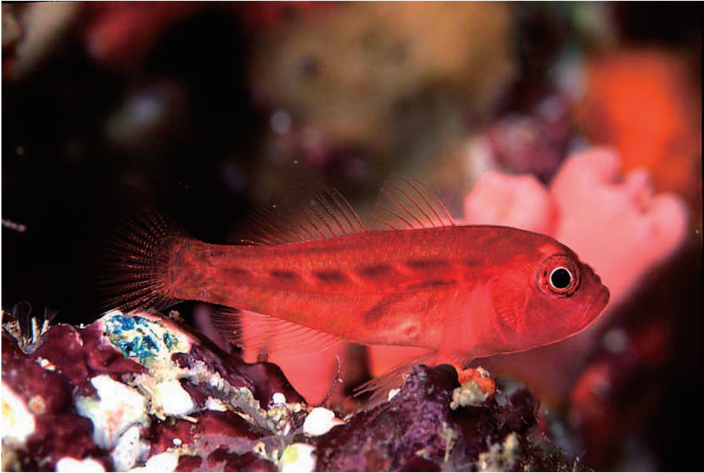
Fig. 7. Trimma yanoi , live, Iriomote-jima Island, the Ryukyu Islands, Japan, 8 m depth, Photo by K. Yano.

color of dorsal, pectoral and caudal fins pale red-dish gray. Dorsal fins with a bright yellowish orange basal stripe. Base of caudal fin with some large diffuse bright yellowish orange blotches. Anal fin light orange. Pelvic fin hyaline.