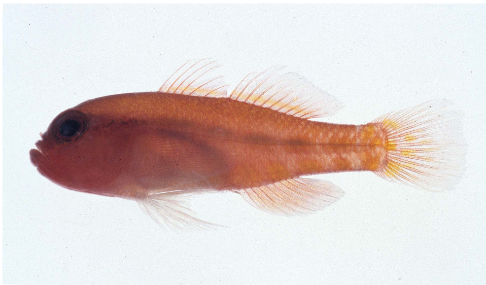
Fig. 6. Trimma yanoi , fresh specimen, KPM-NI 5649, male, holotype, 21.8 mm SL, Sotobanare-minami, Funauki Bay, Iriomote-jima Island, the Ryukyu Islands, Photo by H. Senou.

Second spine of first dorsal fin longest but not elongate, not reaching posteriorly to second dorsal fin when adpressed. Middle 14 rays of pectoral fin branched; pectoral fin reaching posteriorly to above near base of spine of anal fin (not reaching to anal fin). First 4 rays of pelvic fin with 2 sequential branch points (2–3 sequential branch points); fifth ray with 2 dichotomous branch points and 4 terminal tips, 60–64% of fourth ray in length; fourth ray longest, reaching posteriorly to base of first ray of anal fin when adpressed. No pelvic fraenum. Basal membrane between innermost pelvic-fin rays 61–64% of length of fifth ray (75%).