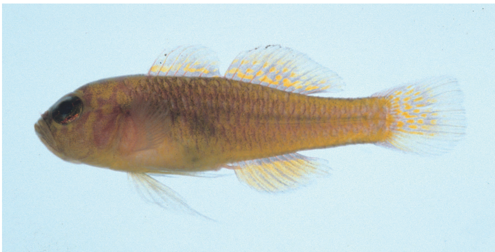
Fig. 3. Trimma kudoii , fresh specimen, BLIH 19960276, male, paratype, 25.1 mm SL, Kinkou Bay, Kagoshima Prefecture, Japan, Photo by Y. Ikeda.

nasal opening a simple pore (with low rim in 4 paratypes). Interorbital trough shallow (deep with sloping sides, wider than deep in 5 paratypes), no postorbital trough. Bony interorbital width 19% of pupil diameter (20–28% in 6 paratypes, mean 24%). The cephalic sensory system is depicted in Figure 1.