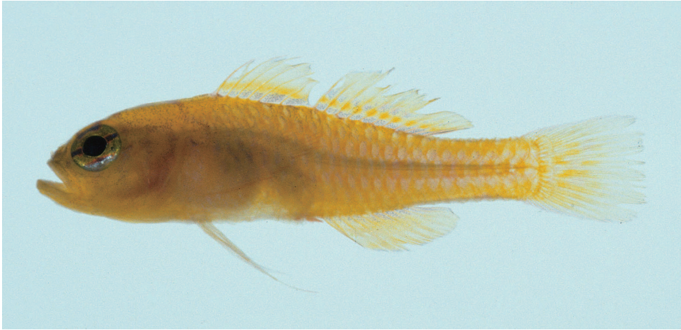
Fig. 2. Trimma kudoii , fresh specimen, KPM-NI 4255, male, holotype, 19.0 mm SL, Akinohama, Izu-ohshima Island, Izu Islands, Japan, Photo by H. Senou.

dinal scales; ground color of head and body bright yellow, iris vivid yellow with 3 deep purple oblique lines margined by pink when fresh.