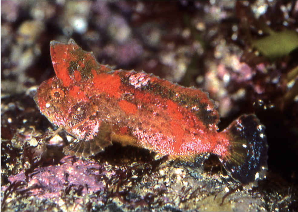
Fig. 5. Cocotropus izuensis sp. nov., KPM-NI 22800, paratype, 29.2 mm SL, east coast of Izu Peninsula, Japan.