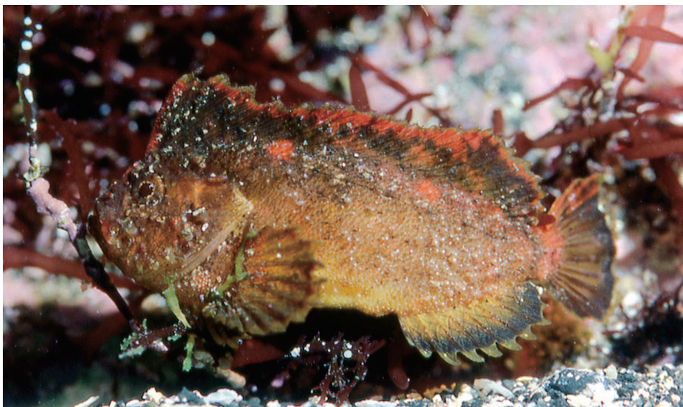
Fig. 4. Cocotropus izuensis sp. nov., KPM-NI 22797, holotype, 40.2 mm SL, east coast of Izu Peninsula, Japan.

Color when fresh. In another paratype (CMNH-ZF 4692, based on color photograph) (Fig. 6), head, body, and dorsal, anal, pectoral and pelvic fins yellowish brown with many dark spots. Dorsal fin anteriorly with a dark area, and posteriorly with a marginal band. Pectoral fin base reddish. Anal fin with a single ventral dark band. Caudal fin posteriorly dark brown, except for the pale yellowish brown upper and lower posterior margins; caudal-fin base yellowish brown.