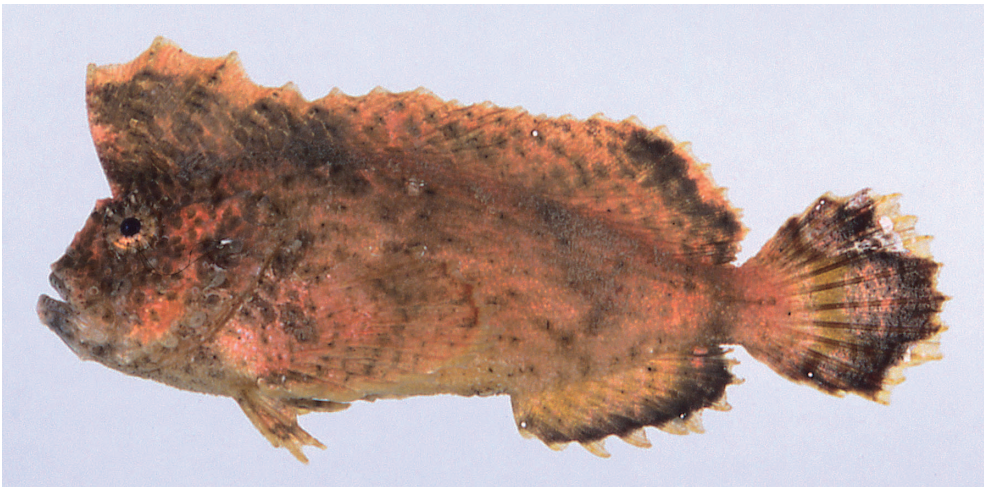
Fig. 6. Cocotropus izuensis sp. nov., CMNH-ZF 4692, paratype, 36.7 mm, Boso Peninsula, Japan.

space between sixth and seventh neural spines without pterygiophores in C. steinitzi ). The characters of the 4 species discussed here are compared in Table 1.