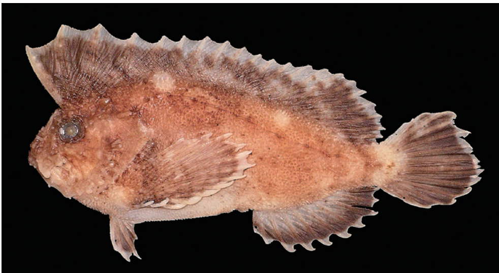
Fig. 1. Cocotropus izuensis sp. nov., KPM-NI 22797, holotype, 40.2 mm SL, east coast of Izu Peninsula, Japan (ethanol preserved condition).

Diagnosis. A new species of Cocotropus with 12 dorsal-fin spines, 7 segmented lower caudal-fin rays, 26 vertebrae, 5 preopercular spines, upper jaw length equal to or a little shorter than lachrymal length, no distinct fleshy papillae on posterior portion of upper jaw, no vomerine teeth,