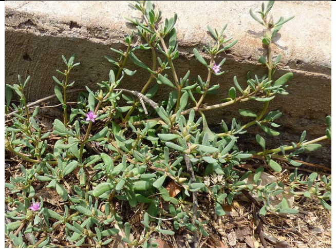
Above: S. verrucosum from Maui Leaves and stem obviously verrucose with crystalline globules on surface easily observed without microscope, resulting in the blue-gray appearance of leaves; habit somewhat upright-leaves moderately fleshy; stems not rooting at nodes.