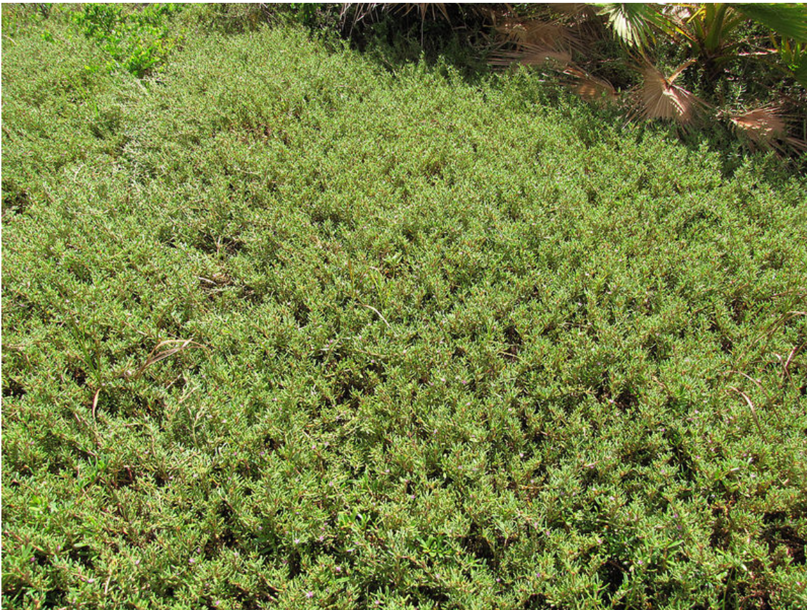
Figure C39- 3. Photo of S. verrucosum forming a low mat at Kealia Pond National Wildlife Refuge on Maui in 2013.