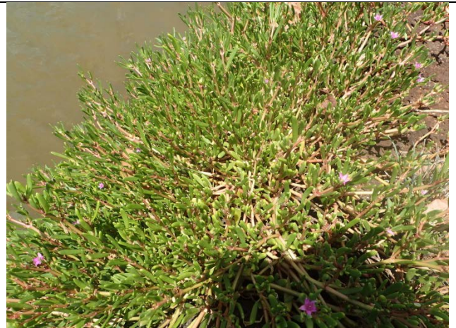
Above: Sesuvium sp. nr. verrucosum from Kauai. Leaves and stem somewhat verrucose (not easily observed without microscope); leaves appearing less blue-gray than S. verrucosum but darker than S. portulacastrum with a waxy cuticle; habit more upright than S. portulacastrum , but less so than S. verrucosum ; leaves moderately fleshy; stems not rooting at nodes.