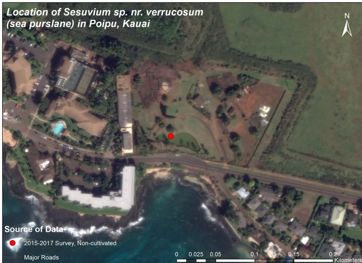
Figure C39- 5. Map of Sesuvium sp. nr. verrucosum locations in Prince Kuhio Park near Poipu.

Feasibility of a delimiting survey for Sesuvium sp. nr. verrucosum was given a score of 2 because only one site was detected in a single TMK. However, the small stature of this plant, its resemblance to the native S. portulacastrum as well as its preference for coastal areas increases the likelihood that some populations were not detected during 2015-2017 roadside surveys. Specific surveys targeting wetlands and coastal areas, especially during future island-wide early detection surveys, should be conducted to ensure the plant is not more widespread than currently known.