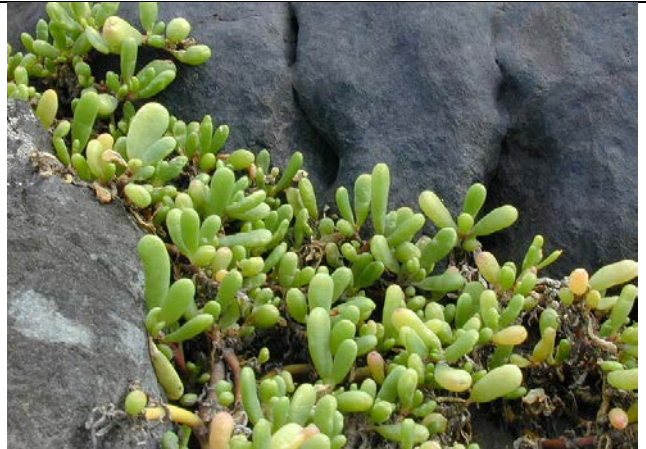
Above Left: S. portulacastrum from Kauai (found immediately adjacent to Sesuvium sp. nr. verrucosum above); Above Right: S. portulacastrum from Maui. Leaves and stem glabrous, waxy looking; leaves appearing bright green, sometimes tinged yellow-orange; habit very prostrate, closely appressed to the ground; leaves usually very fleshy, but variable; stems rooting at most nodes. Note: flower color varies from white to pink (not a useful character to distinguish between species).