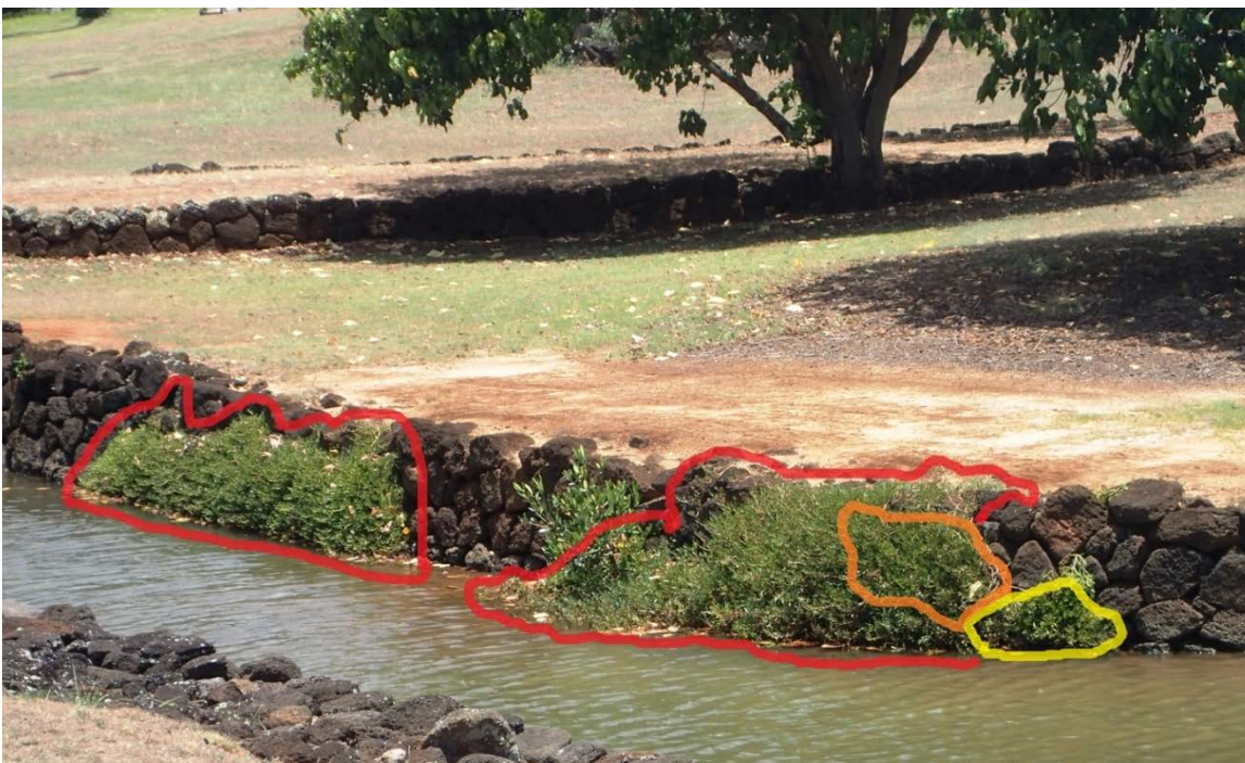
Figure C39- 4. Photo of Sesuvium sp. nr. verrucosum at Prince Kuhio Park on Kauai. Approximately, vegetation delimited by a yellow line = the native S. portulacastrum , red = Sesuvium sp. nr. verrucosum , and orange = area where Sesuvium sp. nr. verrucosum is overtopping S. portulacastrum .