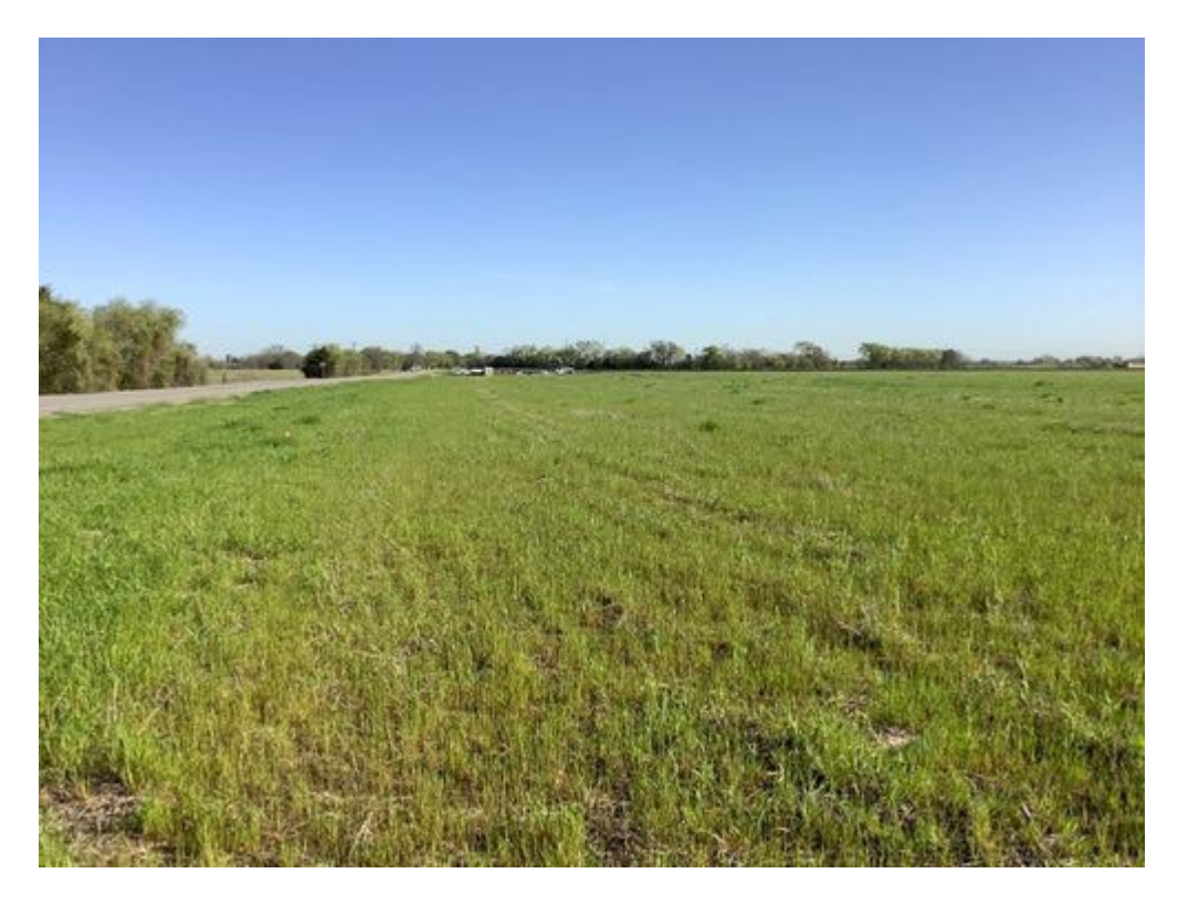
Photo 11: Representative view of the Row Crops observed vegetation type.