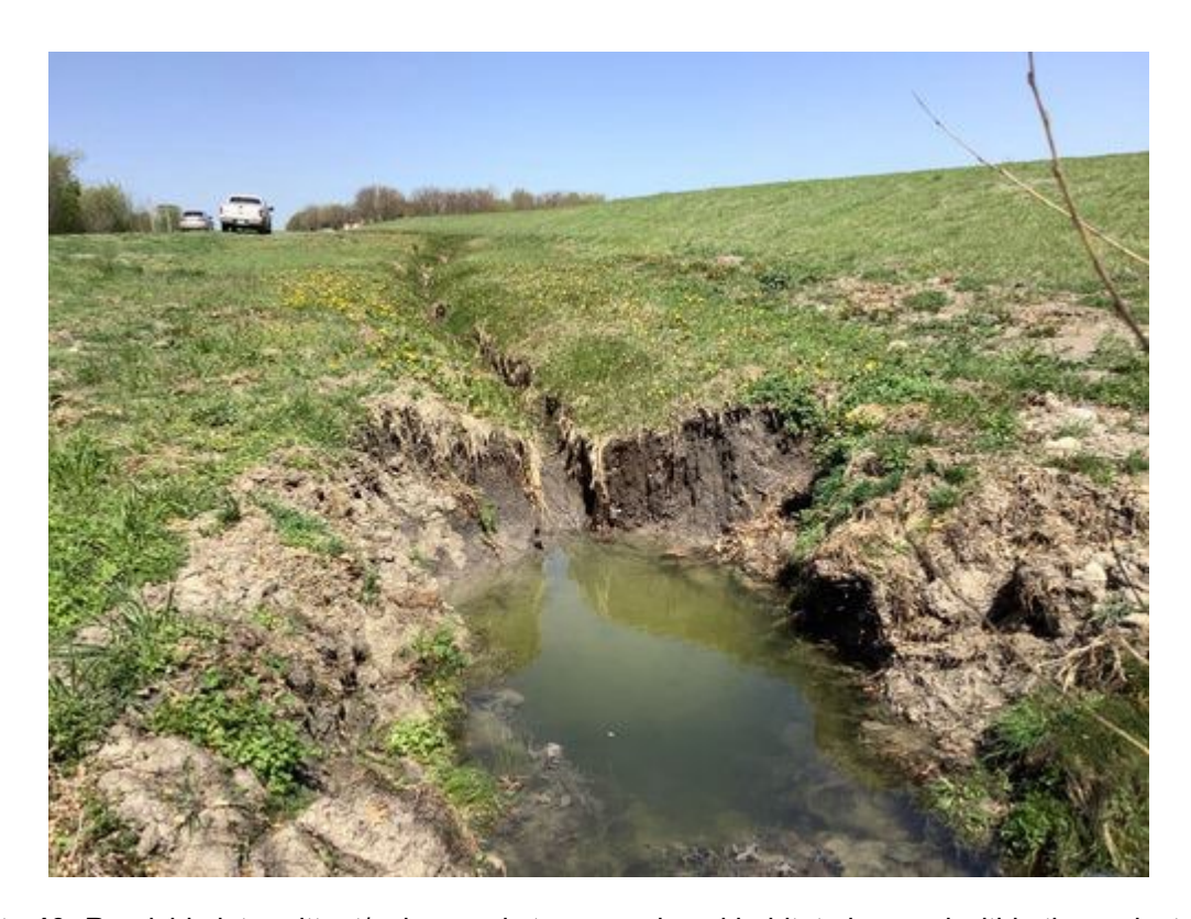
Photo 19: Roadside intermittent/ephemeral stream and pool habitat observed within the project area.