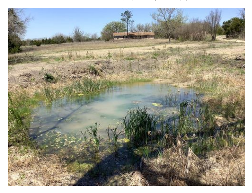
Photo 32: Pond/wetland that could provide potentially suitable habitat for amphibians and fossorial reptiles.