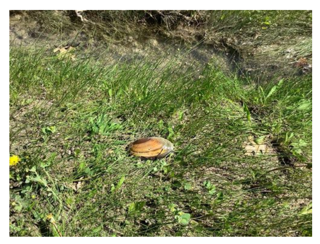
Photo 20: A live yellow sandshell ( Lampsilis teres ) freshwater mussel observed within a roadside stream within the project area.