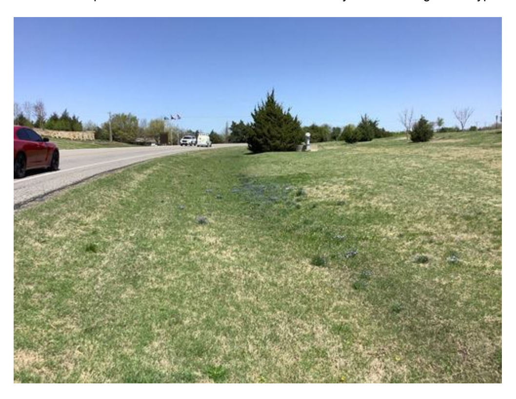
Photo 02: An additional representative view of the Urban Low Intensity observed vegetation type.