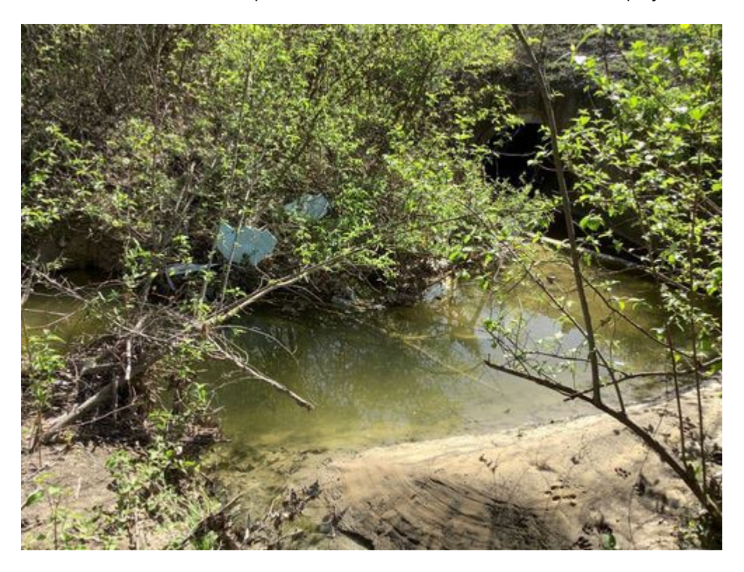
Photo 18: Intermittent stream habitat observed within the project area.