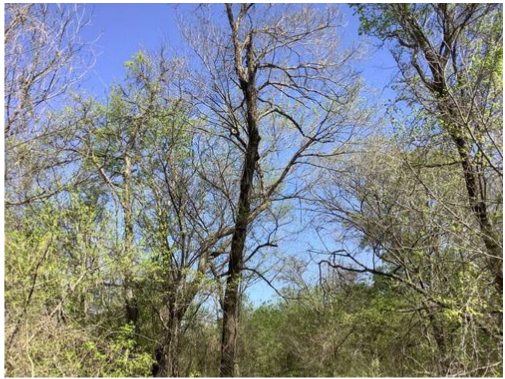
Photo 30: Potential roost tree for bat species observed within the project area. No evidence of occupancy was observed.