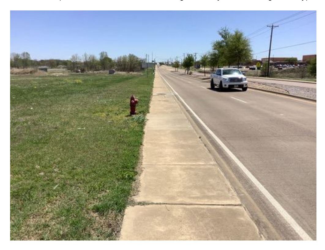
Photo 04: Another representative view of the Urban High Intensity observed vegetation type.