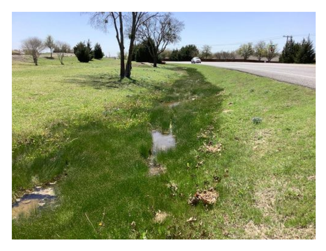
Photo 09: Representative view of the Central Texas: Riparian Herbaceous Vegetation observed vegetation type.