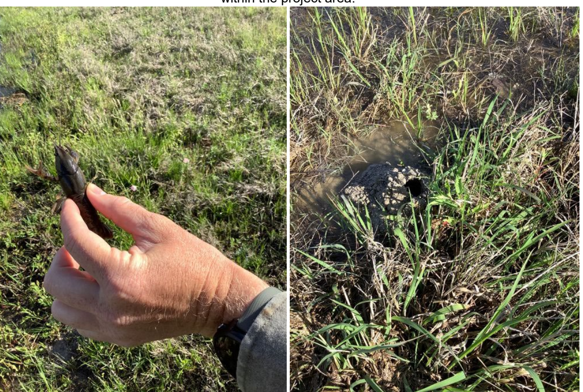
Photo 22: Representatvie view of crayfish and crayfish burrows observed wihtin the project area.