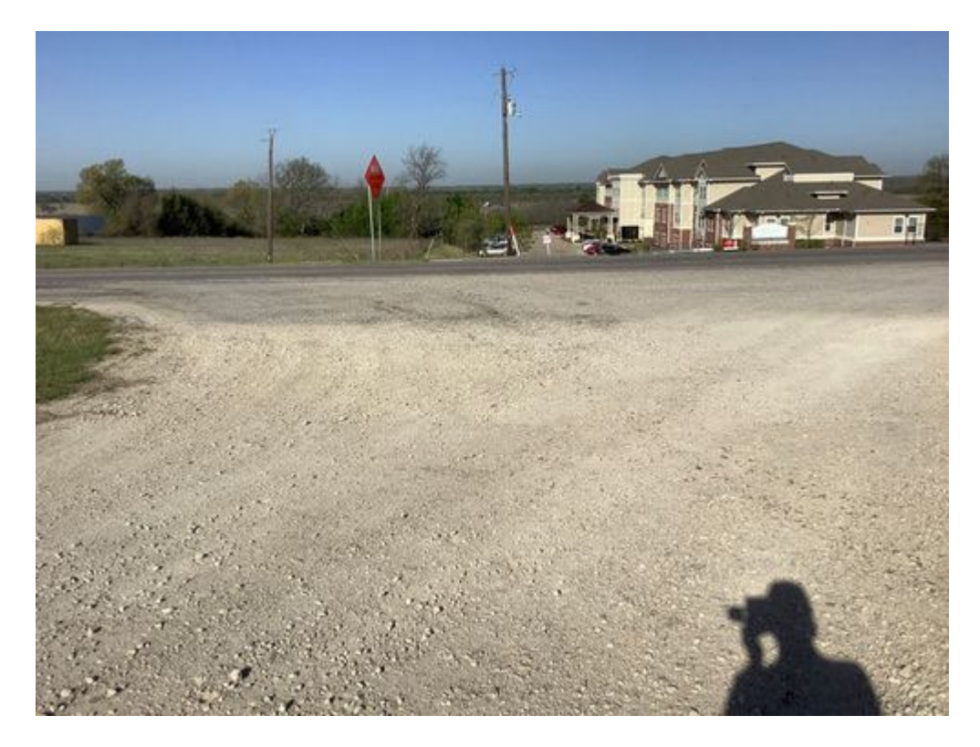
Photo 03: Representative view of the Urban High Intensity observed vegetation type.