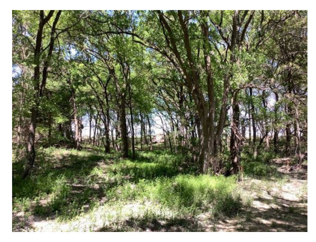
Photo 13: Representative view of the Central Texas: Riparian Hardwood Forest observed vegetation type.