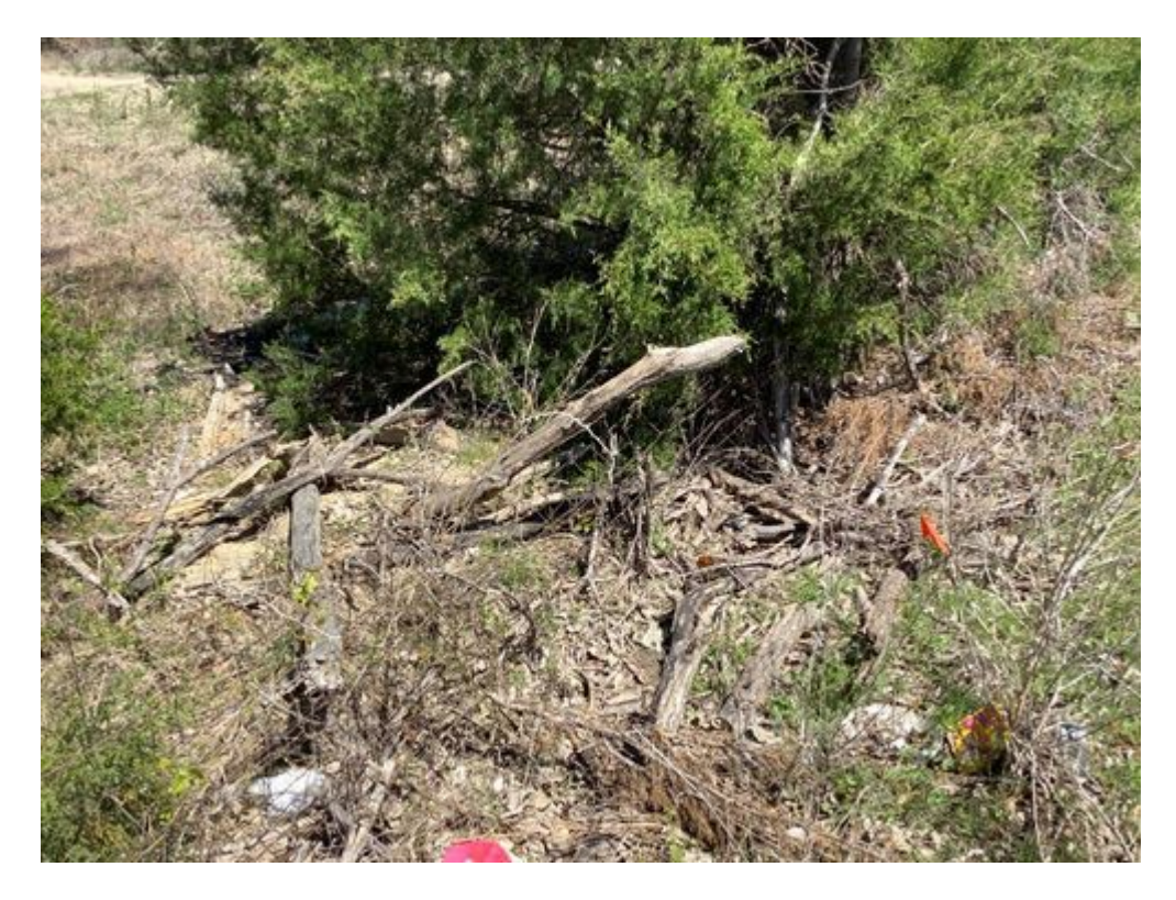
Photo 33: Woody debris observed within the project area that may be used as cover by wildlife species.