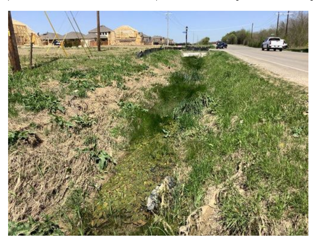
Photo 10: An additional representative view of the Central Texas: Riparian Herbaceous Vegetation observed vegetation type.