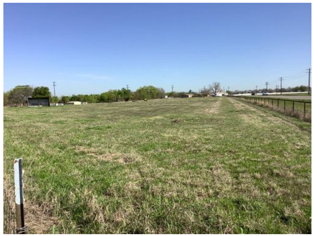
Photo 08: An additional representative view of the Blackland Prairie: Disturbance or Tame Grassland observed vegetation type.