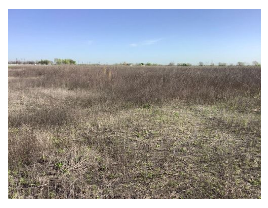
Photo 07: An additional representative view of the Blackland Prairie: Disturbance or Tame Grassland observed vegetation type.