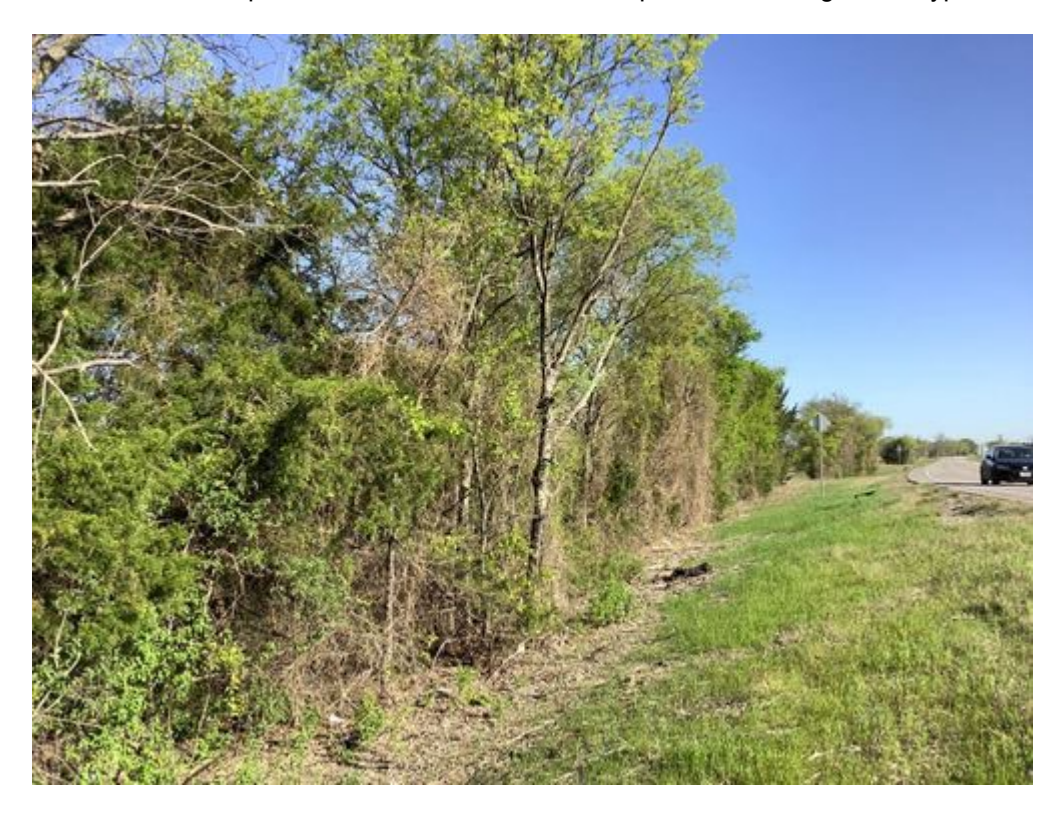
Photo 12: Representative view of the Native Invasive: Deciduous Woodland observed vegetation type.