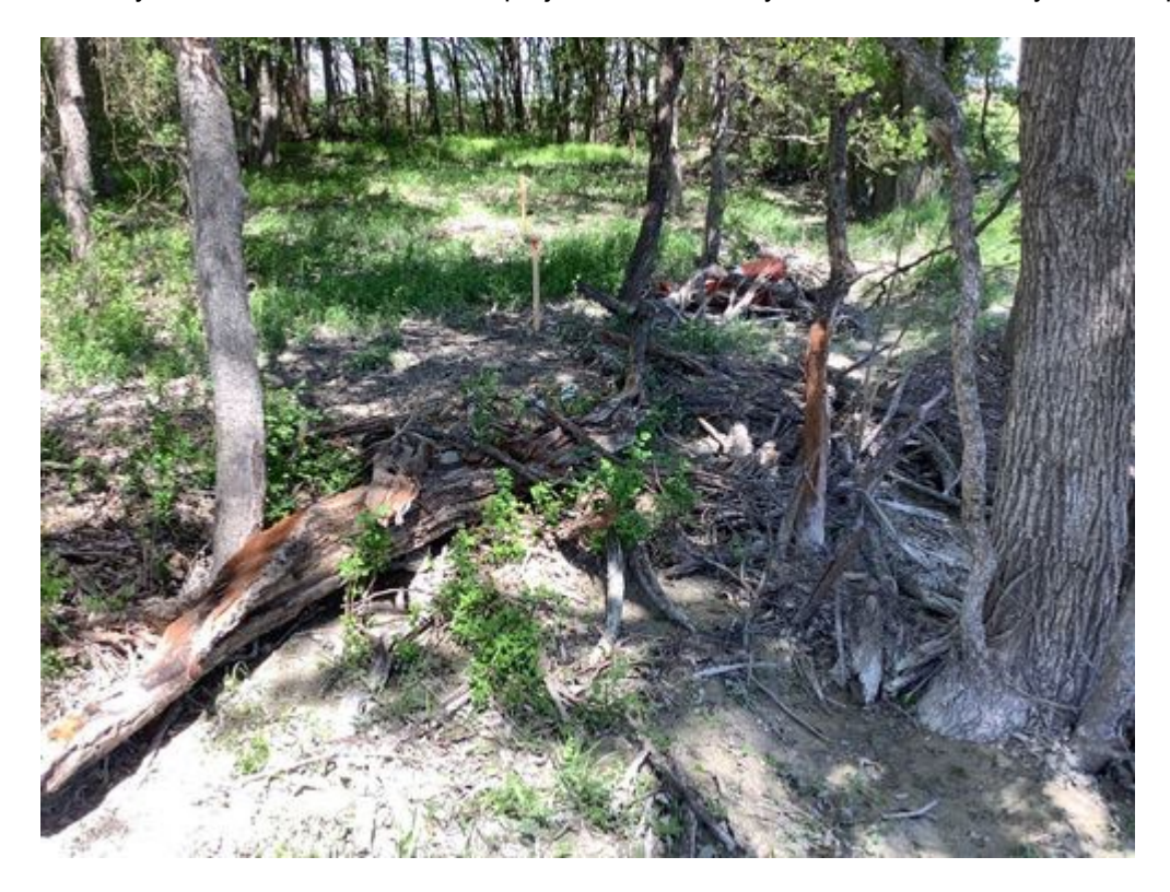
Photo 34: Woody debris observed within the project area that may be used as cover by wildlife species.