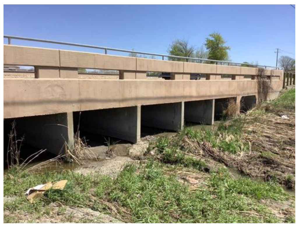
Photo 29: Another concrete bridge which contains crevices that could potentially provide moderate roosting habitat for bat species. No evidence of occupancy was observed.