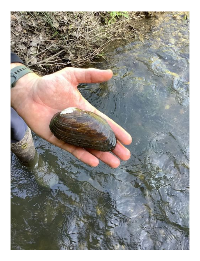
Photo 21: Tapered pondhorn ( Uniomerus declivis ) freshwater mussel shell material observed within a stream within the project area.