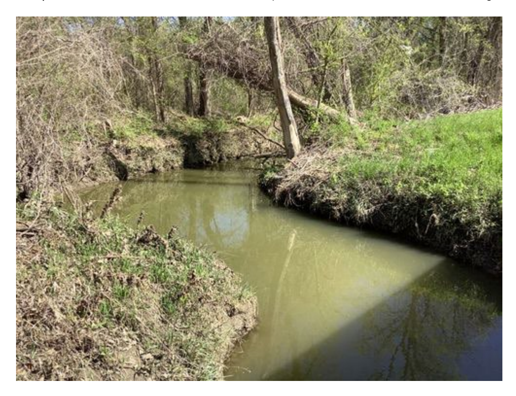
Photo 16: Perennial stream habitat observed within the project area.