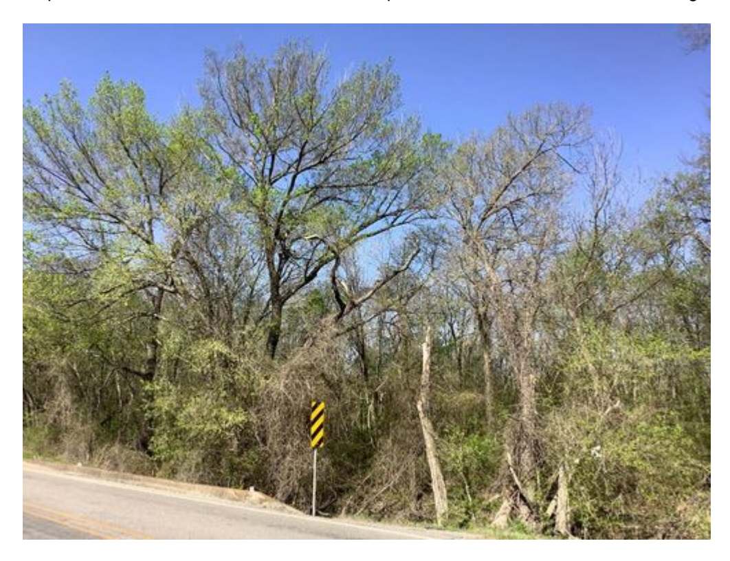
Photo 14: An additional representative view of the Central Texas: Riparian Hardwood Forest observed vegetation type.