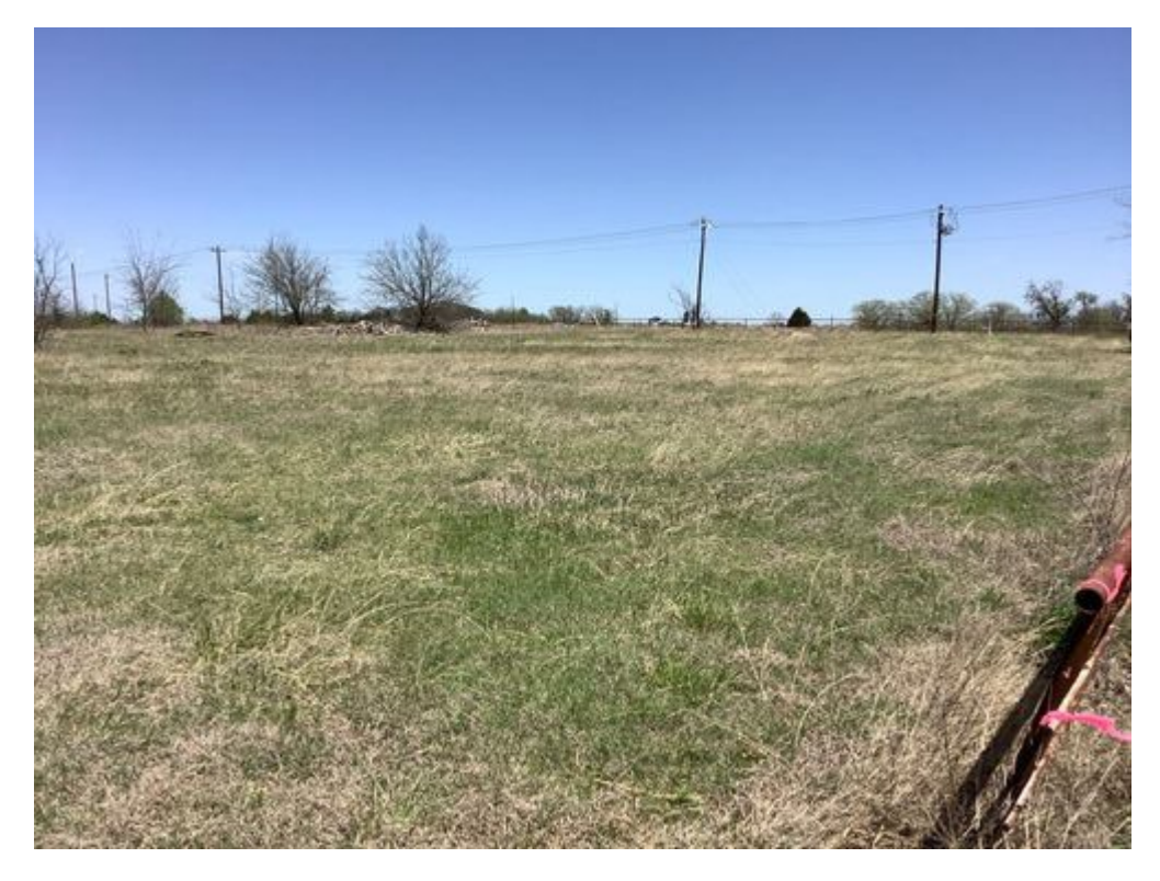
Photo 06: Representative view of the Blackland Prairie: Disturbance or Tame Grassland observed vegetation type.