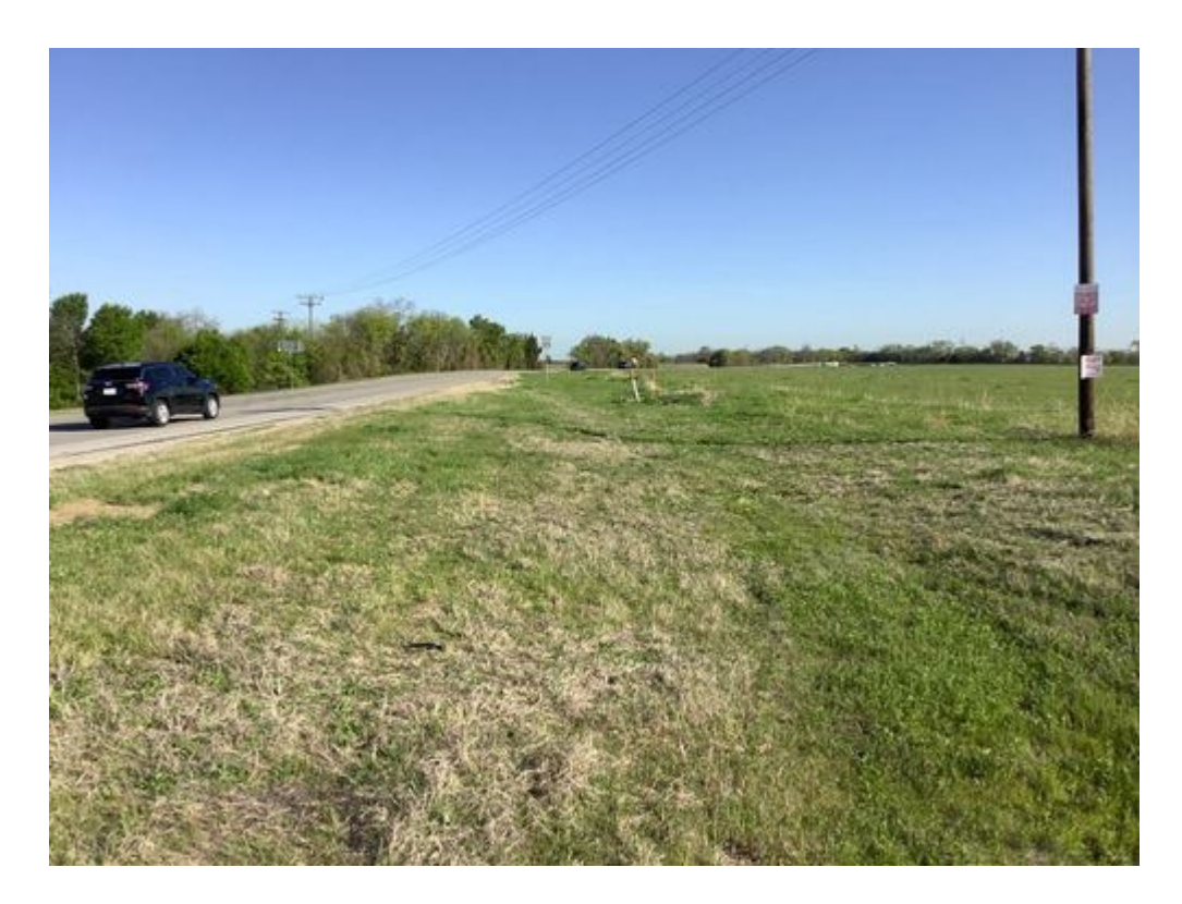
Photo 01: Representative view of the Urban Low Intensity observed vegetation type.