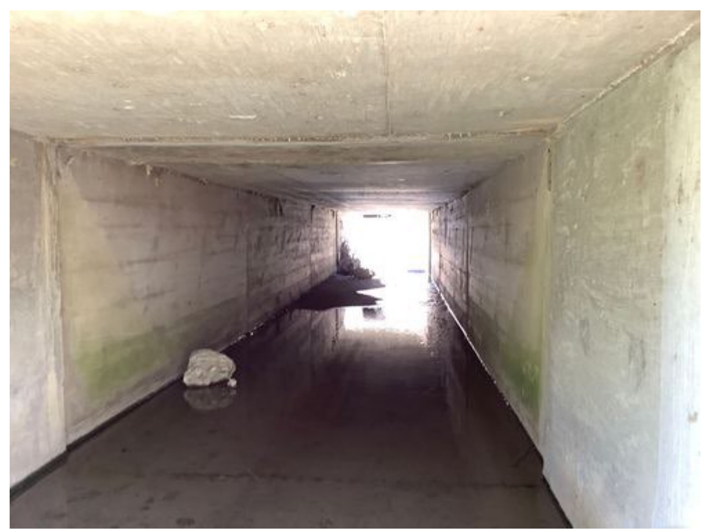
Photo 27: Concrete box culvert which contains crevices that could potentially provide moderate roosting habitat for bat species. No evidence of occupancy was observed.