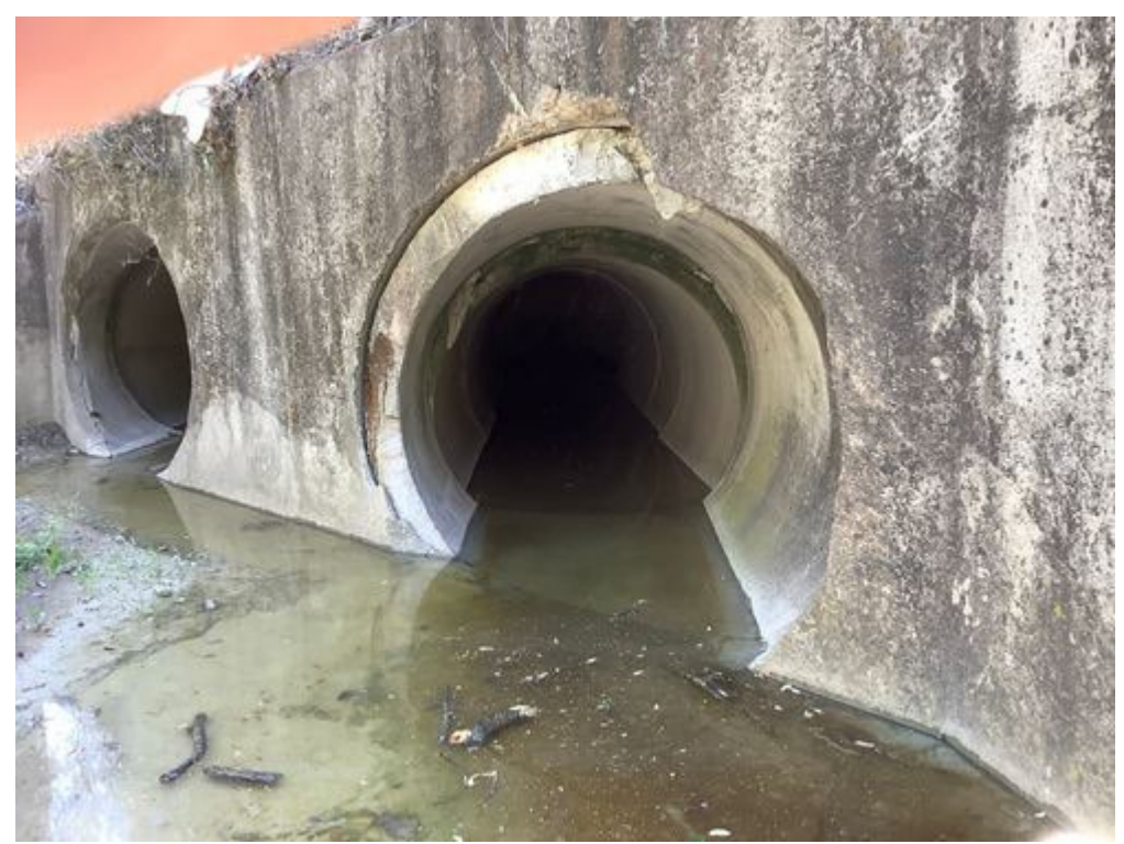
Photo 23: Concrete pipe culvert which contains crevices that could potentially provide moderate roosting habitat for bat species.