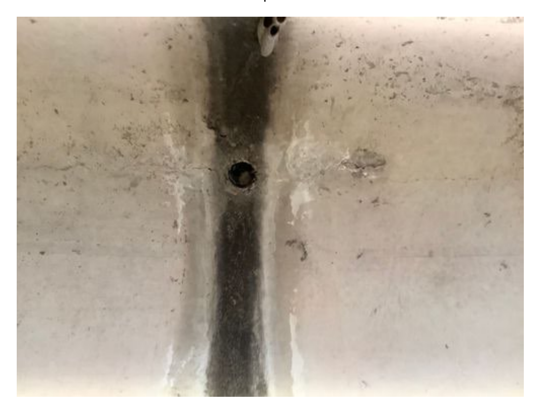
Photo 24: Crevice in a concrete pipe culvert that could potentially provide moderate roosting habitat for bat species. No evidence of occupancy was observed.