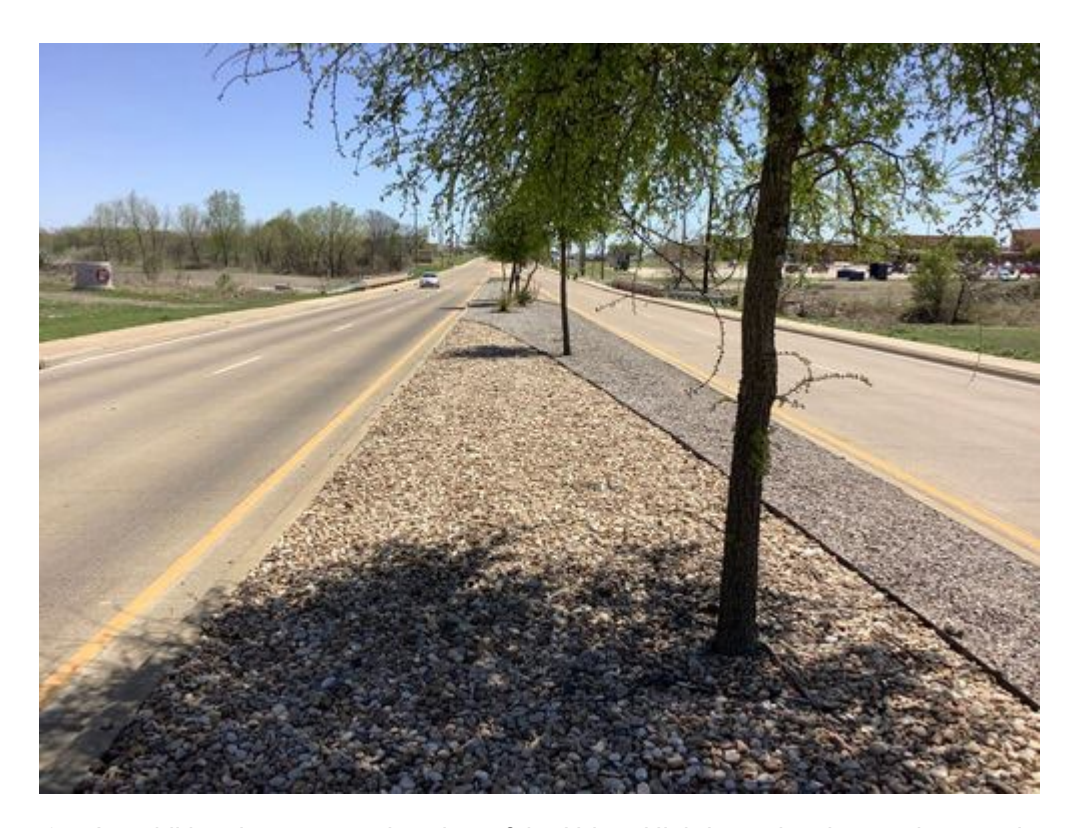
Photo 05: An additional representative view of the Urban High Intensity observed vegetation type.