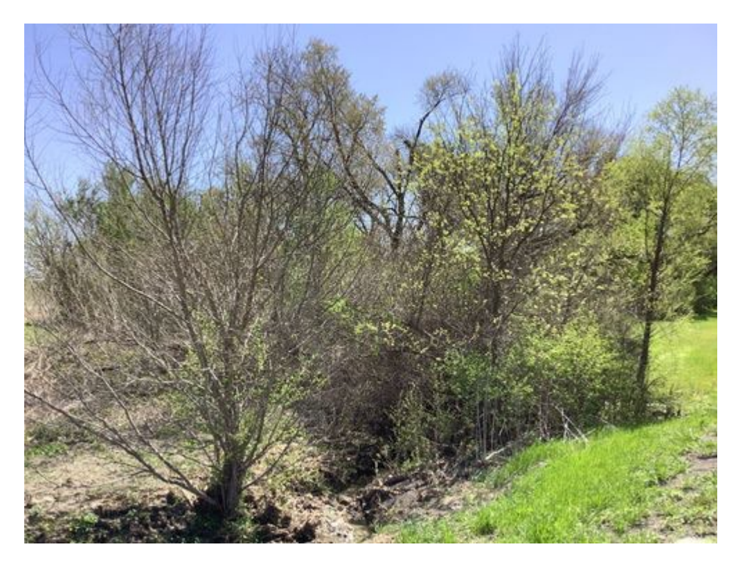
Photo 15: Representative view of the Central Texas: Riparian Deciduous Shrubland observed vegetation type.