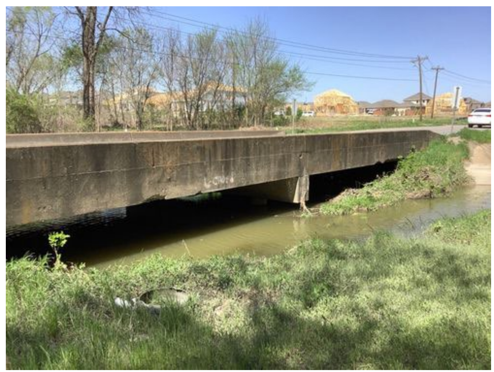
Photo 26: Another concrete bridge which contains crevices that could potentially provide moderate roosting habitat for bat species. No evidence of occupancy was observed.