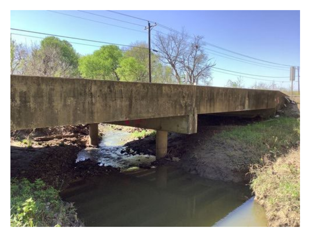
Photo 25: Concrete bridge which contains crevices that could potentially provide moderate roosting habitat for bat species. No evidence of occupancy was observed.