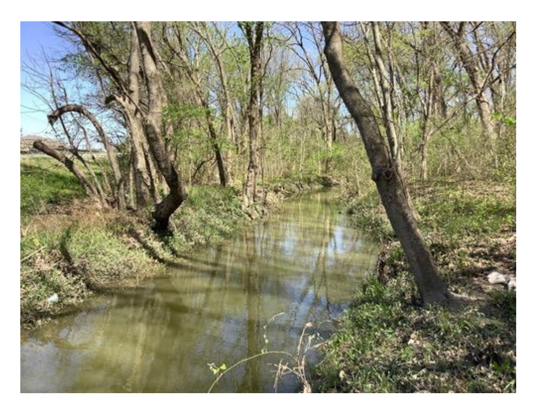
Photo 17: Additional view of perennial stream habitat observed within the project area.