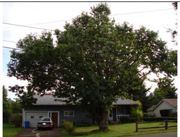
American Chestnut, Castanea dentate , 410 Evans Avenue N. This is a rare tree. In Eastern US it has been almost completely obliterated by Chestnut blight.