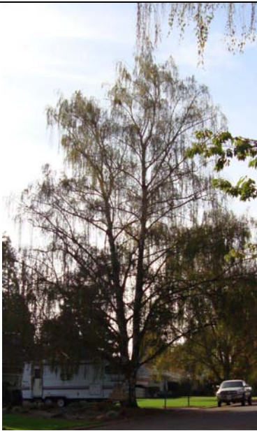
Cutleaf European Birch