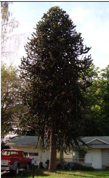
Monkey Puzzle Tree

Large leaves, large summer flowers. Possibly the best specimen in Salem- Keizer area.