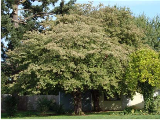
Silk or Mimosa Tree, Albizia julibrissin 103 Dearborn Avenue NE. 2 trees