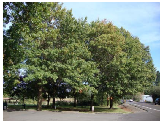
Pin Oak, Quercus palustris , Claggett Creek Park south end along Dearborn. Fine specimens, fall color.