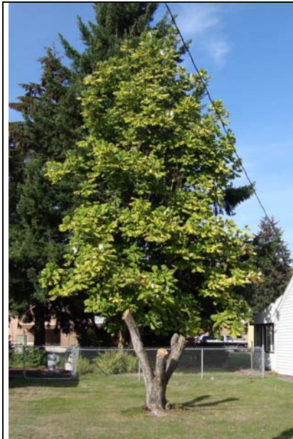
Big leaf Magnolia