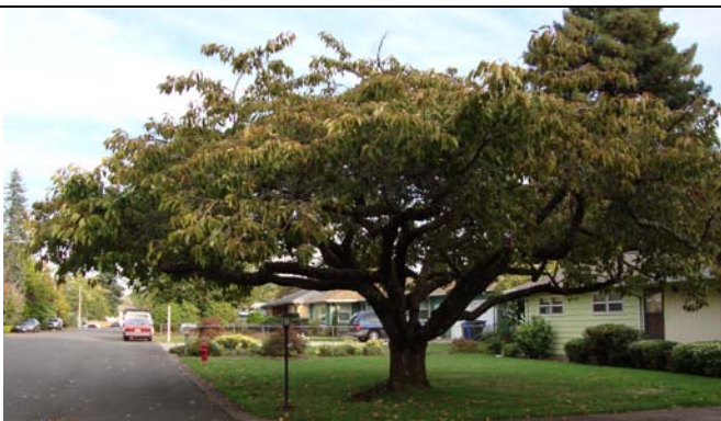
Akebono Flowering Cherry, Prunus lisitanica

Many planted together.. Perhaps a school project?