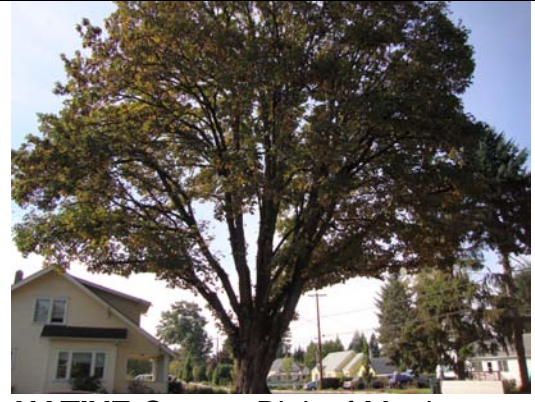
NATIVE Oregon Bigleaf Maple, Acer macrophyllum Intersection of Dearborn & Paulette another good sized specimen at Wallace House Park