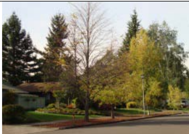
Katsura Tree, Cercidphyllum japonicum 5355 Verda Lane NE Spring new growth, fall color.