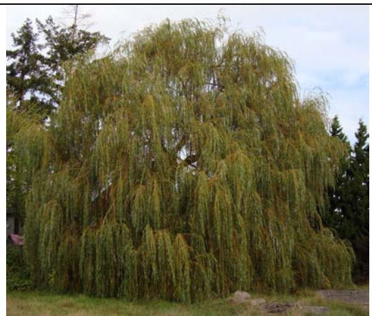
Golden Weeping Willow, Salix alba 'Tristis'

Heavy shell-pink flowers in spring, fall color.