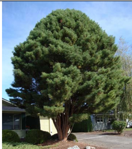
Tanyosyo Pine, Pinus densiflora 'Umbraculifera' 5394 Verda Lane NE. Interesting structure, colorful bark.

Pacific Dogwood, Cornus nuttallii 997 Dearborn, also on corner of Arcade & Kalmia. Spring & fall flowers, fall color.