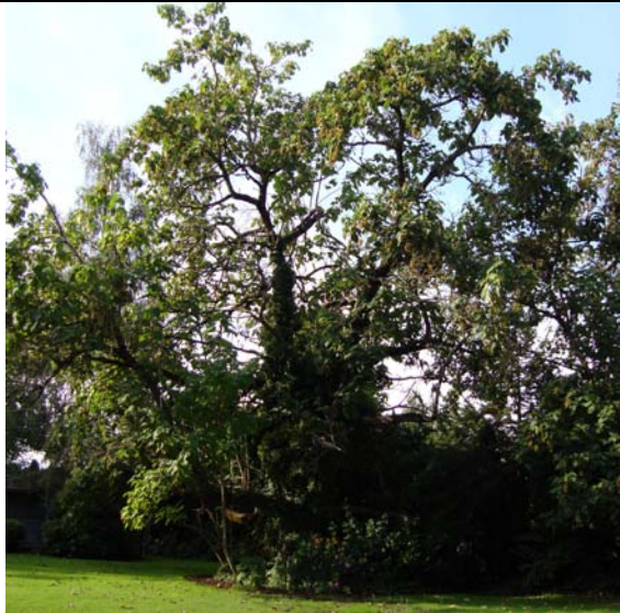
Empress Tree, Princess Tree, Paulownia tomentosum , 5395 Joan Drive N. Heavy bloom of lavender trumpet-shaped flowers in spring.