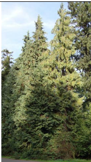
NATIVE Port Orford Cedar Chamaecyparis lawsoniana Shoreline Drive N. 4475 Delight Street N 4720 Delight Street N Hedge along Evans. Beautiful foliage.