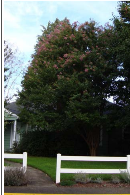
Crapemyrtle Lagerstroemia indica 4230 Shoreline Drive N. Late summer to fall very colorful flowers, beautiful bark.