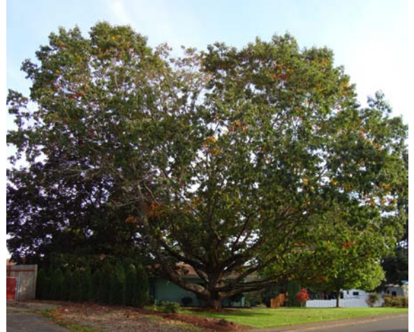
Northern Red Oak, Quercus rubra , corner Ventura Street N & Shoreline Drive N Large, beautiful form, fall color.