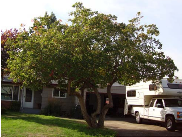
Smoke Tree, Cotinus coggygia , 4687 Rivercrest Street N Spring flowers, summer "seeds", fall color.