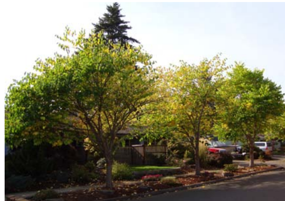
Eastern Redbud, Cercis Canadensis , 5353 Verda Lane, 5291 Arcade, and 5451 Kafir Drive NE. Spring flowers.