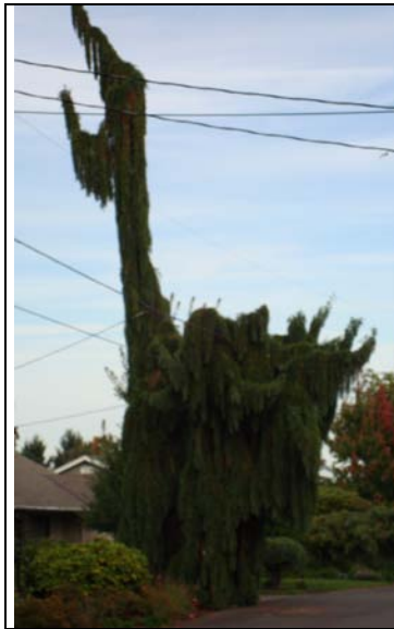
Weeping Giant Sequoia

Great specimen. Late spring flowers, attractive foliage, yellow fall color.