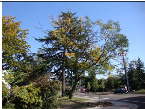
Kentucky Coffee Tree, Gymnocladus dioica Rainbow Court @ Chemawa Road NE Uncommon, fall color.