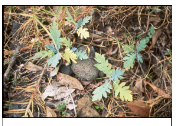
Figure 9. Bocconia seedlings, Auwahi, East Maui

Anecdotal evidence now strongly suggests that Bocconia is expanding its density and range throughout the Auwahi and Kanaio regions, with heavier concentrations of seedlings appearing with increasing frequency, especially in bare areas recently exposed by kikuyu grass ( Pennisetum clandestinum ) dieback (Figure 9). If the effects of the yellow sugarcane aphid ( Sipha flava ) and drought continue to manifest themselves, the number of suitable germination sites can be expected to significantly increase. Combined with the