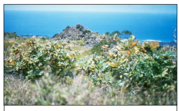
Figure 8. Bocconia frutescens stand, Kanaio, East Maui

Because of its ability to form dense stands in dry habitats (Stone and Scott 1984, Smith (1985) listed Bocconia frutescens as one of the 86 worst weeds that have become serious pests of native ecosystems. The most significant infestations of Bocconia on Maui now occur from 1600 to 4000 feet in the dryland forests of Auwahi and Kanaio (Figure 8), and during the 1992 survey of the now Kanaio Natural Area Reserve, Bocconia was found