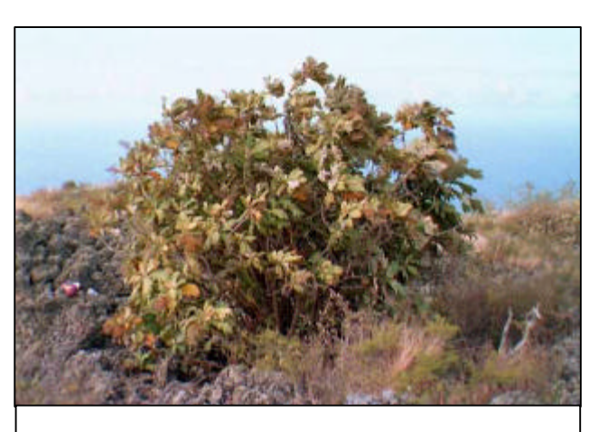
Figure 1. Bocconia tree, Kanaio, East Maui

"John Crow Bush" or "Celandine" in Jamaica (Adams 1972).