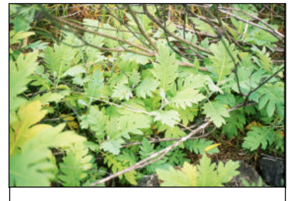
Figure 10. Bocconia seedling carpet, Auwahi, East Maui

seedlings germinating away from parent plants and beneath both native and nonnative trees. Under these trees, Bocconia seedlings can form dense carpets and could outcompete the rarely reproducing native dryland species (Figure 10). The U.S. Fish and Wildlife Service lists Bocconia as one of the major threats to the survival of Melicope adscendens (Anonymous 2000). This sprawling shrub is endemic to the dry forests of Kanaio and Auwahi, East Maui, areas in which Bostonian is proliferating. Other endangered plants occurring in the area that