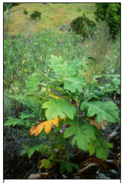
Figure 5. Flowering panicle

As the Bocconia tree grows in size and increases its number of stems and branches, it has the ability to produce a significant number of panicles and ultimately seeds. On 6/12/97, a Bocconia tree of approximately four meters (13 feet) height, with three main trunks arising from the base (basal diameters: 34.5 cm; 14.4 cm; 9 cm), had 44 infrutescences with predominantly immature capsules and 109 infrutescences with predominantly mature capsules present. The 153 branched fruiting panicles,