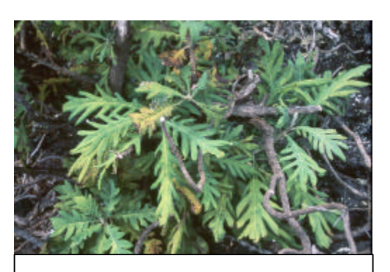
Figure 7. Resprouting Bocconia frutescens , Auwahi, East Maui

The aerial delivery of a foliar herbicide, such as Garlon 3A, from a long-line ball sprayer attached to a helicopter has also been suggested to help reduce the ubiquitous seed source of B. frutescens . This strategy, similar to the method employed in Miconia calvescens control efforts on the windward side of Maui (Medeiros et al. 1998), would target the larger, fruiting trees and dense stands of plants. Motooka (pers. comm. 2002) also reports that basal bark applications of 2,4-D ester and triclopyr ester are effective methods for controlling Bocconia .