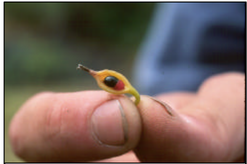
Figure 6. Bocconia seed with aril

Dispersal: The pulpy aril material is attractive to birds and aids in the dispersal of the seeds. On 6/20/97, large numbers of Japanese white-eyes ( Zosterops japonicus ) were observed feeding on the mature fruits of Bocconia trees at 1900 feet elevation on the south slope of Haleakala just after sunrise, beginning at about 5:42 a.m., and were, by far, the most conspicuous birds present in the area. A solitary mockingbird ( Mimus