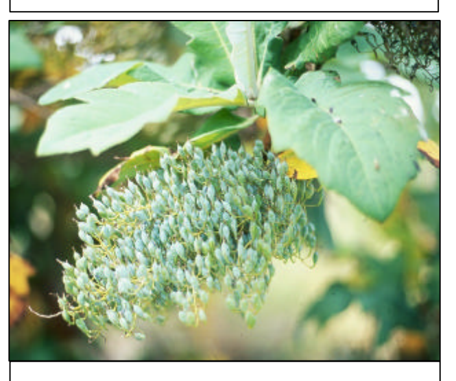
Figure 2. B. frutescens , panicle with immature fruit