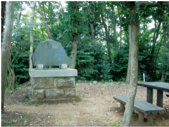
Rain-making ritual ground monument