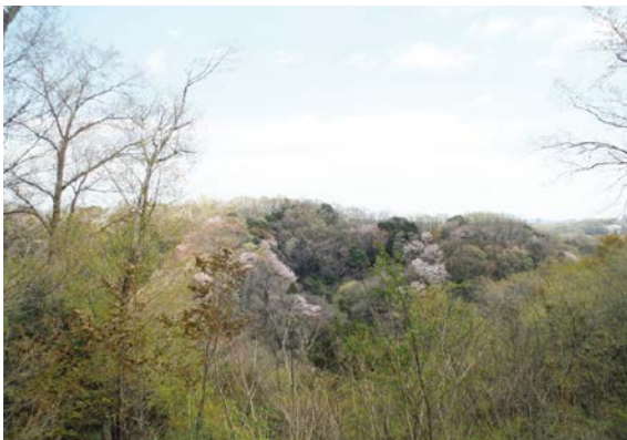
Yamazakura no Oka (Hills with Mountain Cherry Trees)

At the entrance of the Oto Park is Ushida area, a 1,400m 2 grass land field.