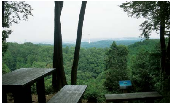
View from Dankiiri hill