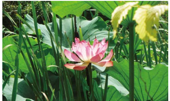
Lotus Flowers at HASUIKE(Lotus Pond)

The surrounding area is close to mountains than a hill.