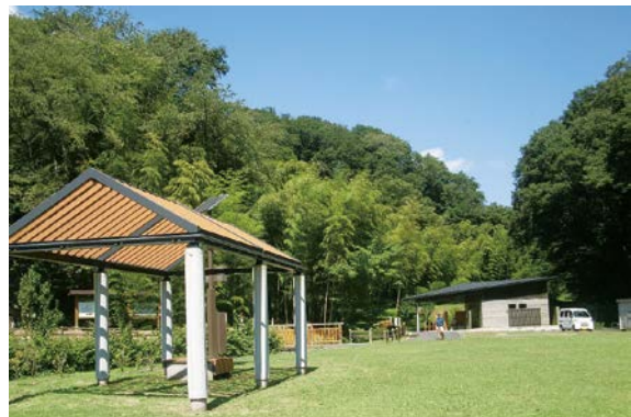
Grass land field and Toilet