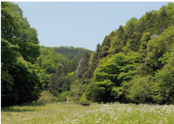
Dankiiri Plaza during Spring

Cladrastis sikokiana is a deciduous tree in the Fabaceae family which grow wild in the Ushida area. It is a rare species in the Kanto Region and said to only bloom once in several years and their flower is very rare to see. Oto Park confirmed its full bloom in June 2018.