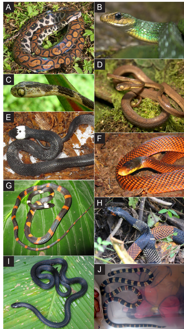
Figure 4. Snakes found at Wildsumaco Wildlife Sanctuary. A. Epicrates cenchria . B. Chironius exoletus . C. Immantodes cenchoa , QCAZ 10634. D. Immantodes lentiferus . E. Ninia hudsoni , QCAZ 10635. F. Oxyrhopus occipitalis . G. Oxyrhopus petolarius QCAZ 10657. H. Micrurus spixii . I. Micrurus steindachneri dorsal view. J. Micrurus steindachneri ventral view of same specimen.

Material examined. ECUADOR • 1 adult; Napo Province, 4 km down slope from WWS Lodge, dead on road to Pacto Sumaco; 00.6714°S, 077.5987°W; 1100 m a.s.l.; 25 July 2014; QCAZ 12807 • 1 adult; Napo Province, dead on road to Pacto Sumaco; 00.6932°S, 077.6040°W; 1267 m a.s.l.; 8 Aug. 2019; QCAZ 17532.