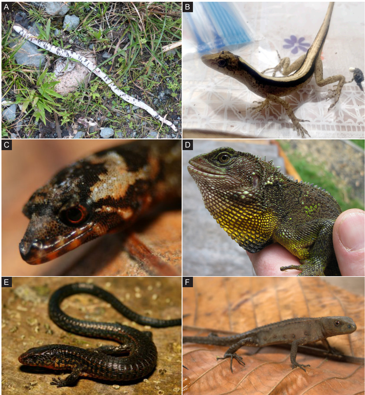
Figure 3. Lizards and amphisbaenians found at Wildsumaco Wildlife Sanctuary. A. Amphisbaenia bassleri . B. Anolis fuscoauratus , QCAZ 17530. C. Lepidoblepharis festae , QCAZ 10641. D. Enyalioides praestabilis male. E. Ptychoglossus brevifrontalis . F. Gelaneseaurus cochranae .

species is limbless and is white to cream with dark spots and blotches. The caecilians at WWS are either solid black or solid blue, with moist skin and scales not visible to the naked eye.