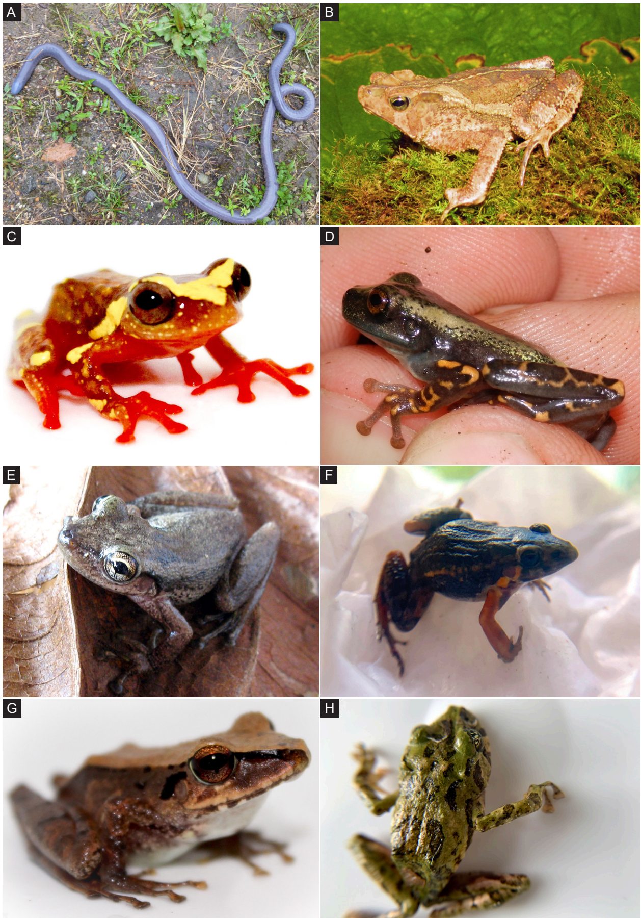
Figure 2. Species of amphibians found at Wildsumaco Wildlife Sanctuary. A. Caecilia abitaguae, QCAZ 57707. B. Rhinella maragaritifera, QCAZ 74799. C. Dendropsophus sarayacuensis. D. Osteocephalus verruciger juvenile. E. Scinax ruber. F. Adenomera hylaedactyla, QCAZ 76423. G. Pristimantis conspicillatus QCAZ 74811. H. Pristimantis katoptroides QCAZ 76442.