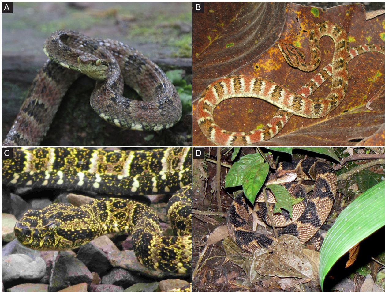
Figure 5. Pitvipers found at Wildsumaco Wildlife Sanctuary. A. Bothrops pulcher . B. Bothrops pulcher showing pink coloration common at this locality. C. Bothrops taeniatus . D. Lachesis muta .

but they range from 31–38. A lacunolabial scale is present, and there are 9–12 smooth to slightly keeled intersupraocular scales. Males have 213–231 ventrals and females have 220–236. The subcaudals are normally pale and number 31–56 in males and 33–50 in females. They are paired proximally but become more finely divided distally into 2–4 rows.