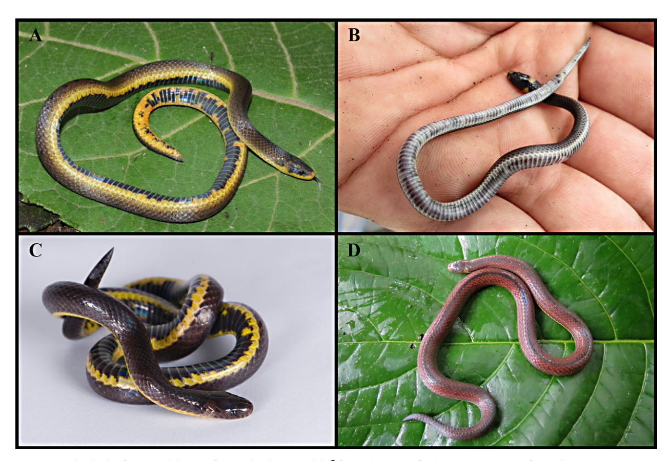
Figure 2. Individuals of Atractus Iehmanni from Colombia. A. Adult Q from 5 km east of Calarcá, Department of Quindío (UF Herp 192663). B-D. Unsexed and unvouchered juvenile, adult, and subadult, respectively, from the Department of Cauca, Municipality of Popayán.

The Quindío specimen matched Boettger's (1898) and Savage's (1960) descriptions of color pattern as follows: dorsum dark brown; each dorsal scale above rows 1 and 2 darkest on lower and posterior margins, and with minute black markings; indistinct dark vertebral stripe present; light nuchal collar suffused with dark pigment; top of head mostly dark, but prefrontal—internasal region with some light areas; supralabials and postnasals mainly dark, but lower portions light; throat and chin light, but with large brown spots on infralabials, mental, and chin shields; lateral part of ventrals and dorsal scale rows 1