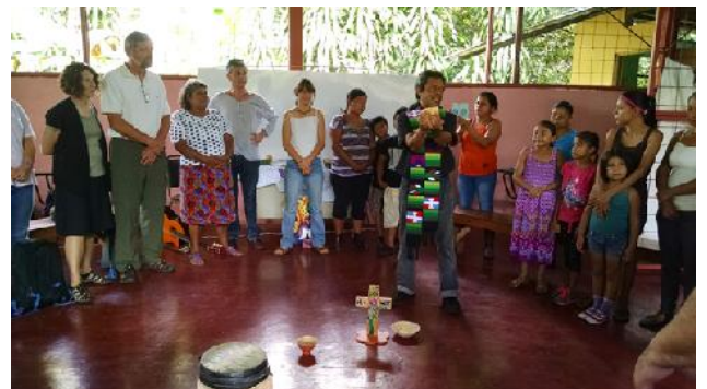
Worship with the Guatuso community, (2016 visit)

Our micro loan program has really grown! We began with 2 small loans, one of $300 to some women in the indigenous church community of Guatuso, who sell handmade cultural crafts, and one of $150 to some women of Quitirrisi, who create soaps, medicine and lotions from natural products. The Quitirrisi women have already repaid their loan, which will now be given to a new group of women from Quitirrisi, as a loan for their business. This program has been working so well, we are now working on our 3 rd , 4 th and 5 th loans! It has truly been a blessing!