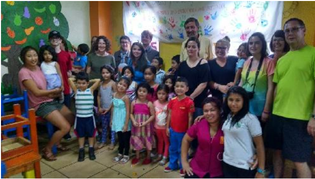
Our group at Casa Abierta, (2016 visit)

“They devoted themselves to the apostle’s teaching and to fellowship, to the breaking of bread and to prayer.” (Acts 2:42)