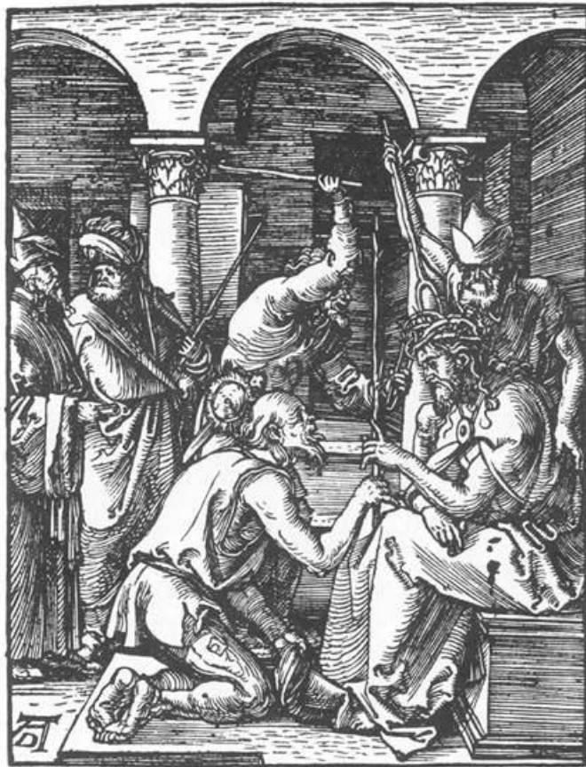
Christ Crowned with Thorns

And they offered him wine mixed with myrrh, but he did not take it. And they crucified him and divided his garments among them, casting lots for them, to decide what each should take. And it was the third hour when they crucified him. And the inscription of the charge against him read, "The