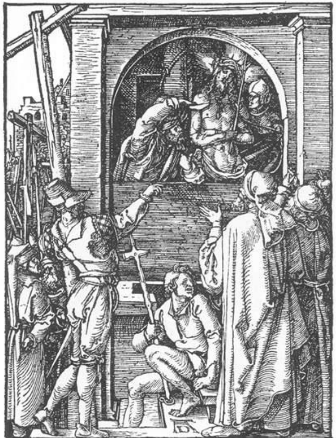
Behold the Man

And as soon as it was morning, the chief priests held a consultation with the elders and scribes and the whole council. And they bound Jesus and led him away and delivered him over to Pilate. And Pilate asked him, "Are you the King of the Jews?" And he answered him, "You have said so." And the chief priests accused him of many things. And Pilate again asked him, "Have you no answer to make? See how many charges they bring against you." But Jesus made no further answer, so that Pilate was amazed.