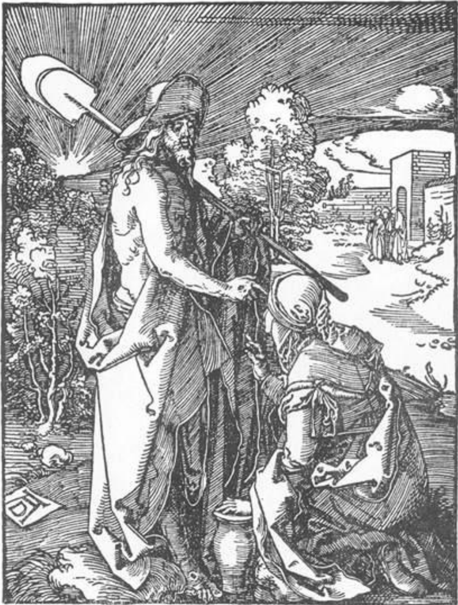
Noli Me Tangere (Do not cling to me - John 20:17)