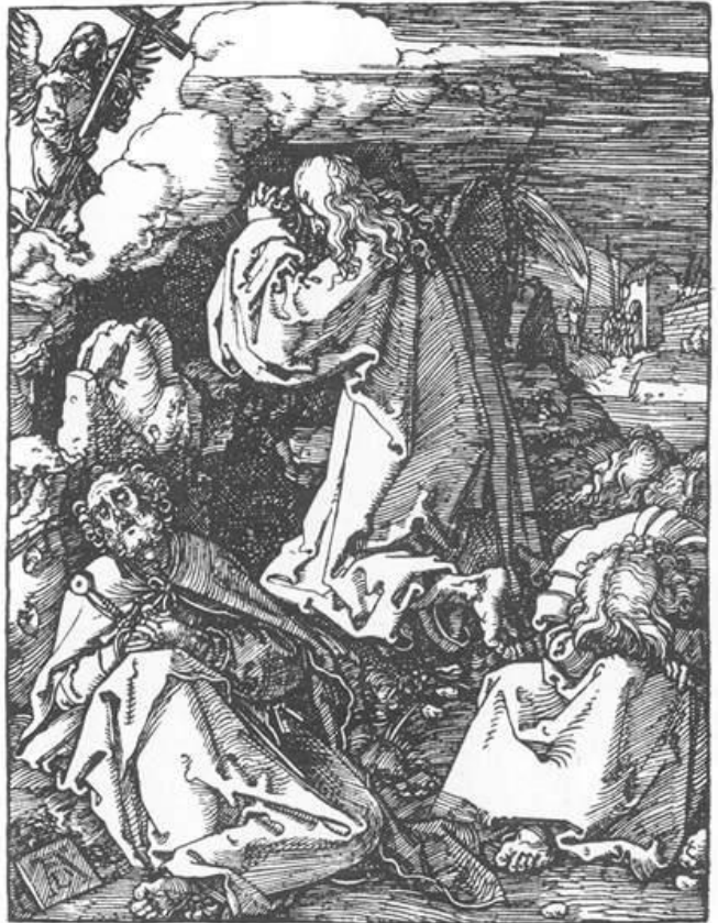
Agony in the Garden

And they went to a place called Gethsemane. And he said to his disciples, “Sit here while I pray.” And he took with him Peter and James and John, and began to be greatly distressed and troubled. And he said to them, “My soul is very sorrowful, even to death. Remain here and watch.” And going a little farther, he fell on the ground and prayed that, if it were possible, the hour might pass from him. And he said, “Abba, Father, all things are possible for you. Remove this cup from me. Yet not what I will, but what you will.” And he came and found them sleeping, and he said to Peter, “Simon, are you asleep? Could you not watch one hour? Watch and pray that you may not enter into temptation. The spirit indeed is willing, but