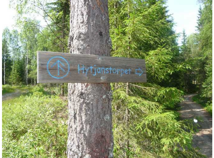
When we got to Svullrya we first went up to Hytjanstorpet. Here we are almost there.

which she had started. We drove the Toyota across and rented a cottage on Finnskogen Kro og Motell.