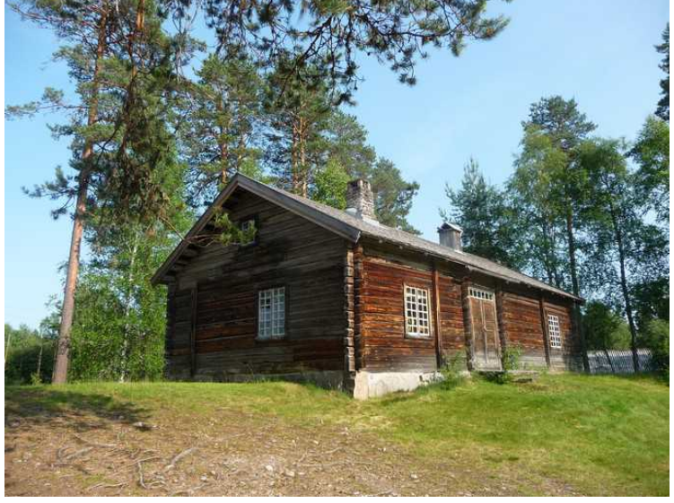
Here and on the next pages we see some of the houses on Finnetunet.