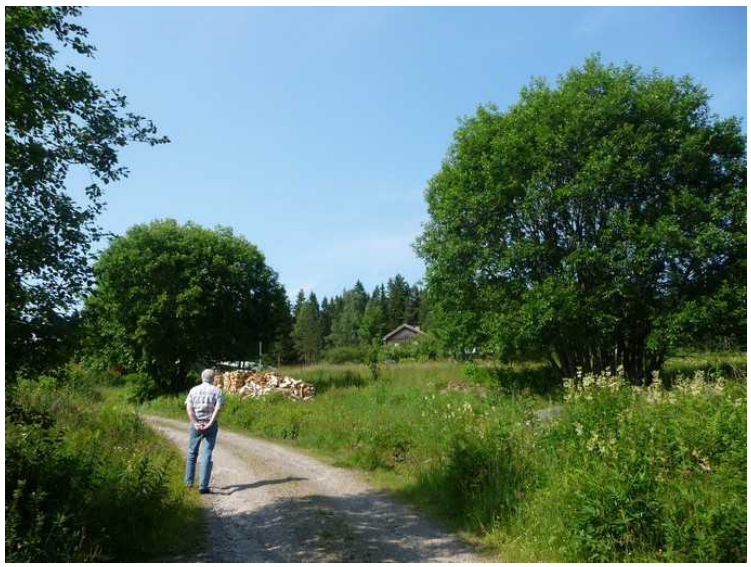
Here we get the first glimpse of Hytjanstorpet.