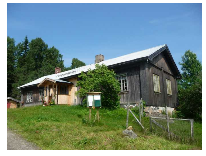
This is the main house on Hytjanstorpet.