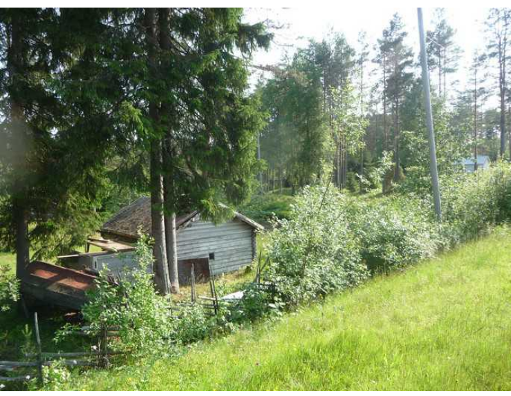
This is one of the houses on <u>Finnetunet</u> that we see from the main road.