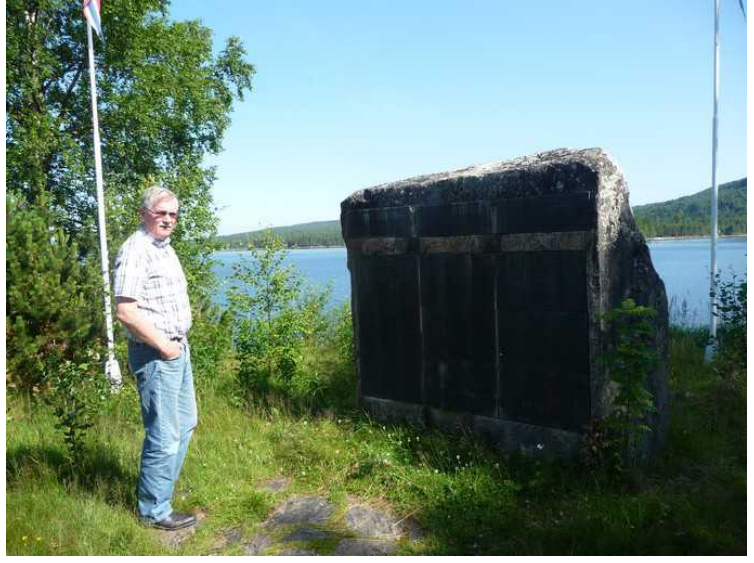
Alongside the way it is set up a stone board with the 430 Finnish families who came to the area.