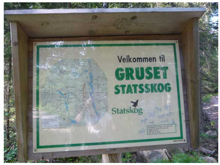
Hytjanstorpet is situated in Gruset Statsskog.