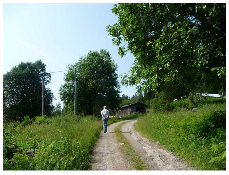
I'll go first.