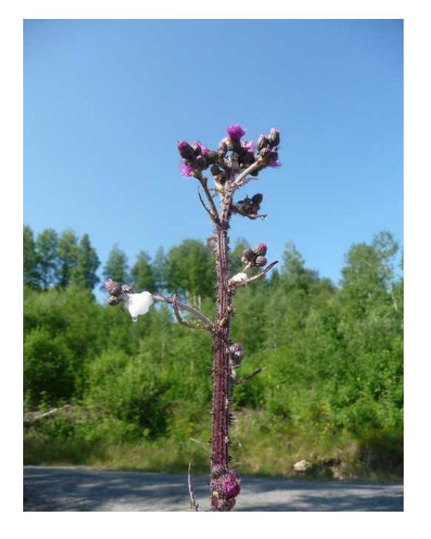
The next day we photographed a thistle.