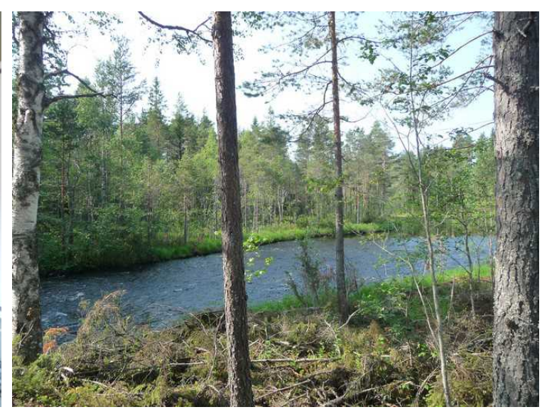
On the way back to Svullrya, we took pictures of the river Rotna.