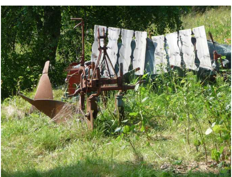
It is an old Kverneland Plough.