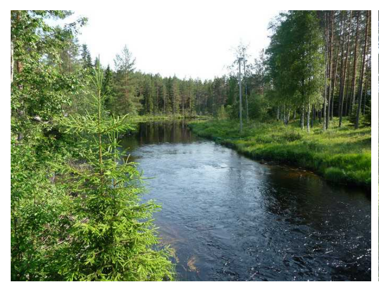
Standing on the bridge that goes over Rotna in Svullrya and looking down the river.