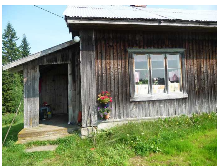
The entrance to the house through the porch.