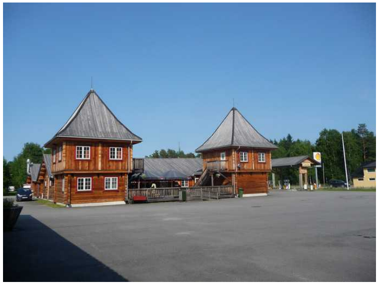
Here we see Finnskogen Kro og Motell from the main road that runs right past.