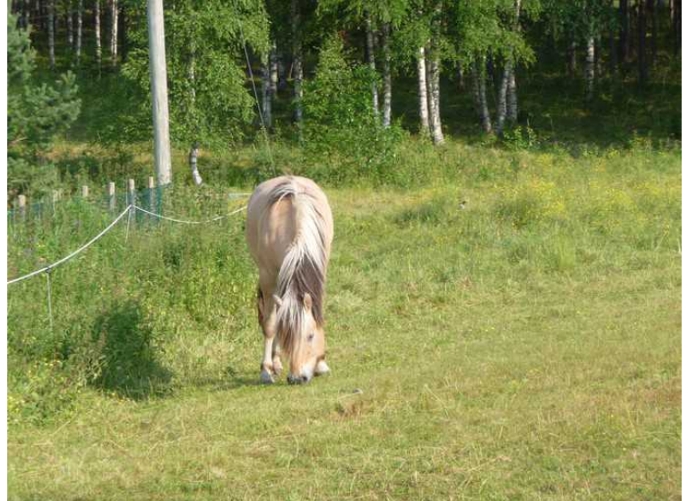
Her I get the chance to talk with a horse grazing right by Finnetunet.