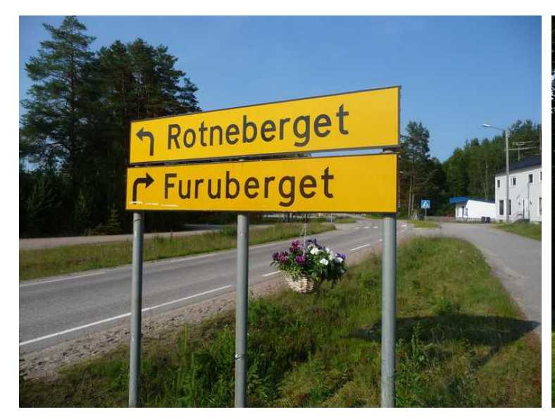
The traffic signs are decorated with flowering plants.