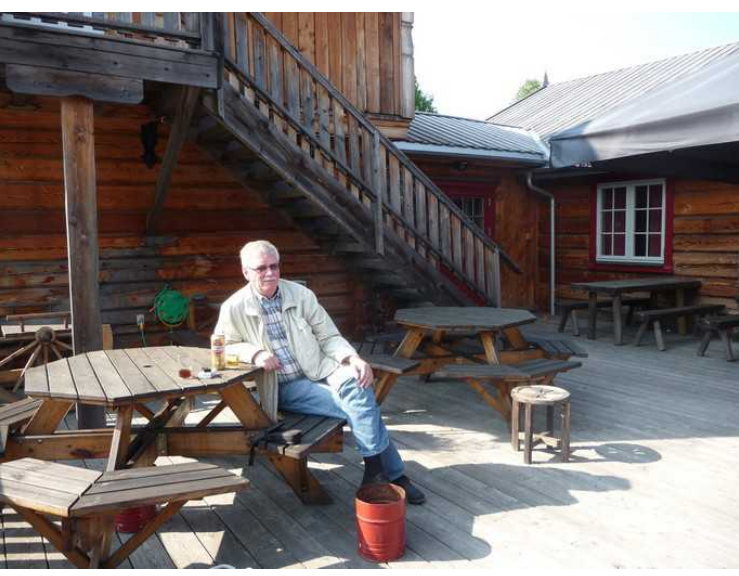
Being back at Finnskogen Kro og Motell it tastes good with a beer in the evening sun.