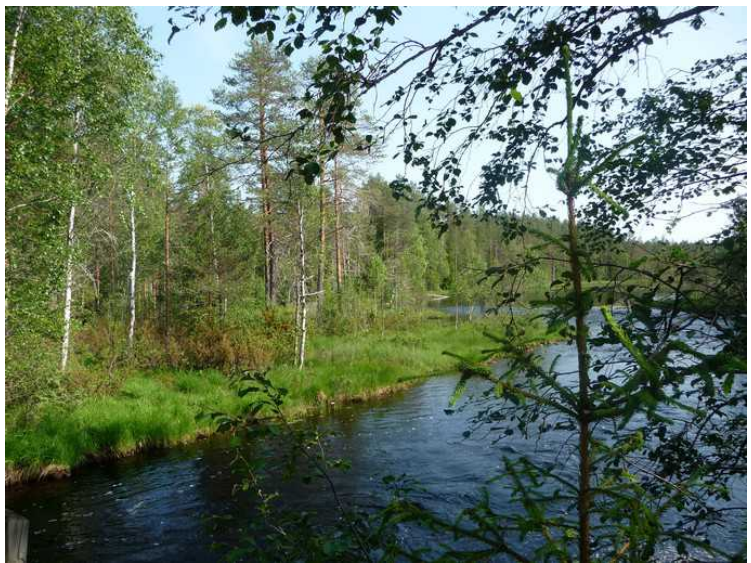
View down the river.