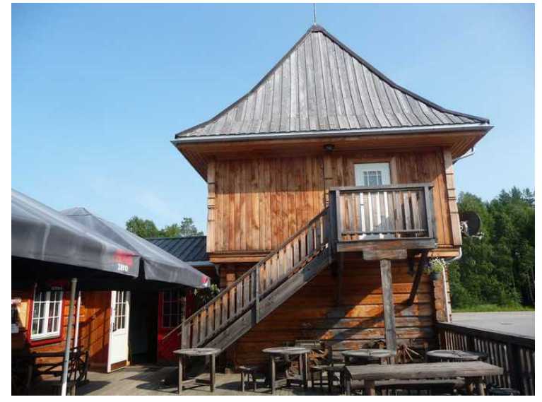
Special architecture of the main building.