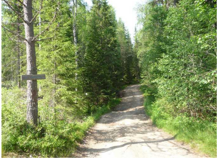
We parked the car down the hill and walked the rest of the way, up here.