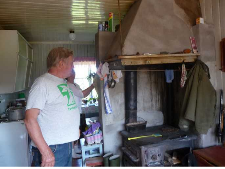
Inside the kitchen. Most of the work is done in the old way.