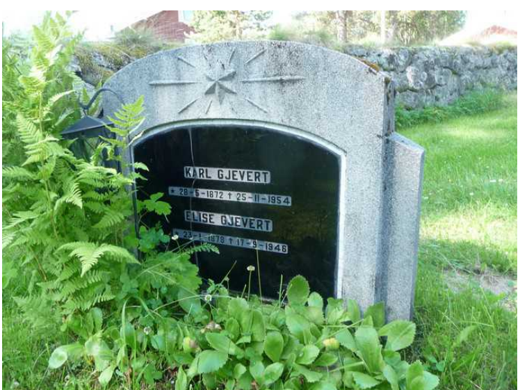
On the way back we stopped at the cemetery in Svullrya to look for tombstones to the family of Anne Berit.