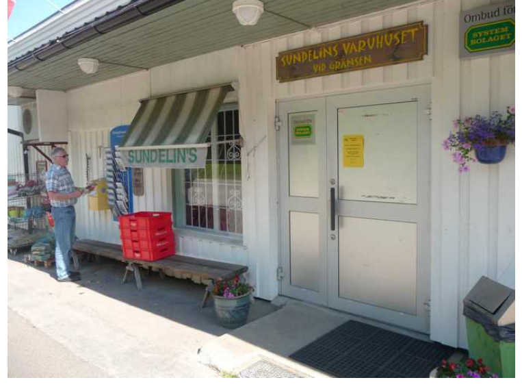
It was Sunday, so the store was closed.