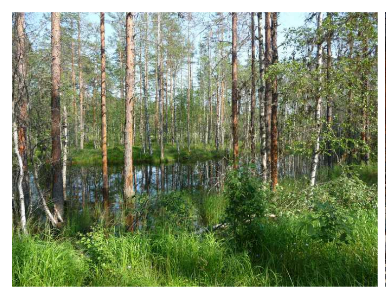
It is Bårderudsbekken that flows through this wetland area.