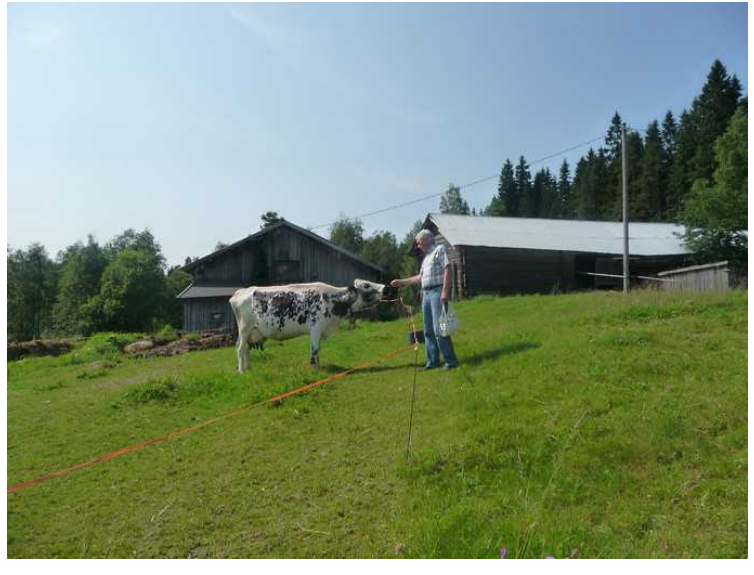
I must of course say «mø» to the cow.