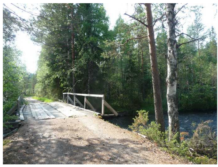
Here we have to drive over a bridge over Rotna.