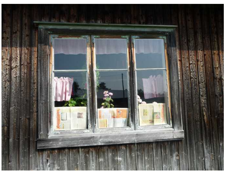
Flower plants inside the window frame are protected from the sun in the old way with newspapers.