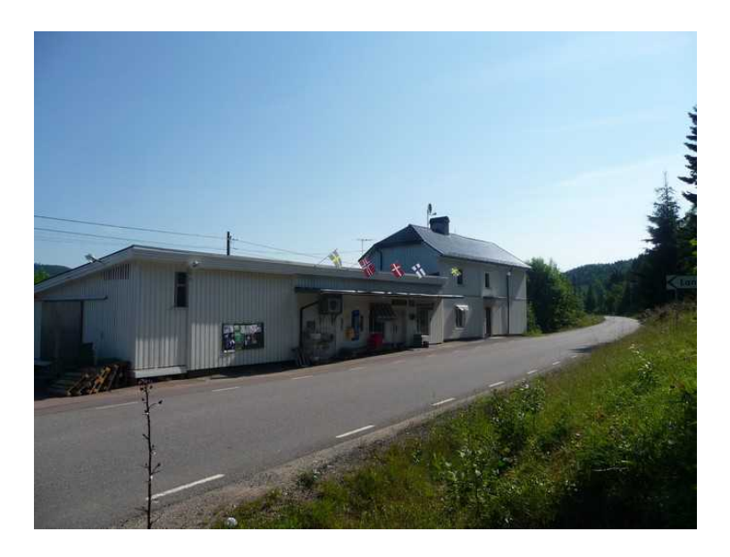
We drove across the border to see if Sundelin's still existed. It has been common for people running across the border and buy goods that are cheaper in Sweden than in Norway.