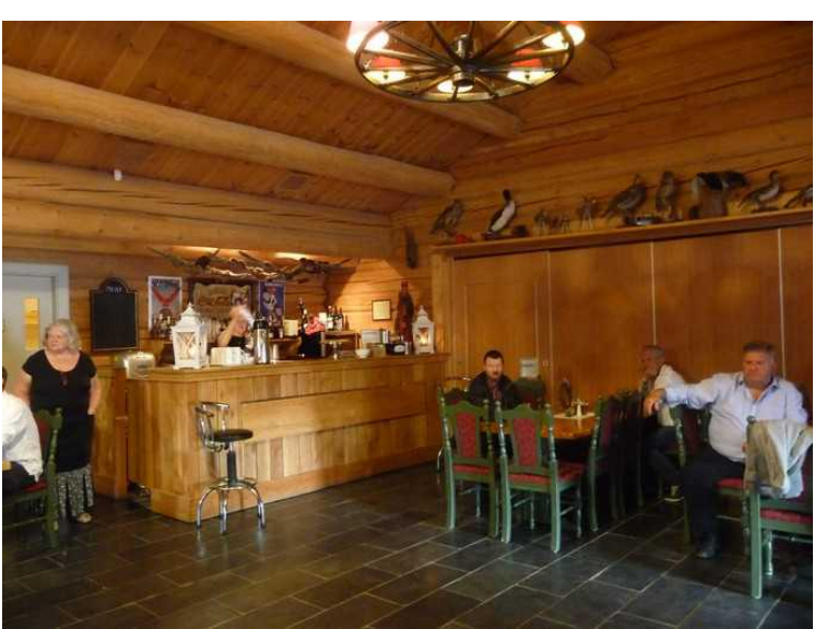
It is possible to buy food and drinks in the bar.