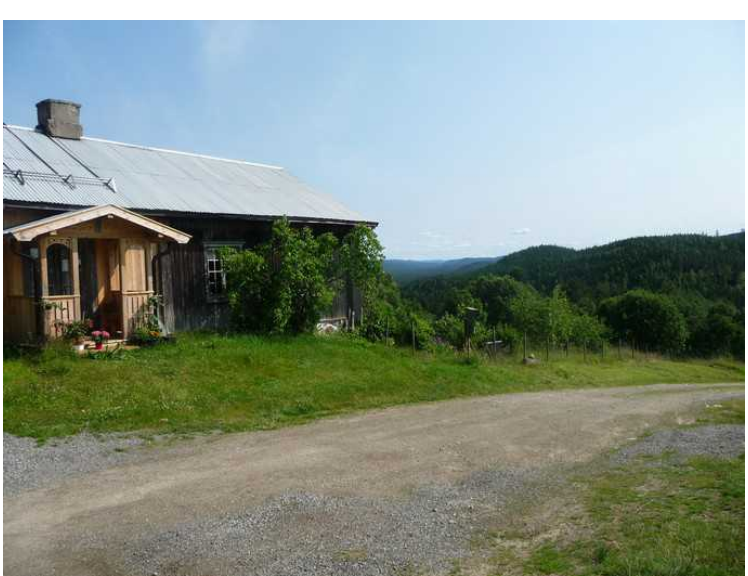
There are good views in all directions from here.