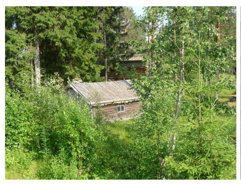
The house seen from another angle.