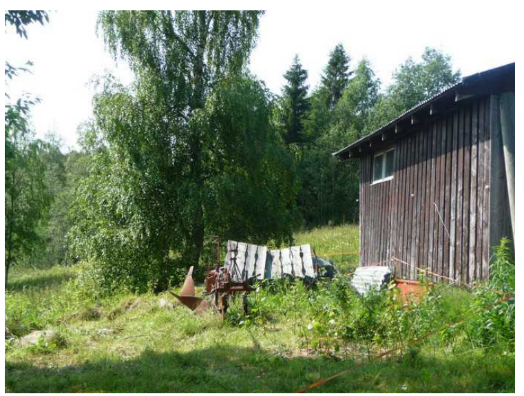
I see something I recognize.