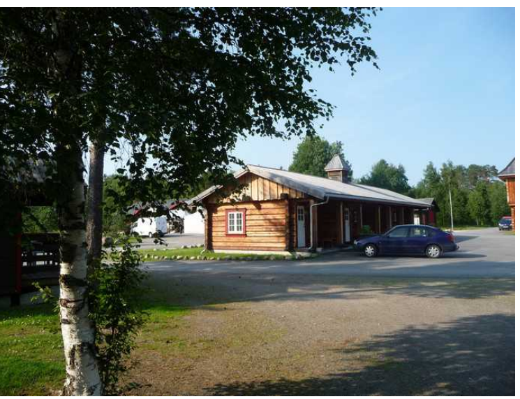
Here is the cabin we stayed in. The car is outside.