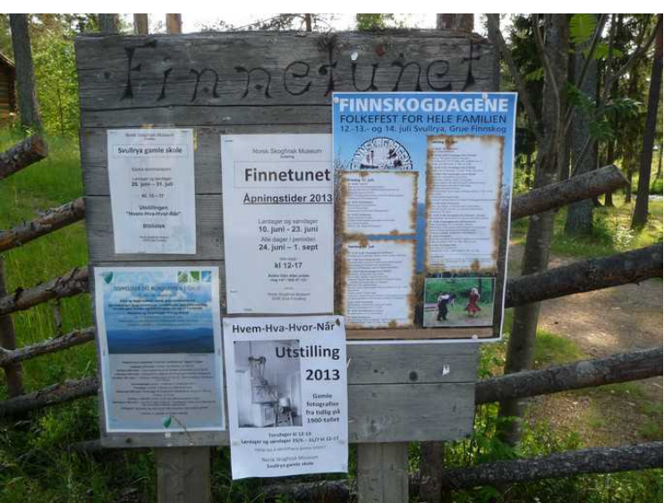
Here we are at the entrance to Finnetunet .