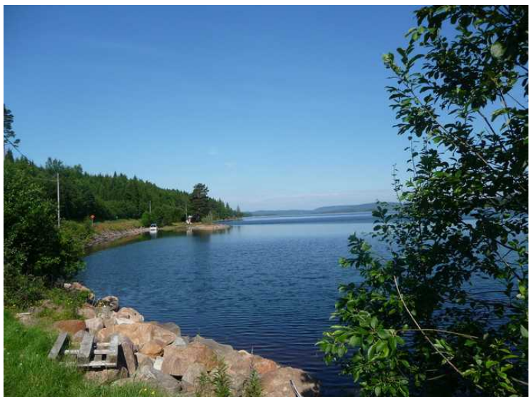
View of the sea Røgden.