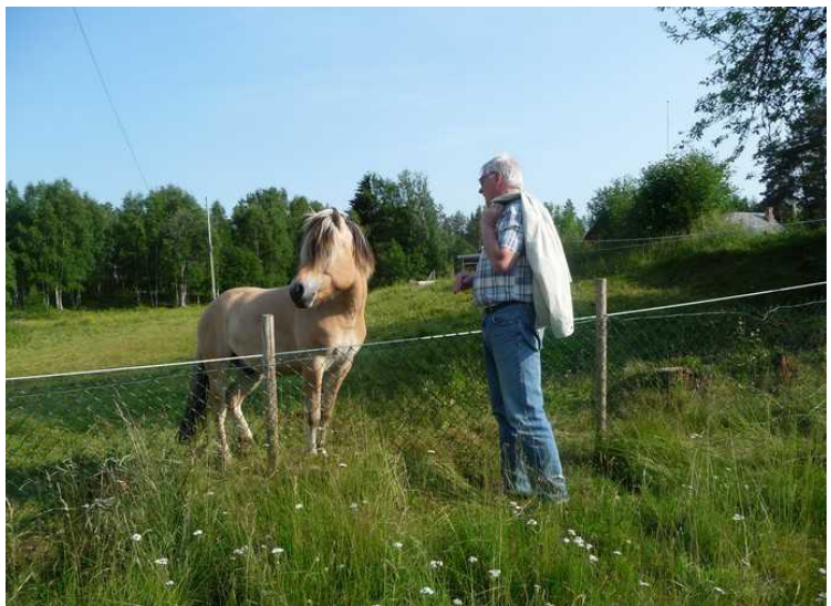
After that I was not interesting.