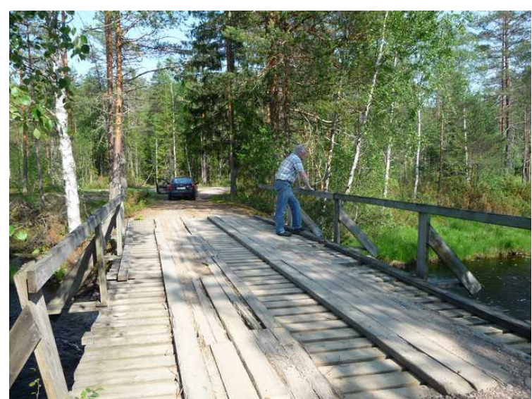
Here I stand and look down the river.