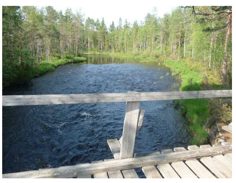
Another picture upriver.