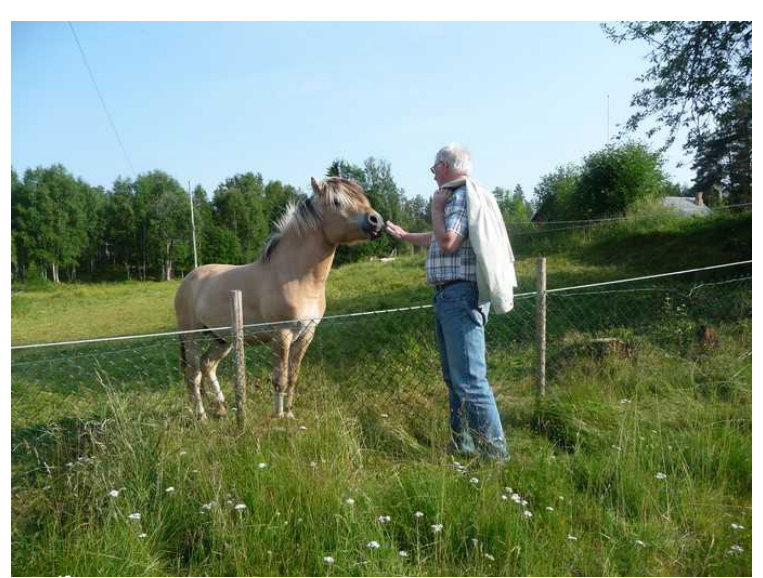
Here it greets me.