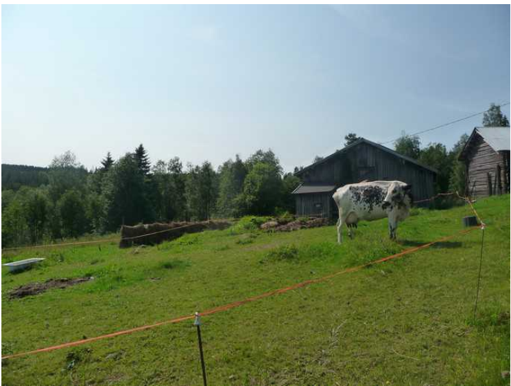
A cow goes out to pasture.