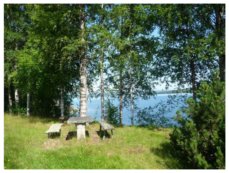
It is set up benches and tables near the stone board.