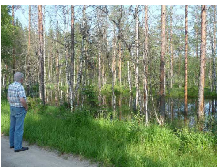
Here I stand and look out over a wetland area just before we get back to Svullrya.