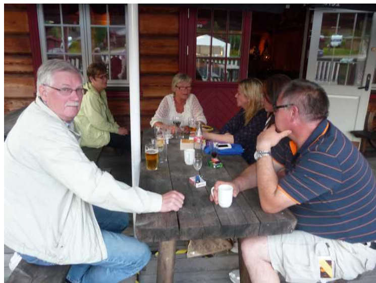
Afterwards we sat outside for a while in the nice weather.