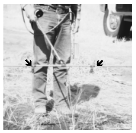
Figure 1. Spray rig used to apply herbicides over the seedlings. The nozzle positions allowed application to the side of seedlings.

Control of both broadleaf and grassy weeds is necessary for successful establishment and growth of tree plantings in the Great Plains region. Imazaquin alone may not control grasses sufficiently and needs to be combined with another herbicide, especially in the absence of adequate early spring precipitation. Pendimethalin alone and in combination with imazaquin, as applied in this study, can be used for controlling weeds with little damage noted 90 days after treatment to the woody plants tested. About 88% had slight damage or no damage, and 7% had slight damage, with slight reddening of silver maple and some brown leaves on arborvitae. Only one of the four Populus clones tested, P-26, and golden currant, showed any substantive reduction in height, and survival was good for all species. These results show that any of the four pendimethalin treatments applied during the dormant season on the 15 clones/species of woody plants studied were effective in controlling weeds while causing little or no damage to the plants.