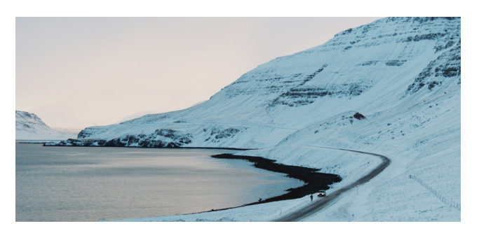
<u>Canary</u> Erlendur Sveinsson

A young couple's world is thrown upside down during a head-on collision on a remote road in Iceland.