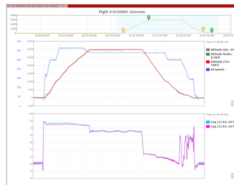
Express Readout trace parameter check