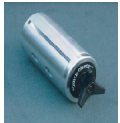
The new Quick Chuck Model C-76170 for 76 mm cores is pictured here.

Warranty: Limited 3-year Parts and Labour Warranty.