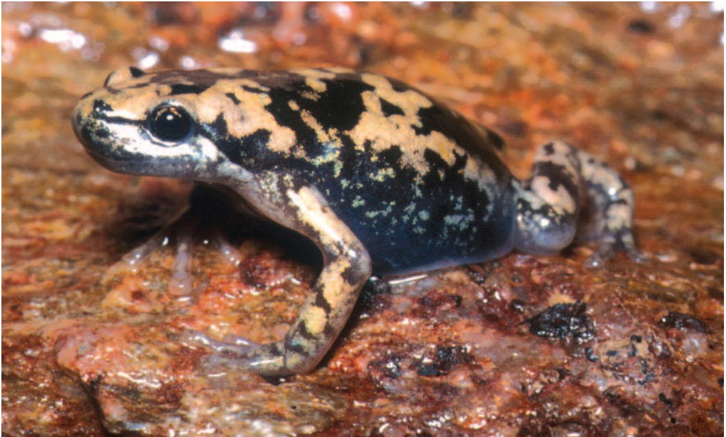
FIGURE 2. Marbled Rubber Frog, Phrynomantis annectens Werner, 1910, from Palmwag, Kunene Region, Namibia.