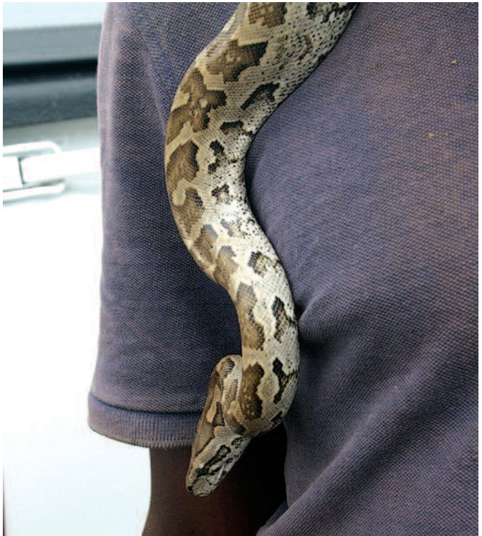
FIGURE 18. Adult Southern Rock Python, Python natalensis (Gmelin, 1788), being sold by a local near Bruco village.

COMMENTS. — A local at a site near Bruco village was selling a single live individual of Python natalensis , presumably collected nearby. In the province, this species is known from Maconjo (Bocage 1895; Broadley 1984) and from Giraul River (Bocage 1896; Broadley 1984). Python natalensis was for many years considered as a subspecies of Python sebae (Gmelin, 1789) (Broadley 1984), but was elevated to specific status by Broadley (1999) based on morphological differences as well the evidence of the overlapping distributions (Broadley and Cotterill 2004). Although the current taxonomic arrangement appears