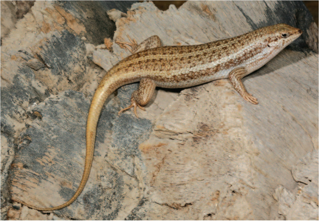
FIGURE 13. Adult Hoesch's Skink, Trachylepis hoeschi (Mertens, 1954), from Kamanjab, Kunene Region, Namibia.

from Iona National Park. The Angolan records extend the core distribution of its range in north-western Namibia (Branch 1998).