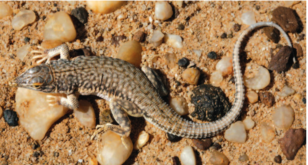
FIGURE 15. Adult specimen of Anchieta's Shovel-snout Lizard, Meroles anchietae , (Bocage, 1867) from gravel plains north of Henties Bay, Erongo Region, Namibia.

COMMENTS. —Bocage (1867) described this species from "Mossamedes." Bocage (1895) subsequently clarified that the types had come from the littoral zone at Rio Coroca [= Rio Curoca, southern Namibe Province, Angola]. The range of this species extends towards Namibia to the area of Conception Bay on the central coast. Although it is well documented within its Namibian range, this specimen is only the third published locality for Angola. The species is, however, well represented from numerous localities in Namibe by specimens in the Ditsong National Museum of Natural History.