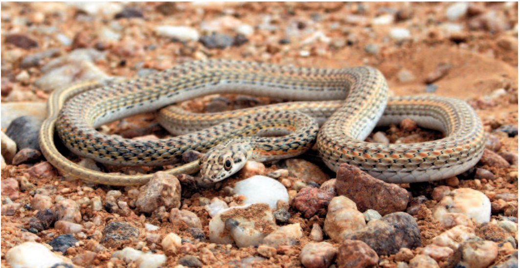
FIGURE 19 – Adult Karoo Sand Snake, Psammophis notostictus Peters, 1867, from Espinheira.

COMMENTS. — Psammophis notostictus is easily recognizable from all other southern African Psammophis by its single cloacal shield and the presence of two preoculars (Broadley 1975b, 1977, 2002). These two specimens have both of these diagnostic characters. The species is known for Angola, but only from Namibe Province. The closest published records of the species are in Rio São Nicolau (Loveridge 1940; Broadley 1975b, 2002), Moçamedes [Namibe city] (Bocage 1887; Loveridge 1940), and Curoca River (Loveridge 1940; Broadley 2002). Our records expand the known distribution of the species further south in the country, although it is continuous southwards throughout much of western southern Africa (Branch 1998).