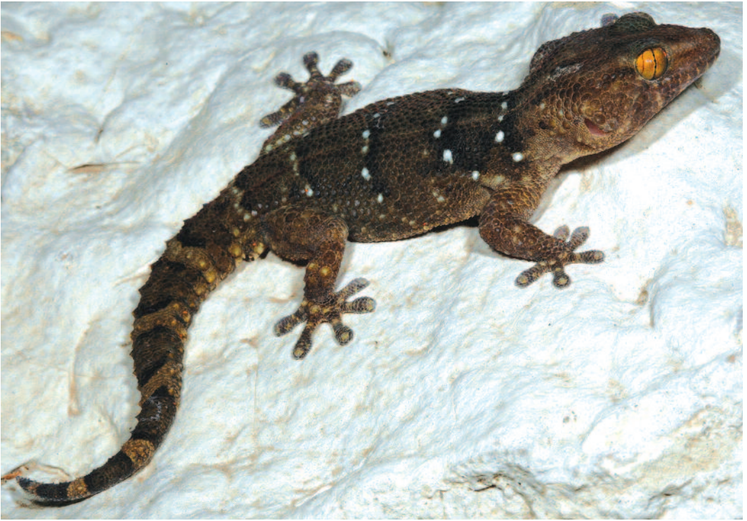
FIGURE 5. Adult male FitzSimons' Thick-toed Gecko, Chondrodactylus fitzsimonsi (Loveridge, 1947), from northern Kaokoveld, Kunene Region, Namibia.