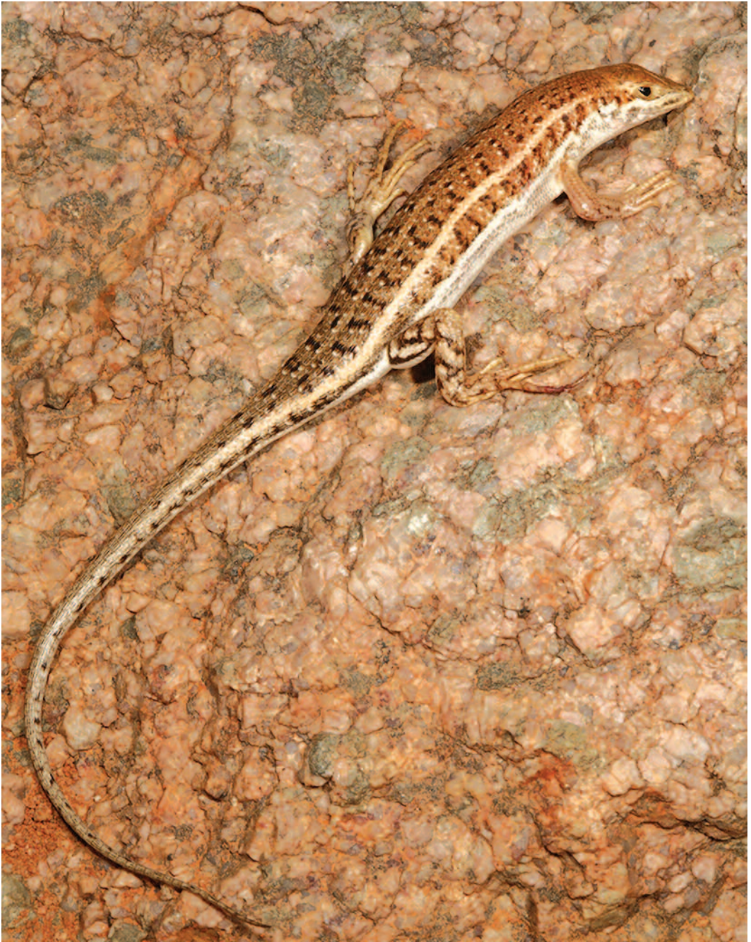
FIGURE 14. Adult Wedged-Snouted Skink, Trachylepis acutilabris (Peters, 1862), from Kamanjab, Kunene Region, Namibia.