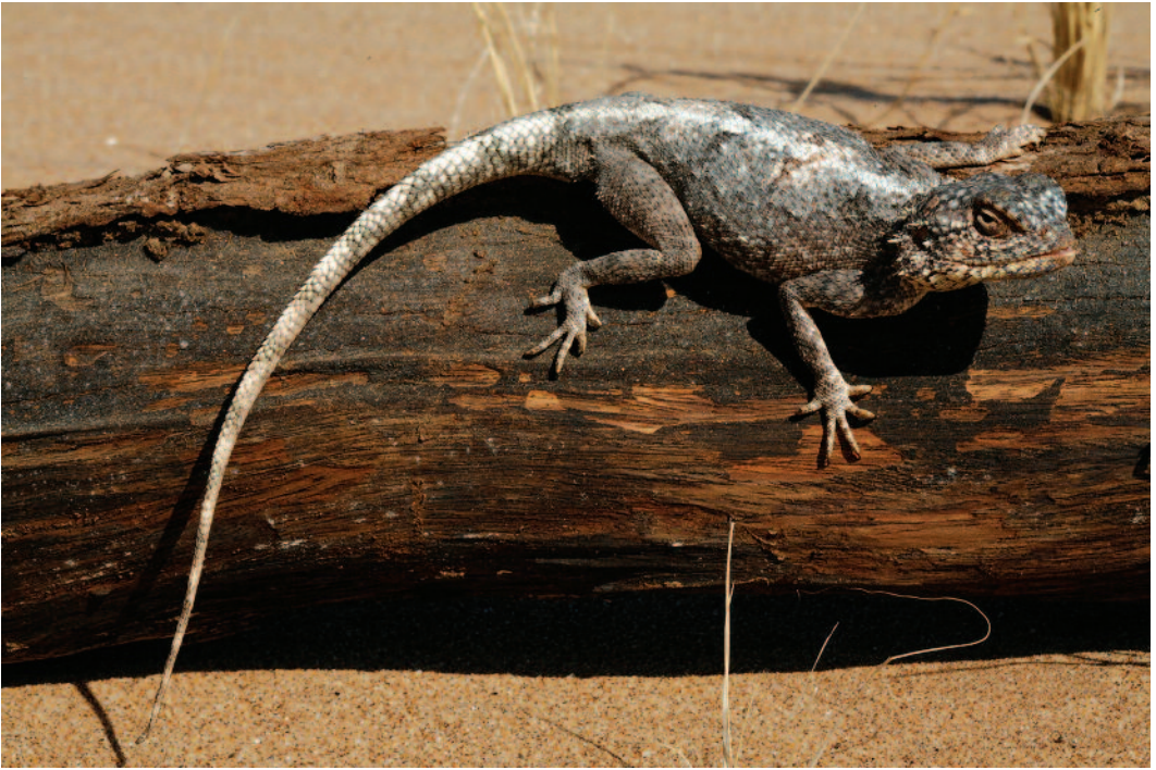
FIGURE 3. Anchieta's Ground Agama, Agama anchietae Bocage, 1866, from Sesfontein, Kunene Region, Namibia.