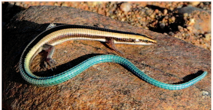
FIGURE 16. Adult Dwarf Plated Lizard, Cordylosaurus subtessellatus (Smith, 1844), from near Espinheira.

COMMENTS. — The species is known from the coastal areas of Benguela Province (Bocage 1867, 1895; Boulenger 1887) and from the Curoca River in Namibe Province (Bocage 1895). This specimen represents the southernmost record for Angola. The specimen was found hiding