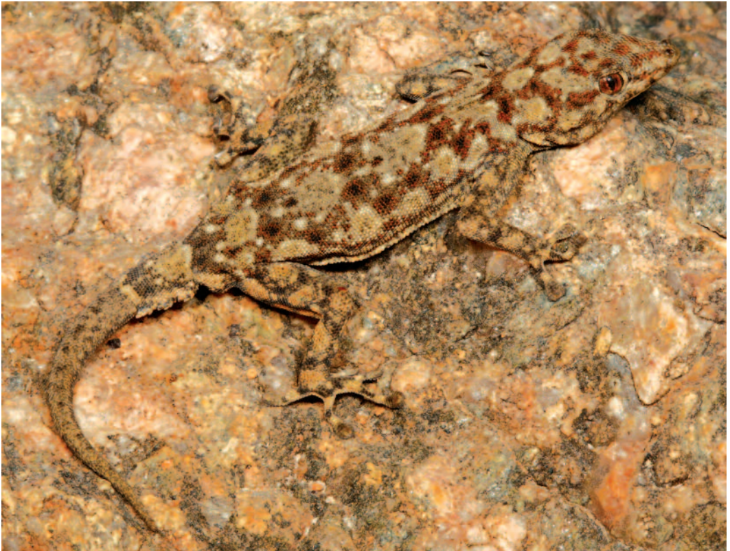
FIGURE 8. Adult Barnard's Namib Day Gecko, Rhoptropus barnardi Hewitt, 1926, from Kamanjab, Kunene Region, Namibia.

16°17'0.93"S, 12°33'39.81"E, 247 m (CAS 254852), 16°17'14.3"S, 12°33'35.9"E, 238 m (CAS 254856), 16°17'24.01"S, 12°33'43.9"E, 270 m (CAS 254863), Namibe-Lubango road, 2 km east (by road) of Manguairas, south side of the road, 5 December 2013, 15°2'40.8"S, 13°9'32.6"E, 664 m (CAS 254890); NNP, 28 November 2013, 15°46'23.4"S, 12°19'58.9"E, 264 m (CAS 254954).