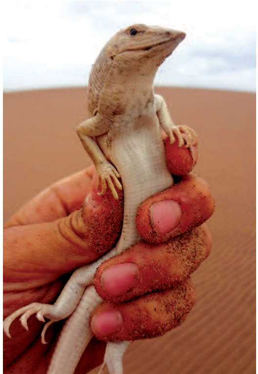
FIGURE 17. Adult female Desert Plated Lizard, Gerrhosaurus skoogi Andersson, 1916, from the coastal dunes, near Praia do Navio.

COMMENTS. — This species was encountered basking at the sun in the coastal dunes SSW of Namibe, especially in dune valleys areas. When approached, these lizards dive into the sand, disappearing rapidly. The species is easily identified by its unique morphology and peculiar ecology. Sand trails resulting from the specimens walking in the dunes were noted. A total of five specimens were collected, three of which are at CAS and two at INBAC. Several additional animals were observed in the area but not collected. Males have a distinct black throat and venter, and are considerably larger than the females. The only published Angolan records are from the type locality, Porto Alexandre, between Mossamedes and the mouth of the Cunene River (Andersson 1916; Fitzsimons 1953), approximately in the same area as our material. Although the species is the most distinctive of all Gerrhosaurus (Nance 2007), it is unambiguously nested among more typical taxa, implying its unique features are relatively recently derived autapomorphies (Lamb et al. 2003; Lamb and Bauer 2013).