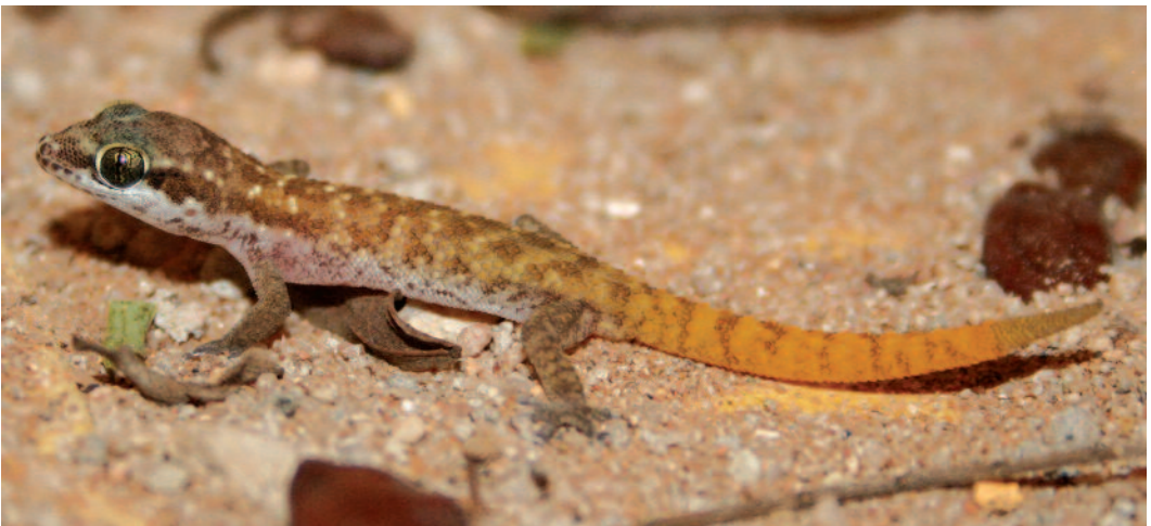
FIGURE 7. Juvenile Angolan Thick-toed Gecko, Pachydactylus angolensis (Loveridge, 1944), from Chimalavera, Benguela Province, Angola.

COMMENTS. — This poorly known taxon was described from Benguela Province (Loveridge