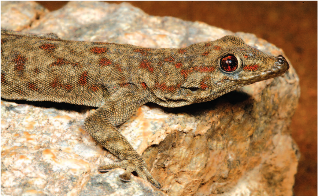
FIGURE 10. Adult Boulton's Namibe Day Gecko, Rhopropus boultoni boultoni Schmidt, 1933, from east of Kamanjab, Kunene Region, Namibia.

16°12'1.2"S, 12°24'0.1"E, 343 m (CAS 254834); INP, Rio Curoca crossing, south side of river, 1 December 2013, 16°18'14.7"S, 12°25'0.0"E, 210 m (CAS 254849–254850), 2 nd December 2013, 16°17'19.7"S, 12°33'40.0"E, 244 m (CAS 254857–254858, CAS 254861–254862), 29 November 2013, 16°18'15.6"S, 12°25'1.56"E, 209 m (CAS 254865); Leba Pass, between river and highway, 5 December 2013, 15°4'13.2"S, 13°14'37.7"E, 1676 m (CAS 254880); Namibe-Lubango road, 2.0 km east (by road) of Manguairas, south side of the road, 5 December 2013, 15°2'40.8"S, 13°9'32.6"E, 664 m (CAS 254892), 15°2'40.7"S, 13°9'31"E, 640 m (CAS 254894, 15°0'55.1"S, 12°38'32.8"E, 497 m (CAS 254902); Namibe-Lubango road, road marker 59, 1.8 km west by road of Caraculo, 6 December 2013, 15°00'55.1"S, 12°38'32.8"E, 497 m (CAS 254903); Pico Azevedo, 7 December 2013, 15°32'2.4"S, 12°29'31.1"E, 359 m (CAS 254921–254926), 15°32'5.8"S, 12°29'29.5"E, 366 m (CAS 254946–254947, CAS 254949–254950); Espinheira, 29 November 2013, 16°47'20.2"S, 12°21'27.9"E, 457 m (CAS 254958).