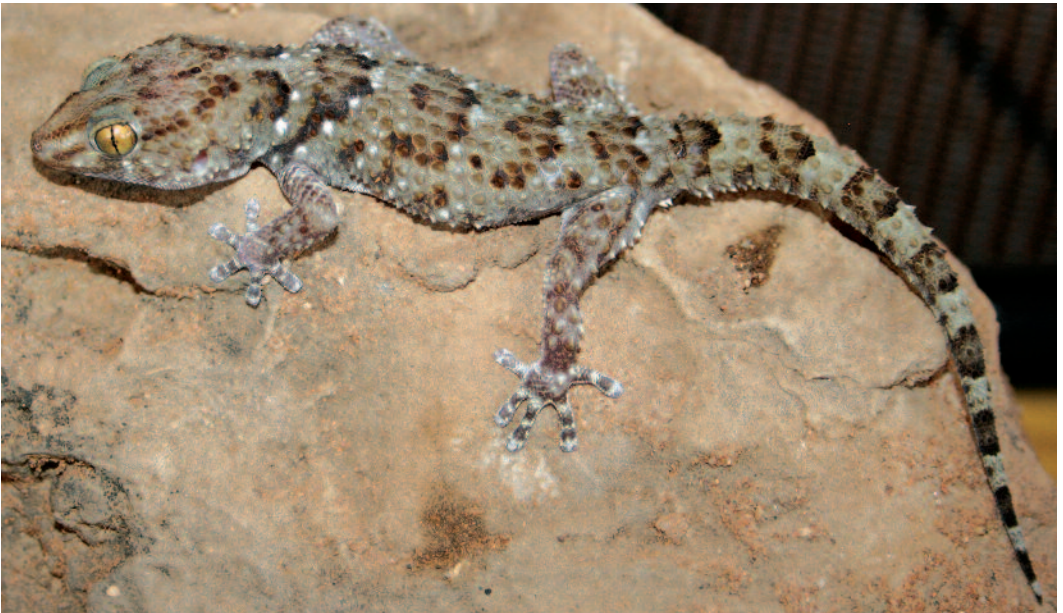
FIGURE 6. Subadult male Pulitzer's Thick-toed Gecko, Chondrodactylus pulitzerae . (Schmidt, 1933), from Chimalavera, Benguela Province, Angola.