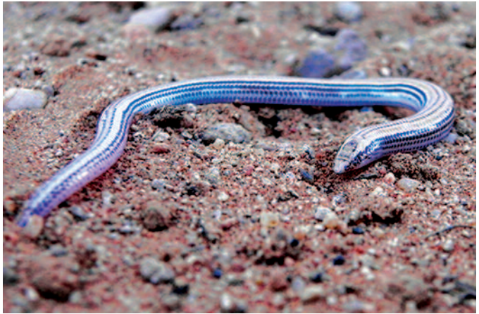
FIGURE 11. Adult Bogert's Speckled Western Burrowing Skink Typhlacontias punctatissimus bogerti Laurent, 1964, from Pico Azevedo.

COMMENTS. — Haacke (1997) reviewed the taxonomic and nomenclatural history of Typhlacontias punctatissimus and its subspecies and recognized two sympatric subspecies in southern Angola — T. punctatissimus punctatissimus Bocage, 1873, and the Angolan endemic T. punctatissimus bogerti Laurent, 1964. In all of our specimens, the second and third upper labials are in contact with the eye and there is a second supraocular. Both characters fit the description presented by Haacke (1997) as diagnostic for T. punctatissimus bogerti . The species is known to be viviparous and one female specimen (CAS 254945) contains an almost fully developed neonate.