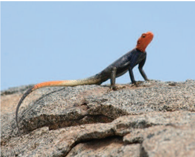
FIGURE 4. Adult male Namib Rock Agama, Agama planiceps Peters, 1862, from Pico Azevedo.

16°48'45.0"S, 12°20'22.9"E, 463 m (CAS 254753); Omauha Lodge camp, 2 December 2013, 16°11'55.4"S, 12°24'0.3"E, 335 m (CAS 254832); INP, north of Tambor, 4 December 2013, 15°59'46.0"S, 12°24'24"E, 307 m (CAS 254839); INP, south side of Curoca River crossing, 29 November 2013, 16°18'15.6"S, 12°25'1.56"E, 209 m (CAS 254845), 1 December 2013, 16°18'14.8"S, 12°24'2159.8"E, 210 m (CAS 254848); Pediva Hot Springs, 2 December 2013, 16°7'19.7"S, 12°33'40.0"E, 244 m (CAS 254859); Namibe-Lubango road, road marker 59, 1.8 km west by road from Caraculo, north side of the road,