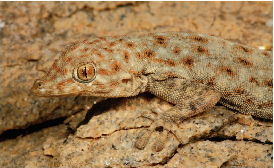
FIGURE 9. Close-up of head of adult specimen of Two-Pored Namib Day Gecko, Rhopropus biporosus FitzSimons, 1957 from northwest of Palmwag, Kunene Region, Namibia.

16°48'43.19"S, 12°16'16.55"E, 485 m (CAS 254959), Espinheira, 29 November 2013, 16°47'19.9"S, 12°21'27.4"E, 457 m (CAS 254794), 16°47'7.08"S, 12°21'16.02"E, 457 m (CAS 254802–254803), 16°47'7.02"S, 12°21'16.86"E, 457 m (CAS 254805), 16°47'4.26"S, 12°21'16.62"E, 457 m (CAS 254811), 16°47'12.71"S, 12°21'28.67"E, 457 m (CAS 254813), 16°47'20.2"S, 12°21'27.9"E, 457 m (CAS 254958), 30 November 2013, 16°47'14.3"S, 12°21'29.4"E (CAS 254820), 16°47'8.7"S, 12°21'30.3"E, 457 m (CAS 254821), 16°47'18.1"S, 12°21'26.2"E, 457 m (CAS 254822), 16°47'33.6"S, 12°21'19.0"E, 457 m (CAS 254823), 16°47'41.5"S, 12°21'17.3"E, 457 m (CAS 254824), 16°47'45.3"S, 12°21'15.9"E, 457 m (CAS 254825); NNP, 28 November 2013, 15°46'27.4"S, 12°19'59.2"E, 264 m (CAS 254957–254958).