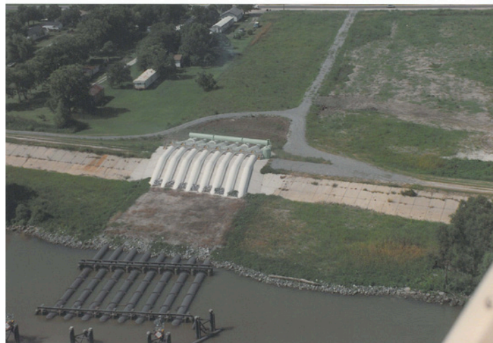
West Pointe a la Hache siphon's levee crossing and intake on the west bank of the Mississippi River.

Proposed siphon improvements include: on-site and remote instrumentation to provide continuous monitoring and measurement of actual flow rates; remote instrumentation to provide instant notification when any pipes lose their prime, and thereby initiate immediate response to re-establish the vacuum; on-site vacuum pump, control equipment, and instrumentation to immediately re-establish flow when any pipes lose their prime; and an air release system to allow escape of accumulated gases to maintain the siphon vacuum.