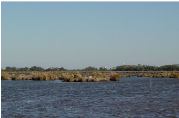
Open water area being restored to emergent marsh.

As a result of leveeing the Mississippi River for navigation and flood control, the West Pointe a la Hache wetlands were cut off from the historic overbank flooding of the river. Without continued sediment input, marshes couldn't maintain viable elevations due to ongoing subsidence. In addition, oil and gas canals disrupted hydrology and facilitated saltwater intrusion further degrading the marsh. Beginning in 1993, the siphons at West Pointe a la Hache were operated to re-introduce Mississippi River water, fine sediments, and nutrients into this area. However, land loss rates have continued to be high. An opportunity exists to create marshes directly in the influence area of the siphons using sediment from the nearby Mississippi River. The created marshes should benefit from the effects of the re-introduced Mississippi River water from the siphons.