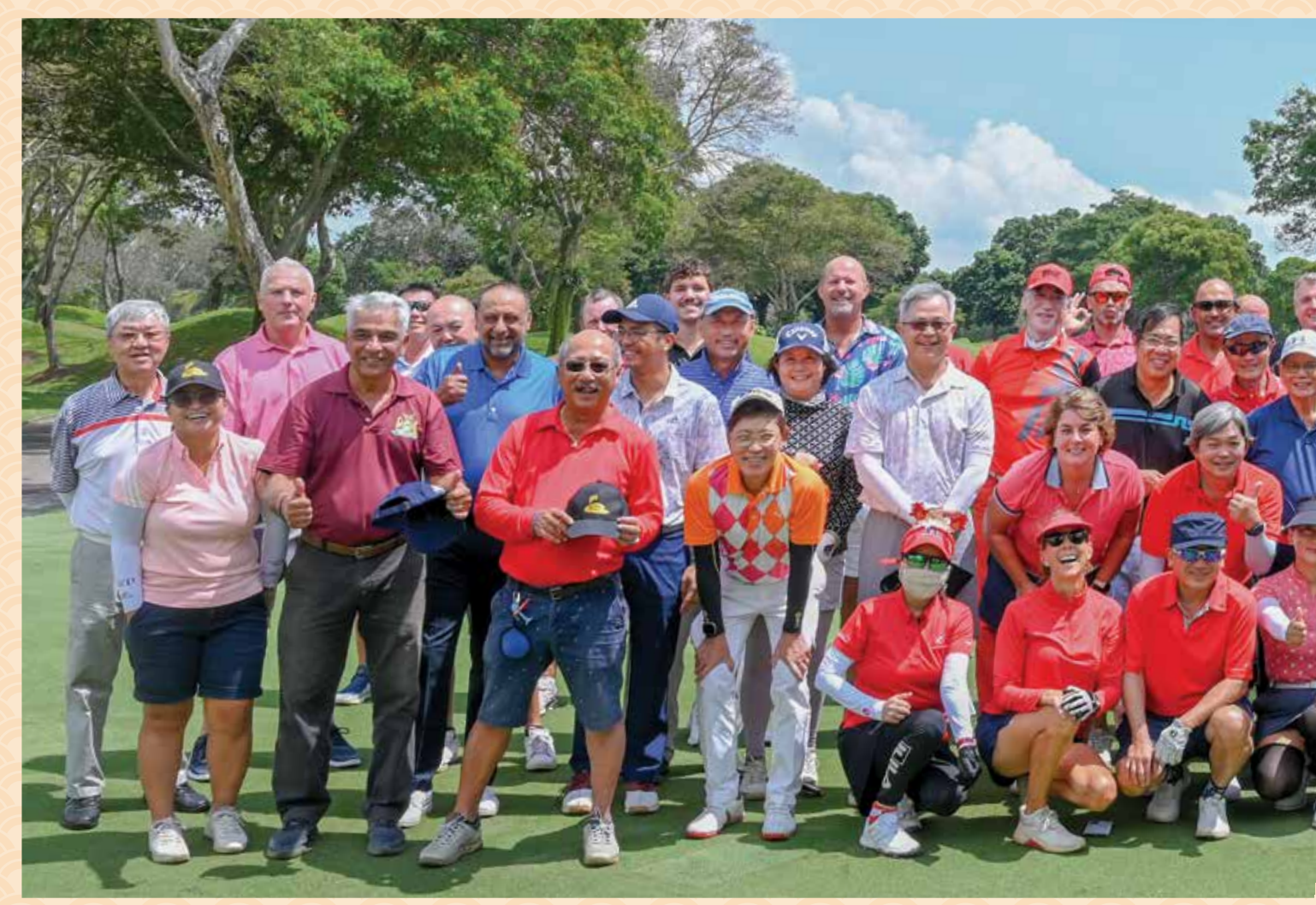
The Hong Bao Golf Competition attracted more than 70 participants.

The four-handicapper, who moved to Singapore from China, fired five birdies en route to a one-under-par 71 over the Masters Course. Fast out of the blocks with birdies at the third and fourth, Tao reached the turn in one-under 35.