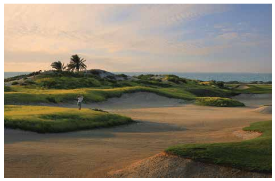
Saadiyat Beach Golf Club is set on the shores of the Arabian Gulf.

world-class, floodlit practice range with state-of-the-art Toptracer range technology and Golf Academy with a floodlit ninehole, par-three course where holes range in distance from 83 yards to 185 yards.