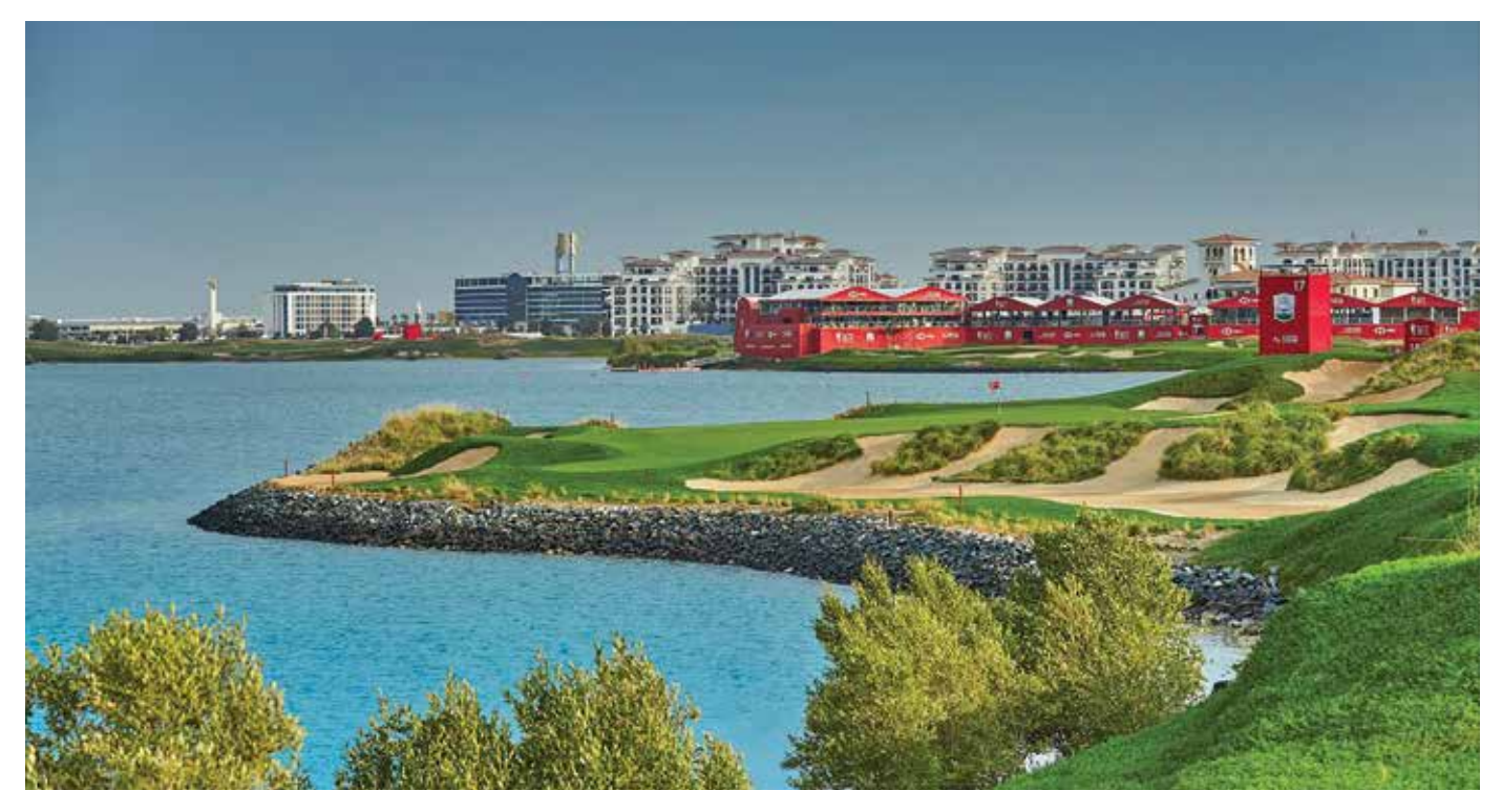
Yas Links offers breathtaking views on every hole.

AS AN ESTEEMED MEMBER OF LAGUNA NATIONAL GOLF RESORT CLUB, NOT ONLY DO YOU AND Your family have privileged access to our award-winning championship courses and club facilities, but you're also privy to an exclusive collection of more than 200 prestigious golf properties around the world via IMG prestige.