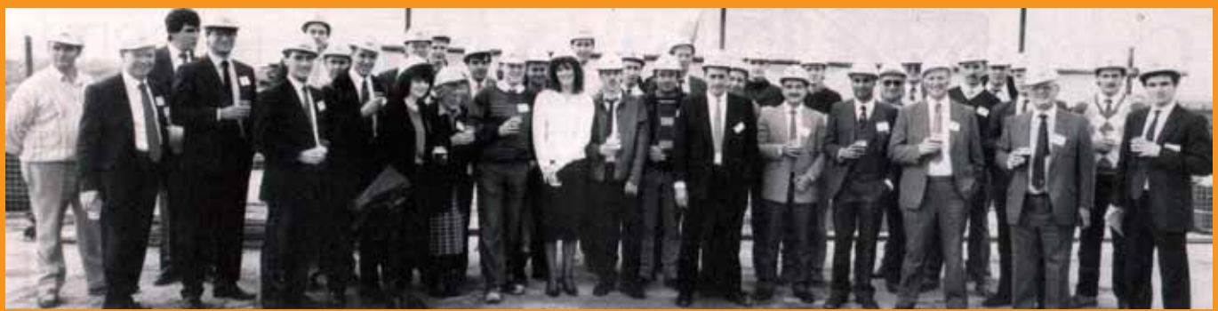
Site team from Midlands Region at the Charles Darwin Centre project in Shrewsbury.

There was a major celebration in Shrewsbury as Midlands Region marked major progress on the Charles Darwin Centre. More than 50% of the 42 shops and nine stores on three retail levels had already been let. The project was due to open in the autumn of 1989. It involved: 2700 tonnes of structural steel, 500,000 bricks, 22,000 m sq blocks, 12,500 cu metres of concrete, 31,000 precast planks, 60ft difference in site level and 400 piles to a depth of 100ft.