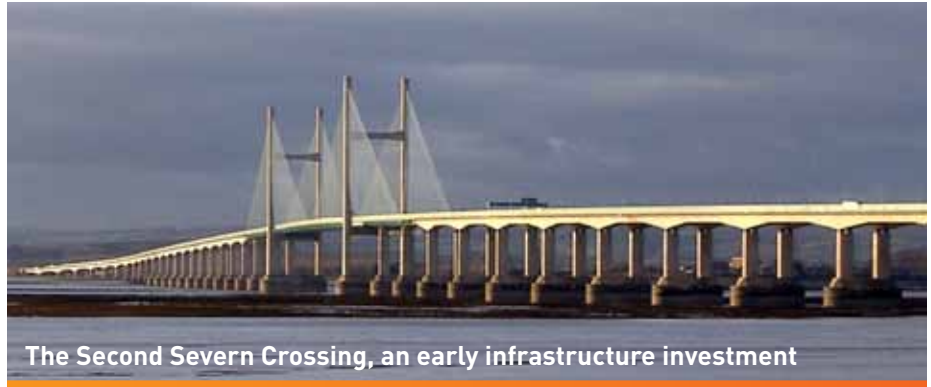
The Second Severn Crossing, an early infrastructure investment

"I don't know how people felt about windmills going up near their homes in times gone by, but you probably couldn't buy an old windmill for love nor money these days – people live in them"