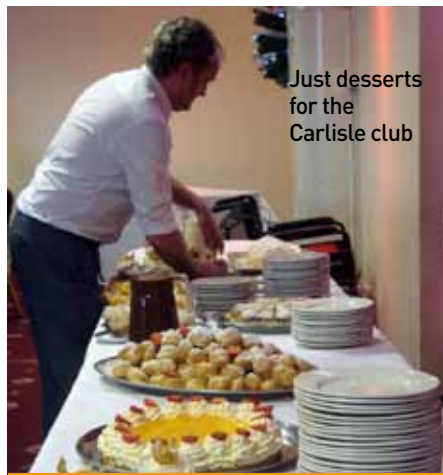
Just desserts for the Carlisle club