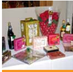
REAL table full of prizes for the raffle