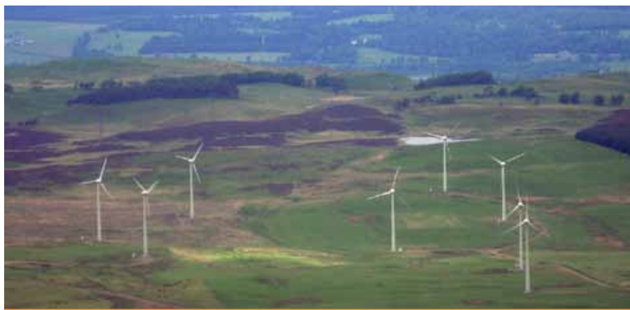
An on-shore Scottish wind farm

It is intended that John Laing Investments Ltd will subscribe