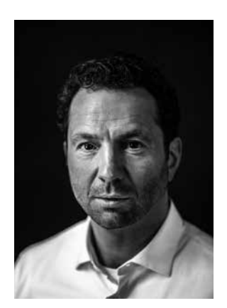
SATURDAY. MAY 30<sup>TH</sup>. 2015 9:30am Ceremony