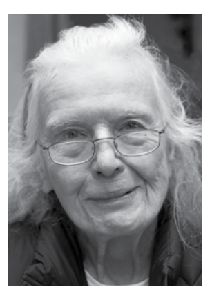
FRIDAY. MAY 29<sup>™</sup>. 2015 2pm Ceremony