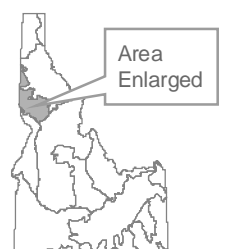
Figure 18. Palouse Prairie habitats.