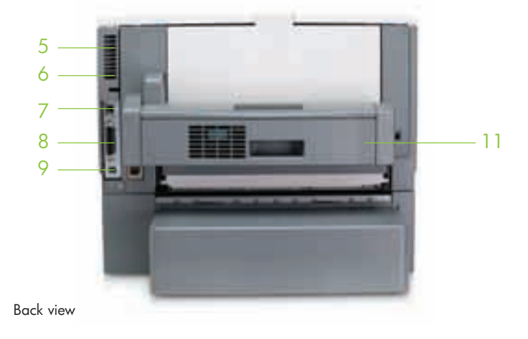
HP LaserJet 5200dtn Printer shown