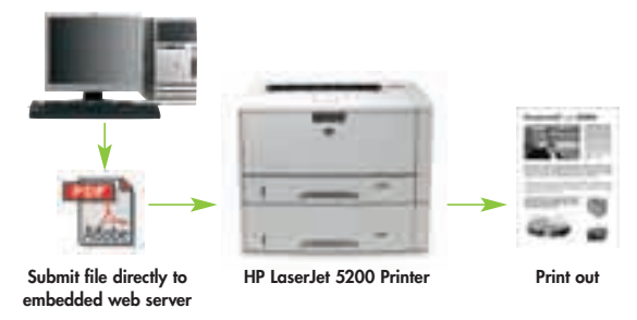
Direct PDF is convenient and simple