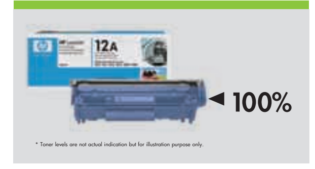
Full toner right out of the box, prints up to 12,000 pages<sup>2</sup>