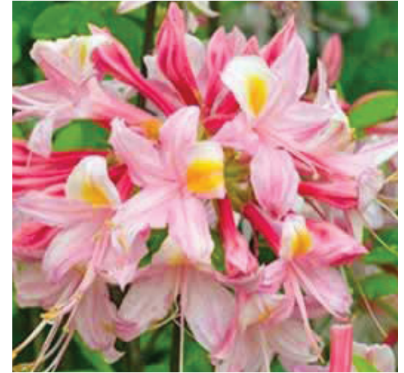
Rhododendron 'Choptank Rose' azalea Native to New Jersey

Friends of Laurelwood Arboretum Connecting People with Nature