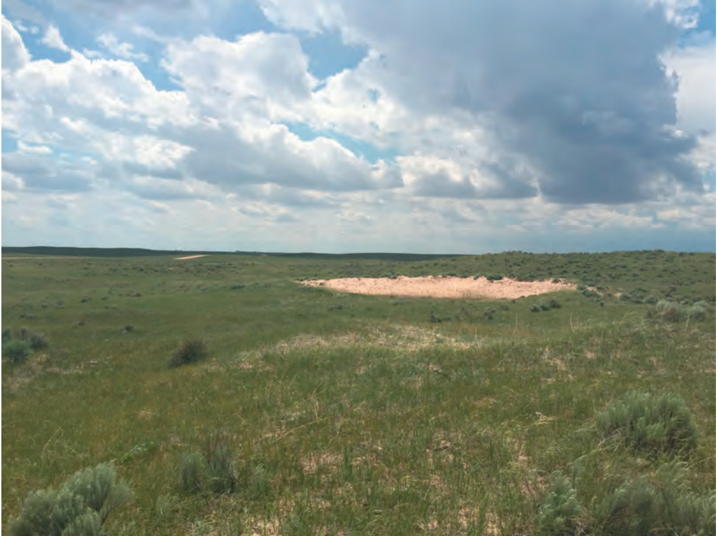
FIG. 4. Blowout in sandsage prairie, Perkins County, Nebraska.