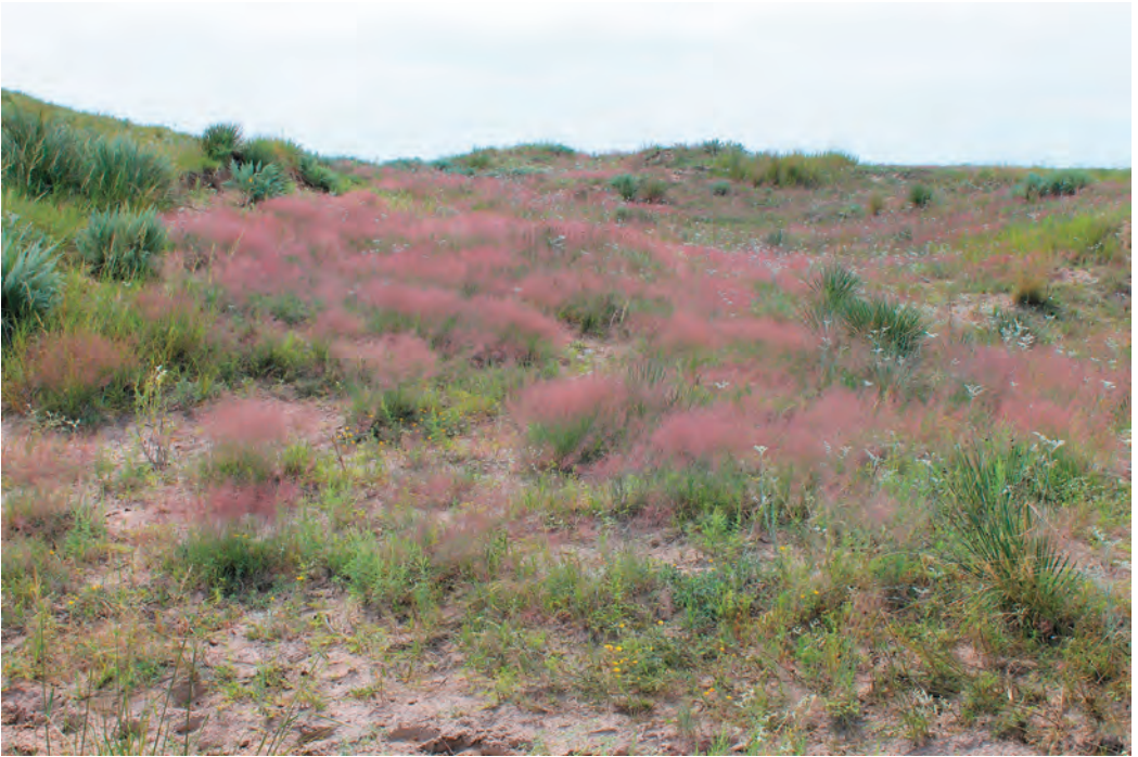
FIG. 6. Stabilizing dune sub-community dominated by Muhlenbergia pungens , Dundy County, Nebraska.

longifolia and Sporobolus cryptandrus also important (Hulett et al. 1988). The forb component is often similar to that of the surrounding shortgrass or mixed grass prairie.