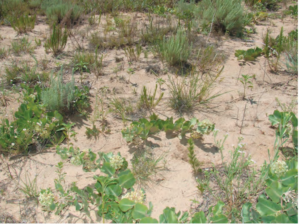
FIG. 7. Stabilizing dune sub-community, Cheyenne County, Colorado. Prominent forbs include Asclepias arenaria and Dalea cylindriceps .

occurred in interdunal valleys, swales, and depressions where the water table was close to the surface, and along riparian corridors of intermittent streams (Ramaley 1939; Hullett et al. 1988; Farrar 1993a, 1993b; Neid et al. 2007). Such areas have largely disappeared due to depletion of the regional aquifers by irrigation for crop production but historically supported a mosaic of aquatic communities and subirrigated meadow-like vegetation dominated by graminoids like Elymus smithii and Panicum virgatum .