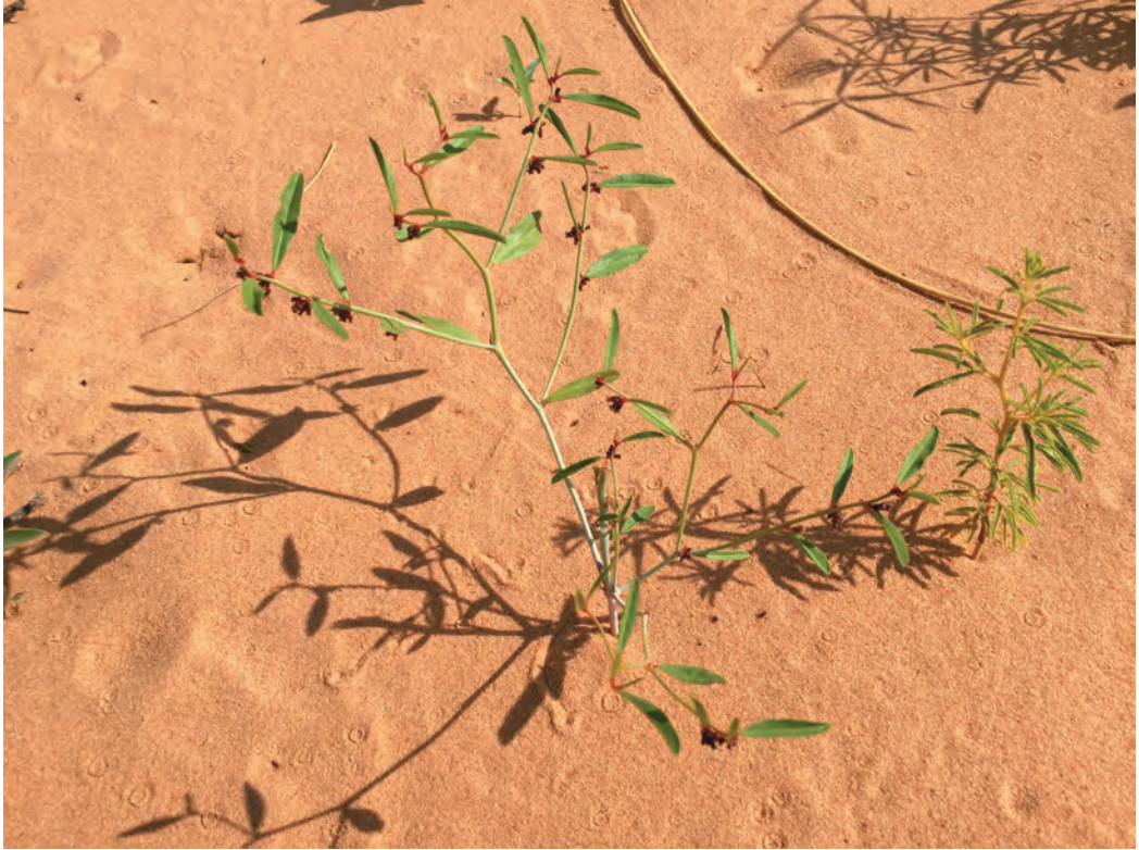
FIG. 5. Annual forbs Phyllanthus warnockii and Polanisia jamesii in open sand habitat, Woodward County, Oklahoma.

soils of the upper slopes of dunes. This habitat often supports a grass-dominated vegetation in which the shrub component of Artemisia filifolia is lacking or significantly reduced. This sub-community is the equivalent of the “Sand Prairie Community” of Ramaley (1939) and typically occurs in relatively small patches or inclusions within the overall context of sandsage prairie.