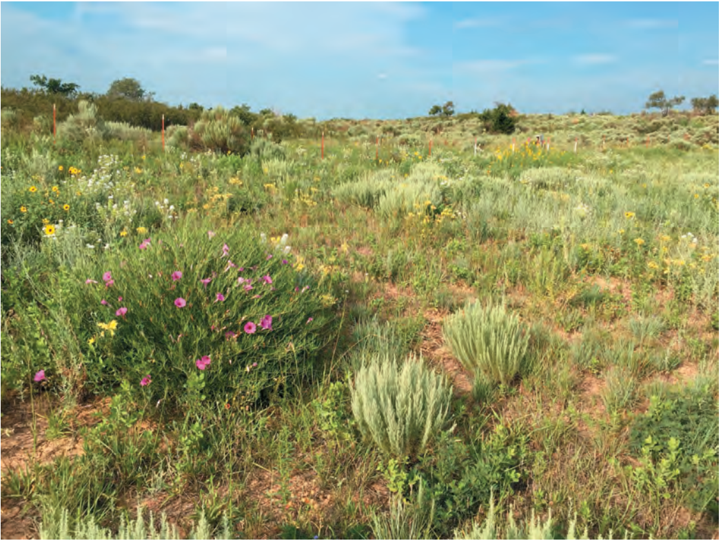
FIG. 3. Sandsage prairie, Woodward County, Oklahoma. Prominent forbs include Dimorphocarpa candicans , Helianthus petiolaris , Ipomoea leptophylla , and Oenothera rhombipetala .

co-dominate the shrub stratum. Prunus pumila var. bessseyi is more prevalent in northern stands while Prunus angustifolia is limited to southern stands.