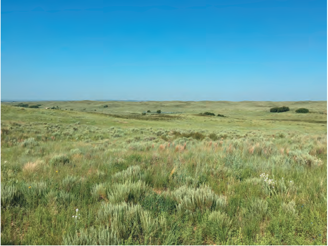
FIG. 2. Sandsage prairie, Hemphill County, Texas.

Other widely occurring regular graminoid associates of sandsage prairie include Aristida purpurea , Bouteloua hirsuta , Cyperus schweinitzii , Elymus elymoides , Eragrostis trichodes , and Vulpia octoflora .