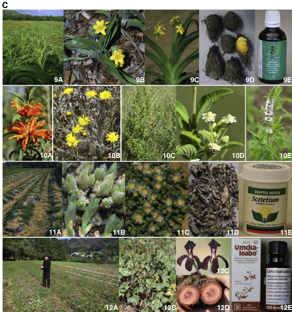
Fig. 1 (continued).

Management: Biodiversity Act of 2004 (NEMBA) came into effect on the 1st of April 2008. The Act attempts to ensure the equitable distribution of the benefits to be derived from the commercialisation of the South African flora. The implications of benefit sharing in practice have been discussed by several authors in the book edited by Denzil Phillips International (2009). Whilst the aims of the Act are laudable, the implementation of the regulations is impractical and may inadvertently discourage rather than encourage innovation in this potentially important sector of the economy. A review of relevant legislation and regulations can be found elsewhere in this issue (Myburgh, in press).