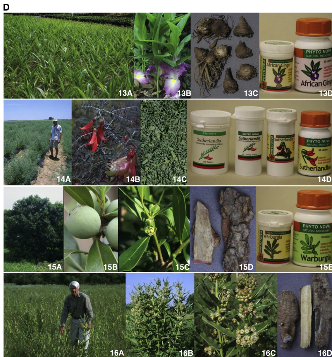
Fig. 1 (continued).