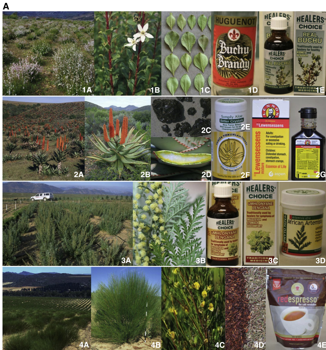
Fig. 1. South African medicinal plants of current commercial interest and examples of products. 1, Agathosma betulina (1A, plantation, planted ca. 1993; 1B, flowers; 1C, leaves; 1D, traditional tincture; 1E, tincture developed by South African Druggist in 1996); 2, Aloe ferox (2A, plantation, planted 1976; 2B, flowering plant; 2C, aloe lump/aloe bitters; 2D, cut leaf showing gel and yellow juice; 2E, example of container with aloe bitters; 2F, an example of an aloe gel drink; 2G, example of a bitter tonic containing aloe lump); 3, Artemisia afra (3A, plantation, planted 1995; 3B, leaves and flower heads; 3C, tincture developed by SA Druggists in 1996; 3D, tablets, developed by Phyto Nova in 2002); 4, Aspalathus linearis (4A, plantation; 4B, plant of the commercial Red tea type; 4C, leaves and flowers; 4D, red and green rooibos tea; 4E, modern rooibos product). 5, Bulbine frutescens (5A, plantation; 5B, flowering plant; 5C, flowers; 5D, leaves showing gel; 5E, commercial product, ca. 2002); 6, Cyclopia species (6A, C. genistoides ; 6B, C. intermedia ; 6C, C. subternata ; 6D, honeybush tea; 6E, example of modern packaging); 7, Harpagophytum procumbens (7A, flowering plants; 7B, stems of various Hoodia species; 7C, tincture; 7D, example of modern product). 9, Hypoxis hemerocallidea (9A, experimental plantation, ca. 2000; 9B, 9C, flowering plants; 9D, corns; 9E, tincture); 10, medicinal teas (10A, Leonotis leonurus flowers; 10B, Leysera gnaphalodes flowers; 10C, Lippia javanica plant; 10D, Lippia javanica leaves and flowers; 10E, Mentha longifolia leaves and flowers); 11, M. tortuosum (11A, experimental plantation, planted 1996; 11B, stems, showing sclerotised leaves; 11C, flowering plant; 11D, traditional product; 11E, tablets developed by Phyto Nova in 2000); 12, Pelargonium sidoides (12A, first plantation, planted 1995; 12B, flowering plant; 12C, flowers; 12D, roots; 12E, tincture). 13, Siphonochilus aethiopicus (13A, plantation; 13B, flowering plant; 13C, rhizome and roots; 13D, tablets developed by Phyto Nova in 2000); 14, Sutherlandia frutescens (14A, plantation, planted 2002; 14B, flowering and fruiting plant; 14C, dried leaves; 14D, tablets – prototypes and products – developed by Phyto Nova in 2000); 15, Warburgia salutaris (15A, tree; 15B, fruit; 15C, leaves and flowers; 15D, bark; 15E, tablets made from leaves, developed by Phyto Nova in 2000); 16, Xysmalobium undulatum (16A, commercial plantation; 16B, flowering plant; 16C, leaves and flowers; 16D, roots).

produced by the Veld Foods initiative in Botswana (ca. 1995) and the Healer's Choice range of branded products developed by South African Druggists (now incorporated