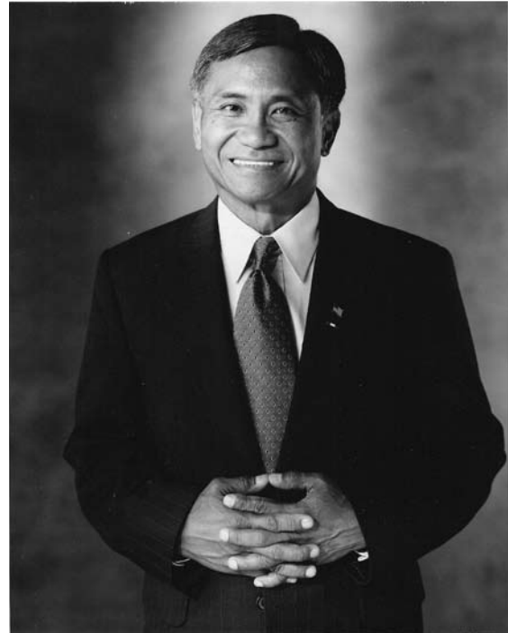
Major General (Ret.) Antonio Taguba